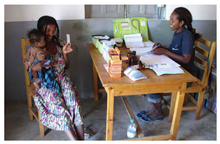
Twenty-three year old woman requesting contraception for the first time, after the birth of her foutth child.

Ventures Conservation has meant that the project can take advantage of the excellent relationships developed with the community, and all pre-existing infrastructure and support systems. It also means that each member of the team understands and can talk with confidence and enthusiasm about the importance of this work. Every communication with different community groups, regardless of the primary focus of the communication, can now include messages about reproductive health as well as conservation. This has enabled us to reach a