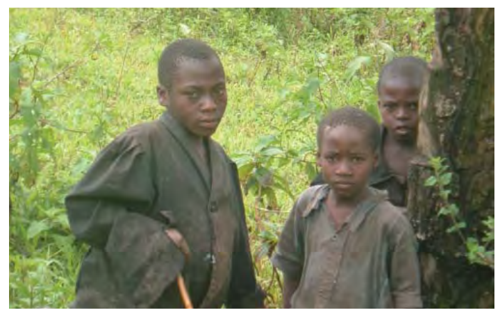
Children bordering Bwindi Impenetrable National Park.

eventually traced to surrounding communities, possibly through contact with scabies mite infested clothing when gorillas left the park to forage on community land. Subsequent community health education workshops revealed that communities benefiting from tourism saw the advantages of improving their health and hygiene to protect a sustainable source of income from gorilla ecotourism. Research on the risks of TB disease transmission at the human/wildlife/livestock interface further emphasized the need for action. As a result of increased awareness, Conservation Through Public Health (CTPH), a registered Ugandan NGO and US non-profit, was formed in 2003, focusing on the interdependence of wildlife health and human health in and around Africa's protected areas. As well as preventing disease transmission, connecting the improvement of human health to wildlife conservation is a key to securing long-term commitment from local people who will protect wildlife for future generations.