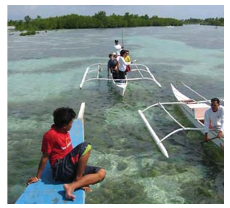
Barangau Sabang, Olango Island

The IPOPCORM Initiative underscores the critical link between population pressures, environmental conservation and sustainable development. As such, it advocates for simultaneous implementation in an integrated fashion of community-based reproductive health strategies, environment-friendly micro-enterprise development (EED) activities, and coastal resources management education and advocacy. Specifically, IPOPCORM seeks to address rapid population growth and migration towards coastal zones - two factors which combined are increasing the pressures