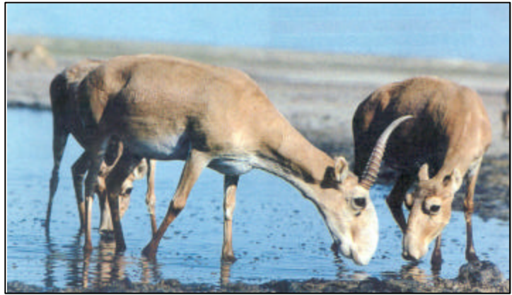
Saiga antelope. One of the few large steppe animals that is still relatively abundant. However it is threatened by poaching and habitat loss.

Steppe habitats are favored by rodents such as ground squirrels ( Citellus ), hamsters ( Cricetus , Cricetulus , Podopus ), voles ( Microtus ), lemmings ( Lagurus ), and marmots ( Marmota bobac ). The only ungulate common in the southern steppes is the saiga antelope ( Saiga tatarica ), which was at the verge of extinction in the early 20 th century but has since recovered, although there is evidence of a recent decline. Wolves ( Canis lupus ), foxes ( Vulpes vulpes , V. corsac ), and steppe ferret ( Mustela eversmanni ) are typical carnivores in this ecosystem.