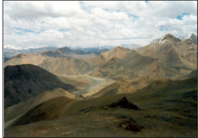
High mountain peaks are home to wild sheep, goats, and snow leopards.

In the West Tien-Shan, lower altitudinal belts are occupied by ephemeral semideserts, while higher (1200 to 2000 m) vegetational zones contain open mountain meadows and steppes (dominated by Elytrigia trichophora , E. repens , Poa bulbosa ) mixed with juniper woodland ( Juniperus turkestanica , J. semiglobosa , J. seravschanica ). Valleys and riparian tracts in the semi-arid steppe zones contain willow, spruce, poplars, Elaeagnus , and tamarisk.