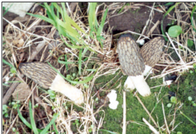
Morels. Edible fungi such as these provide an important resource for local populations, with potential for small-scale commercial production.

Many species of wild plants in Kazakhstan are harvested intensively for food, medicine, and construction. The most important wild food plants are apples ( Malus sieversii ), apricots ( Armeniaca vulgaris ), hawthorns ( Crataegus spp. ), and barberry ( Berberis spp. ). Annual yield of apples, hawthorn, and apricot by forest industry in Kazakhstan is approximately 300 tons. Valuable tanning plants include Polygonum , Rumex , and Rheum spp. Reeds ( Phragmites , Achnatherum ) are used in household construction. Not less than 70 species of plants are used for the production of essential oils (including species of Artemisia , Hyssopus , Mentha , and Achillea ). Medicinal plants are widely distributed in Kazakhstan, mainly in the mountain ranges. Studies of major medicinal plants have demonstrated that most species have enough wild resources to satisfy local demand. Some species, such as licorice ( Glycyrrhiza glabra , G. uralensis ), are present in commercial quantities (estimated 75,000 tons) which opens the possibility of their export.