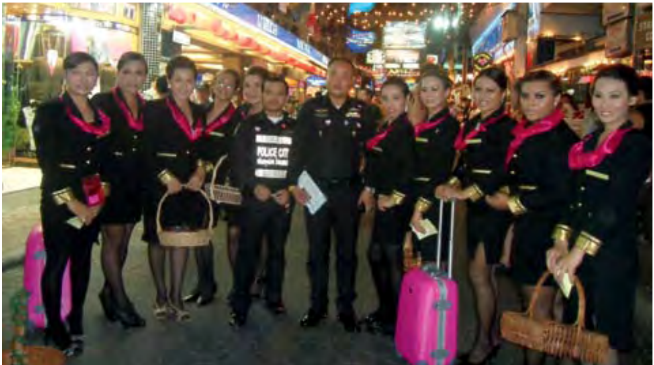
Sisters works with law enforcement officers to reduce transgender-related stigma, discrimination, and violence.

Results from PSI's cross-sectional surveys of TG people in Pattaya in 2005, 2006, and 2009 show an increase in HTC uptake, awareness of available HIV services, and awareness of Sisters and its work (Pawa, Jittakoat, and Mundy 2009; PSI 2005, 2006, 2009). There was also an increase in those who had ever been tested for HIV from 68 percent in 2006 to 77 percent in 2009, and a significant increase in those