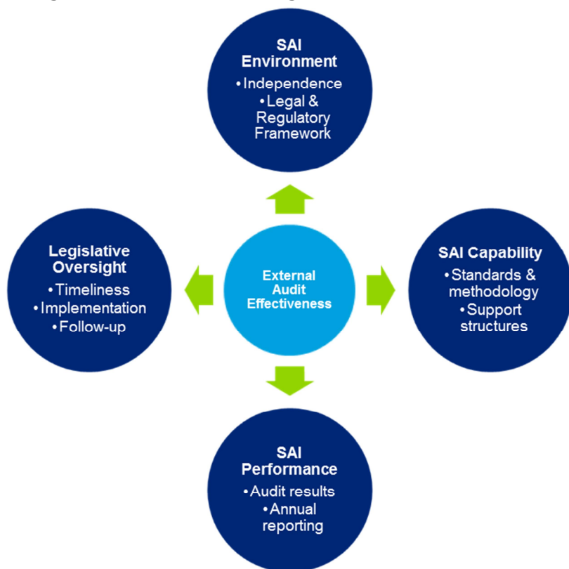
Figure 5 – Factors Influencing External Audit Effectiveness

Table 10 lists leading practices across key sub-dimensions for external audit. As with internal audit, there is a general trend of solid legal and regulatory frameworks, but implementation varies drastically. Practices across scope, nature, and follow-up on external audits vary significantly; overall, fewer gaps in leading practices exist for external audit than for internal audit. In all nine focus countries, there is a relatively autonomous SAI that is constitutionally or legally mandated to maintain independence and conduct external audits of the central government’s finances, but their ability to enforce audit and accountability laws varies greatly. Auditing standards also vary between the countries. Some countries have adopted, or are in the