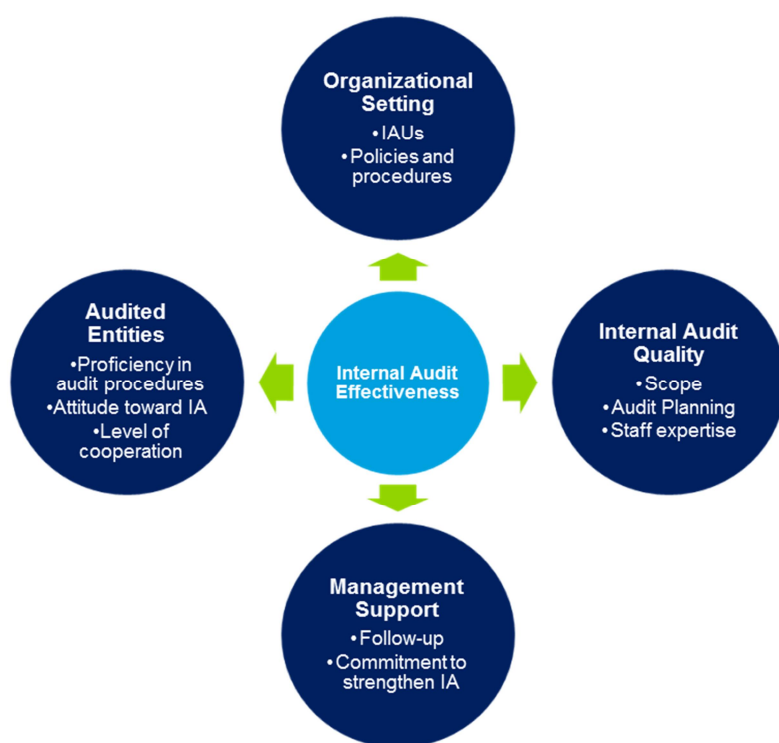
Figure 4 – Factors Influencing Internal Audit Effectiveness

Elements of internal audit include the legal and regulatory framework, audit standards, and internal audit operations (including available resources and corrective measures). Table 9 lists leading practices across key sub-dimensions for internal audit. As further shown in Table 13 in Annex 1 (PI-21), the focus group is generally lagging against leading international practices. The majority of the focus group countries have not yet adopted an internal audit methodology that examines performance and value for money, and instead continue to focus on accuracy of operations or financial accounts. There has been a positive trend of reform among all countries, as there have been efforts to strengthen internal controls (as Honduras , Jamaica , and Paraguay demonstrate), and even introduce advisory agencies (as Colombia has done). Nevertheless, governments need to continue improving their internal controls, audit functions, and corrective measures in order to ensure the efficiency and effectiveness of service delivery.