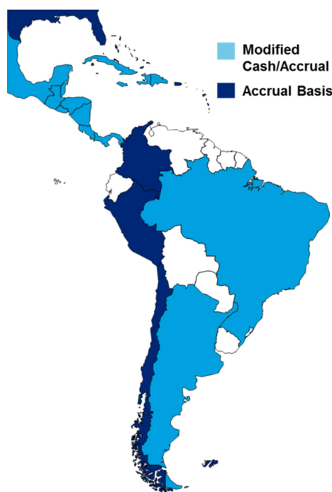
Figure 3 – Government Accounting Standards in the LAC Region