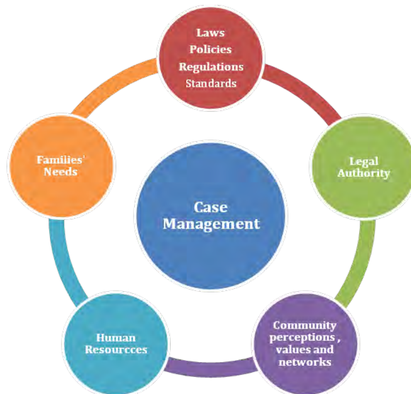
Figure 3: Influences on case management