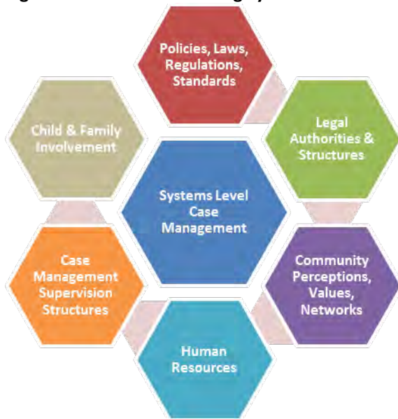
Figure 1: Elements Influencing System Level Case Management