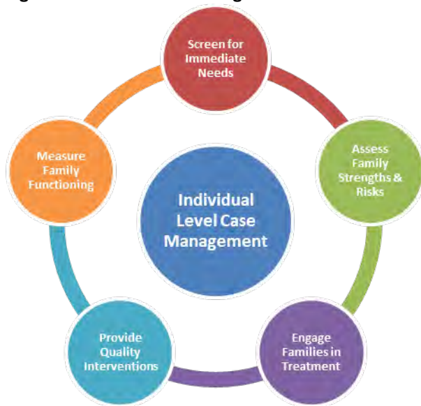
Figure 2: Elements Influencing Individual Level Case Management

There are numerous theoretical models that are available to guide individual level case management. All of them offer differing lenses on the most important elements of a good practice model (Flick, Murphy, & Allen, 2001; Weil & Karl, 1985). The most common elements that can be considered standards of practice are shown in Figure 2.