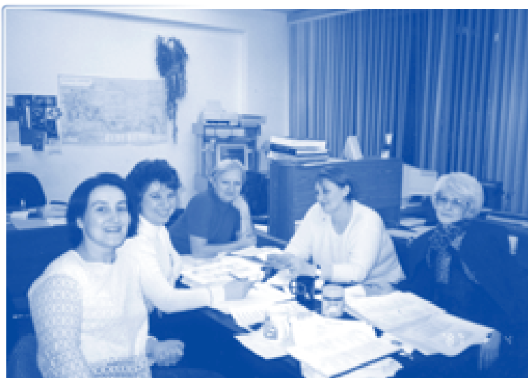
Members of MCGS review findings from their gender analysis of Russian legislation

Through its research and extensive, often groundbreaking documentation, MCGS promoted public awareness about gender-related issues and trends. Roundtables and workshops on each of the four theme areas were organized, and both print and broadcast media were used for wide dissemination. This included journal, magazine, and newspaper articles, and appearances of the research team on news programs and talk shows. MCGS also used the Internet to disseminate findings and participate in conferences. In addition, the MCGS project directly and indirectly contributed to the drafting and