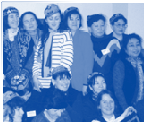
Women's rights activists from the Central Asian Republics participate in a WLDI training session

efforts on domestic violence as a human rights violation, conducting a series of workshops at schools and factories and with local NGOs to create a base of advocates in favor of amending relevant laws. Many project participants found that constituency building through awareness-raising and educational initiatives not only built sustainable citizen participation, but was also viewed by governments as nonthreatening.