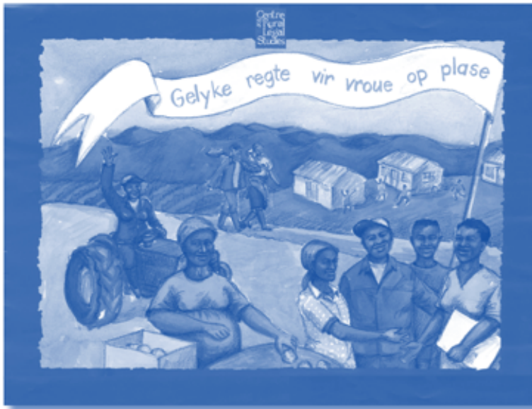
Materials produced by the Centre for Rural Legal Studies to promote equal rights for women on farms in South Africa

Throughout the project, the Centre collaborated closely with the CGE. As a result, the Centre was invited to host workshops for the Western Cape CGE and the Departments of Agriculture, Labor and Land Affairs, to raise awareness of CEDAW and to work with public servants to develop gender-sensitive indicators of achievement. The CGE has now pledged to conduct research on pay equity in agriculture, used the research to evaluate South Africa's compliance with CEDAW, and collaborated in developing a set of indicators to track achievement in formulating gender-sensitive policy with regard to the status of rural women. These indicators include incorporating a focus on rural women in program and budget preparation; prioritizing research on women living or working on farms; complying with anti-discrimination provisions under CEDAW; and making available education, training, and services in support of women's rights.