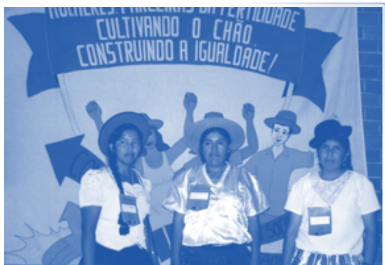
Bolivian women of the Via Campesina movement gather at a Latin American assembly in Brazil

The workshops and follow-up exchanges resulted in advocacy initiatives, including proposals to modify laws related to women farmers and land reform. Groups met with government officials in their countries on a range of issues, including access to credit and