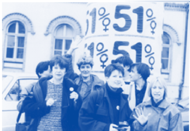
B.a.B.e. and Ad Hoc Coalition members spread their election campaign messages throughout Zagreb, Croatia

In collaboration with its Croatian NGO network, B.a.B.e. prepared the NGO Report on the Status of Women in the Republic of Croatia , which it presented at the January 1998 session of the Committee on the Elimination of all Forms of Discrimination against Women (the CEDAW