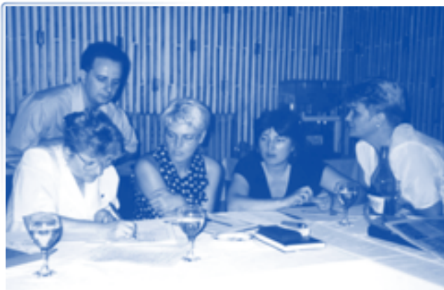
Participants in a regional consultative meeting in Drobeta Turnu-Severin, Romania

at least comparable to those of male colleagues. Those fortunate enough to hold jobs often cope with unfavorable work conditions such as