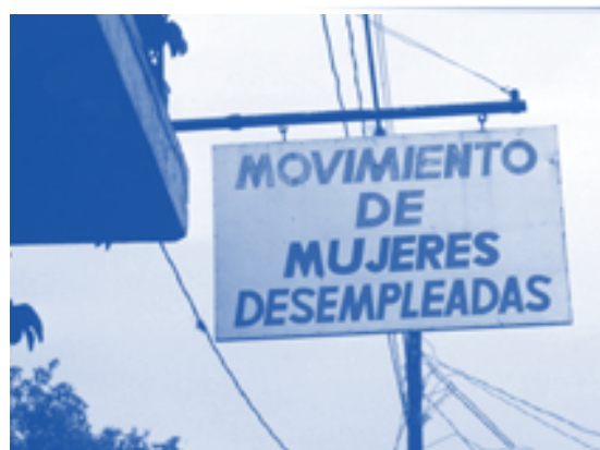
Cenzontle’s ongoing work in the areas of credit, technical support, and training helped generate jobs for unemployed Nicaraguan women

to strengthen their self-confidence, skills, and organizational abilities. In one indication of the change that resulted, the women who participated in the Cenzontle project were at the forefront of community recovery efforts following Hurricane Mitch in October 1998.