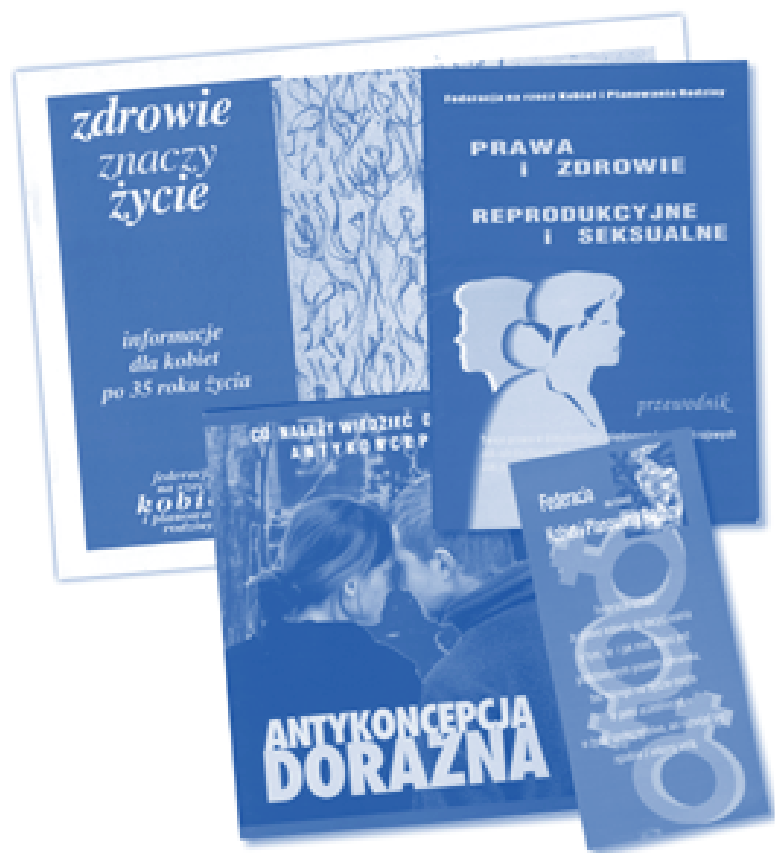
Public education pamphlets on women’s sexual and reproductive health prepared by the Federation

One of the main goals of the project was to equip women with skills and knowledge needed to create change through democratic processes. This was accomplished primarily through the production and dissemination of written materi-