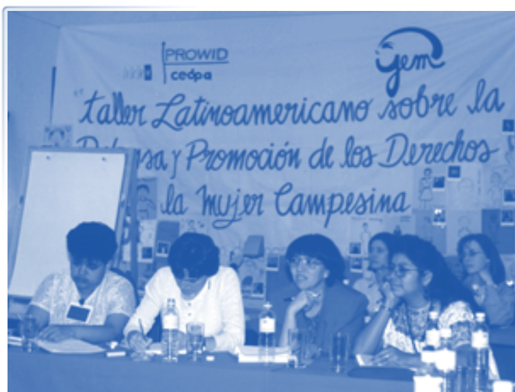
PROWID project partners participate in a regional workshop on advocacy and the promotion of rural women’s rights in Latin America hosted by GEM

GEM’s project activities raised the visibility of women’s work and the value of their contributions to the Mexican economy and society. This was possible because GEM acknowledged the importance of exploring its own strengths and weaknesses, a process that “professionalized” its performance, elevated its image, and made its work better suit the needs of its constituencies.