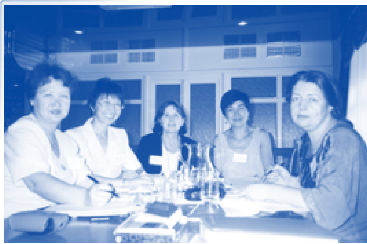
Project participants meet at an advanced human rights training for NGO leaders in Kiev, Ukraine

vulnerable to human rights violations and in possession of few skills or opportunities for redress. Growing unemployment and wage cutbacks, as well as the dismantling of social services such as day care, have hit women the hardest because of their unequal and often insecure place in the labor market. Other worrisome trends include a rise in domestic violence and a loss of trust in law enforcement agencies, with a consequent decline in the reporting of rape and other violent crimes.