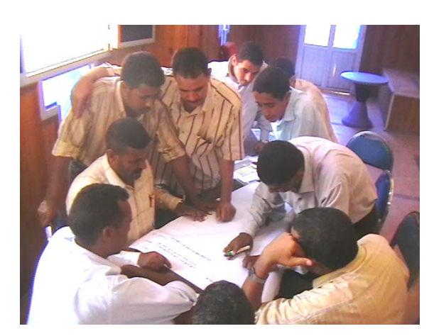
Figure 3 Youth Forum in Assiut preparing IDDPs

district level to develop these estimates. Next, the working groups were provided with practical tools to estimate resources at the district and village levels, and how to allocate resources at the village level.