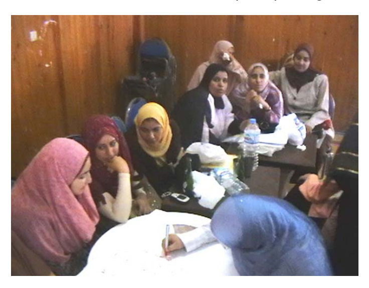
Figure 4 Women's Forum Debating Priority Needs

During the evaluation, the EDI team determined that some LPCs did not have such committees, although they should be playing a pivotal role in the preparation of development plans at the village level. Committees were restructured in several villages, based on geographic criteria, local capacities, and knowledge of budgets.