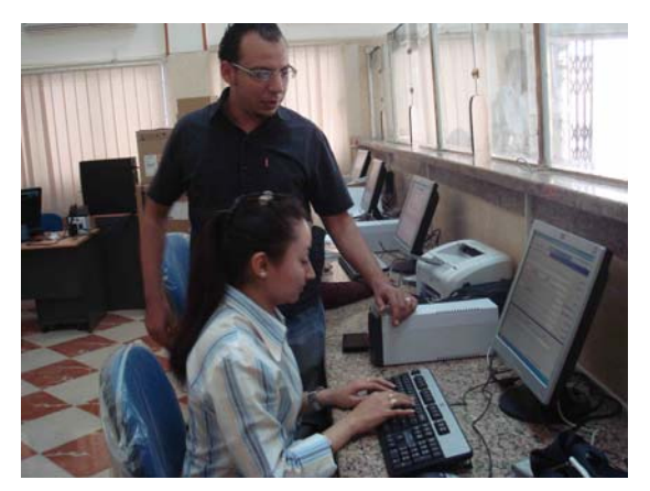
Figure I CSC Application Training in Dayrute

The EDI team prepared financial profiles for pilot Governorates, analyzing revenue and expenditures based on the FY 2003-04 through FY 2006-07 final accounts at the Governorate and district levels, and the special accounts and funds at the Governorate, district, town, and village levels.