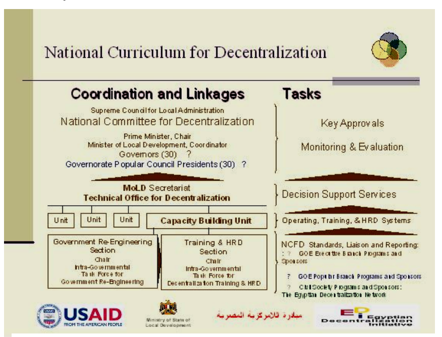
Figure 5 NCfD Participating Organizations and Tasks (Discussion Draft)

Figure 5 represents an organizational structure proposal for the national curriculum. It suggests coordination among the diverse sponsors who would be involved in building and delivering it. EDI is now providing technical assistance for developing the standards and the content for curriculum programs.