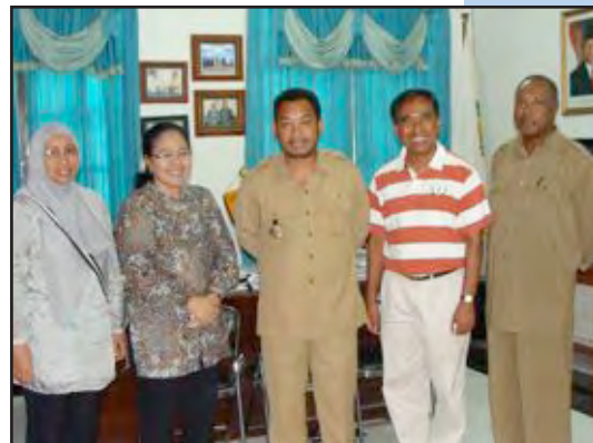
The DBE 2 staff visit the Regent and Vice Regents of Bintuni Bay Regency to discuss their needs and receive permission to implement the DBE 2 PPA workplan in Bintuni.

New activities scheduled this quarter included: 1) conducting the preparation meeting for the Science Teaching and Learning in Higher Education TOT; 2) facilitating the TOT; 3) implementing Science Teaching and Learning in Higher Education training at the PGSD Uncen in Bintuni Bay Regency as a follow up to the ALFHE program; 4) conducting an Active Learning in Schools (ALIS) training in PGSD Uncen in the Bintuni Bay Regency; 5) supervising and mentoring the implementation of ALIS and science training in Bintuni Bay Regency; 6) conducting a Management and Utilization of Learning Resources in Higher Education training; 7) donating two core subject starter kits to PGSD Uncen Laboratory; and, 8) conducting the Evaluation of the final BP-PPA program in Papua.