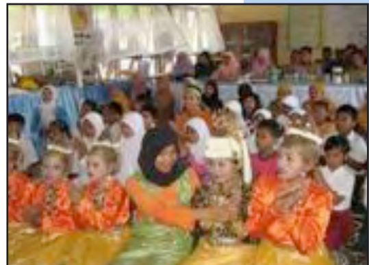
Students from DBE 2 Schools practiced Saman Dance using instructional video

In coordination with DBE 2 Jakarta, DBE 2 Unsyiah developed an instructional video on Saman Siaga Gempa (Earthquake Readiness Traditional Dance). The instructional video explains the lyrics and movements of the dance through the actual dance performance. The objective of this video is to teach students a dance and accompanying lyrics which contain earthquake readiness messages. In the previous quarter, DBE 2 Unsyiah socialized this video to DBE 2 Cohort 1 schools in the Syiah Kuala Cluster. During this quarter, DBE 2 Unsyiah conducted the socialization and training of the Saman Siaga Gempa instructional video to all other DBE 2 Cohort 1 schools. The activities were conducted at the cluster level in each CRC. The objectives were to socialize and simulate how to use the interactive audio/video and to train art teachers to be able to teach their students the Saman song and dance.