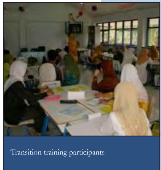
Transition training participants

The three day training was broken down into several sessions. On the first day, several topics were presented, including theme mapping and network, annual and semester program development based on academic calendar. On the second day thematic learning and syllabi development for lower and upper grades were discussed. On the third day was simulation of teaching by using the thematic lesson plans, lesson plan and simulation review, and reflection.