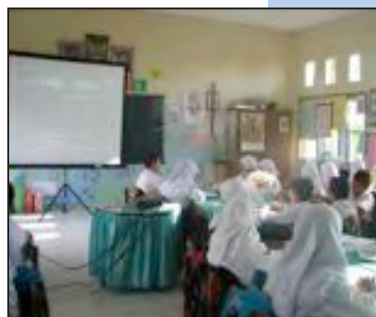
A teacher using the Jeopardy game with students

Students in ICT classrooms were very enthusiastic. The teachers enjoyed the learning process and much time was saved. Most of the students said that learning with ICT was enjoyable, among the other things, because of the games and music.