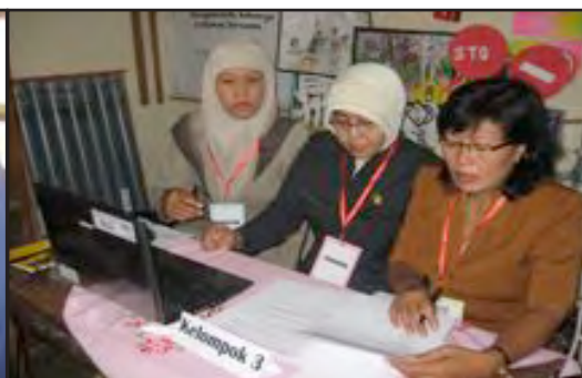
Participants at Nusa Indah Cluster preparing lessons during the session "Computer Challenge."