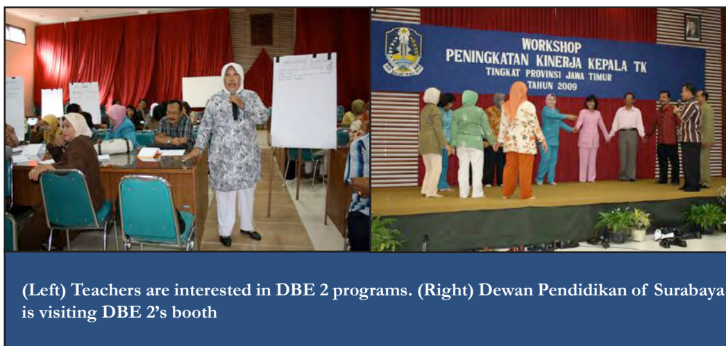
(Left) Teachers are interested in DBE 2 programs. (Right) Dewan Pendidikan of Surabaya is visiting DBE 2's booth

schools. As a result of this activity, it is anticipated that IAI will be adopted in these 38 Districts.