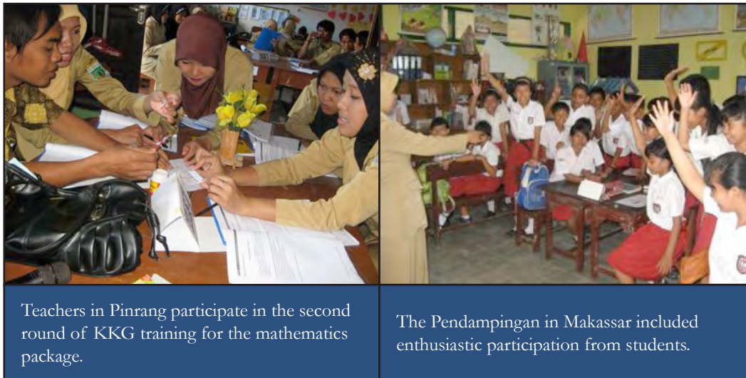
Teachers in Pinrang participate in the second round of KKG training for the mathematics package.