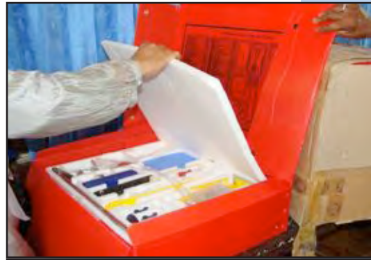
Learning resource supports in SDN 2 Bintuni and Science Kits in SDN PTS 4 Bintuni