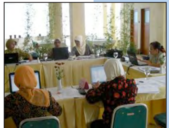
The Science MDT assessment workshop in Batu

The Science adaptation package was completed in mid May with a final assessment by the MDT consisting of five lecturers from State University of Malang/UM and three program staff from East Java DBE 2. The main outcome fo the workshop was agreement on the number of participants eligible to receive certificates from University of Malang, the university partner for the science package in East Java.