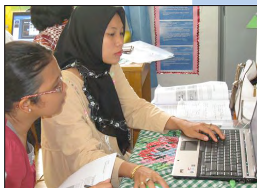
Teacher participate in an Intel Teach Getting Started activity

As a result of the ICT mentoring activities, teachers improved their abilities to use the internet and to apply active learning methodologies to ICT.