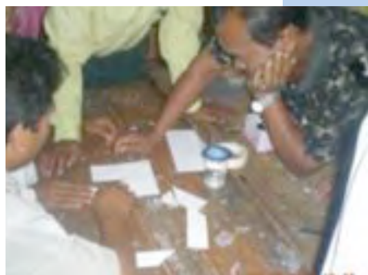
Participants are actively participating in the training