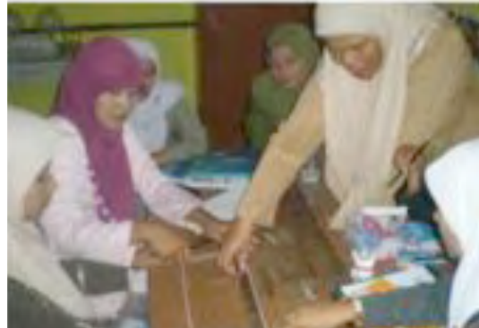
Teachers are practicing making low cost materials

Like in the KKG 2, in the KKKS 2 three main topics were also selected, including analysis of RPP, analysis of Math materials and content for elementary school pupils, and math kit