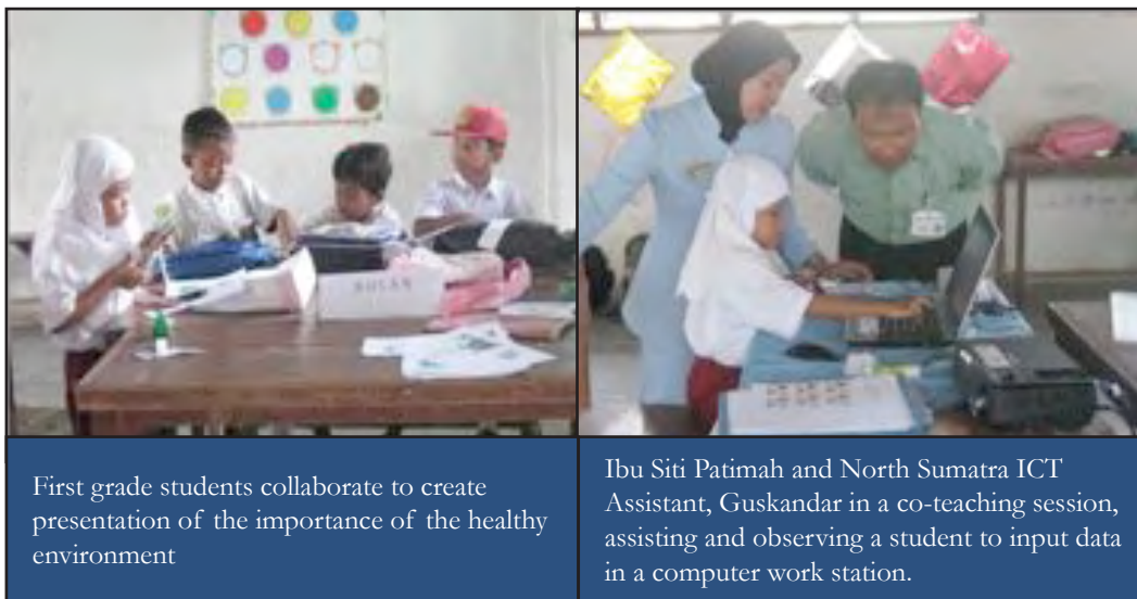
First grade students collaborate to create presentation of the importance of the healthy environment

12 teachers participated. Other provinces, i.e. South Sulawesi, East Java, and West Java have covered more than 60% of the progress and expect to conclude the pilot in September 2009. However, Aceh needed to postpone this activity to suit the schools' schedule in the new academic year of 2009/2010.