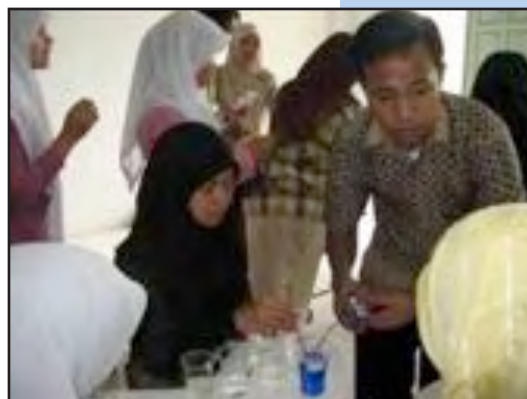
FKIP Students in class – Implementation of Active Learning at Higher Education

DBE 2 Unsyiah has trained a total of 81 lecturers from Unsyiah, UnMuha, and IAIN Ar-Raniry on Active Learning. DBE 2 Unsyiah had also conducted observations of a total of 42 classes/lecturers. Observation results indicate that all participating lecturers are now applying active learning techniques in their classrooms to some degree. Examples of active learning strategies employed include group discussions, student and group presentations, the use of case-studies, simulations, demonstrations, games, and project-based learning. All of these strategies are carried out in a cooperative learning way.