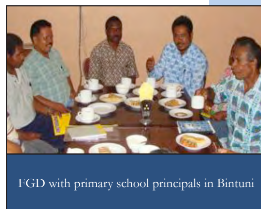
FGD with primary school principals in Bintuni

DBE 2 facilitated three focus group discussions in Bintuni Bay Regency. The first group included the local government from Bintuni Bay Regency; the second group included nine primary school teachers; and the third included ten primary school principals. DBE 2 observed three primary schools in Bintuni (SDN 1, SD YPK, and SDN PTS 4) to obtain data on the utilization and management of the learning resources and facilities in the schools.