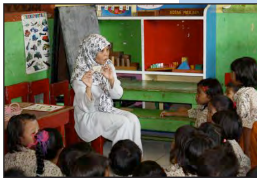
TK Dharma Wanita in Beji, East Java