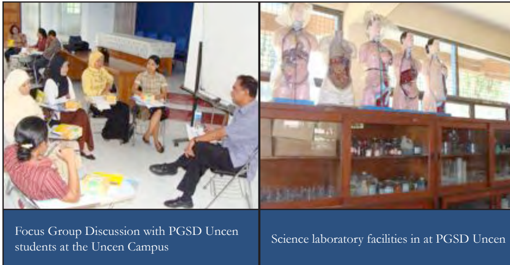
Focus Group Discussion with PGSD Uncen students at the Uncen Campus

Following the implementation of ALFHE activities at Uncen, DBE 2 Jakarta conducted a needs assessment of the BP-PPA program at Uncen on May 6 - 7 and in Bintuni Bay Regency on May 11 - 12. The objectives of the assessment were to identify the needs of FKIP and PGSD Uncen lecturers following the ALFHE program in Uncen and Bintuni Bay Regency