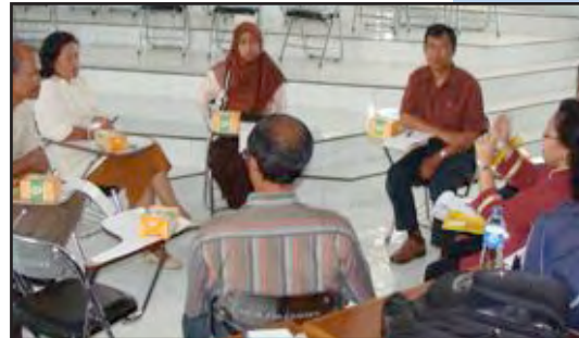
FGD with Science PGSD – FKIP Uncen lecturers in Uncen Campus

DBE 2 through its alliance with BP to support Active Learning for Higher Education (ALFHE) activities in Papua completed a number of activities this quarter including developing the workplan to follow up the ALFHE program in University of Cenderawasih (Uncen). In order to finalize the workplan, DBE 2 conducted a needs assessment activity with stakeholder from Uncen Bintuni schools, and the Bintuni Local government. Based on the assessment, new activities were scheduled for Uncen and Bintuni Bay Regency at West Papua.