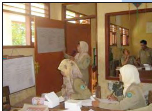
Training participants in Tanggulangin, Sidoarjo enjoyed a discussion on active learning

In Sidoarjo, the transition program for DBE 2's PAKEM approach was held in sub district Tanggulangin, Sidoarjo on June 3-5, 2009. This was the continuation of the same trainings started from March 2009 to June 2009 held in sub district Tulangan, Sedati 03, and Balangbendo 05. The total number of participants reached 516, including 20 school supervisors, 80 principals, and 416 teachers. These numbers could provide impact to 18,421 students in total.