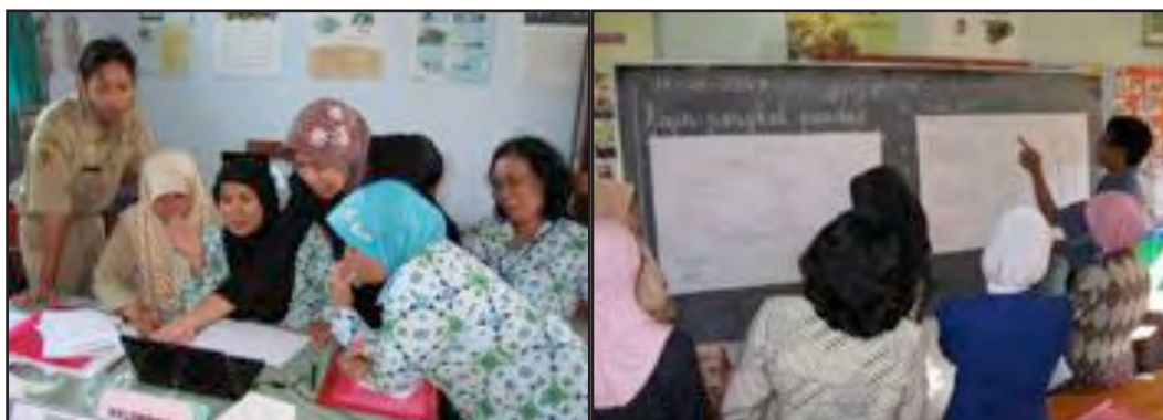
(Left) : Facilitator is guiding participants to operate computer in making digital learning resource. (Right) : The participants are doing a gallery walk after designing class management in using limited computer.

In Sidoarjo, participants were initially cautious because they were unfamiliar with computer operations. Soon participants were staying beyond the sessions to complete the exercises and by the end of the workshop, participants were able to showcase their work