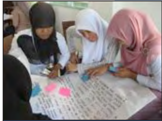
FKIP Students in class – Implementation of Active Learning at Higher Education

In strengthening management, DBE 2 Unsyiah continued to assist FKIP to upload academic data into its database system. DBE 2 Unsyiah developed 25 standard operating procedures (SOPs) for the new FKIP facilities such as SOPs for Classroom, Laboratory, Library, etc. DBE 2 Unsyiah also finalized drafts of Standard Job Description (SJD) for FKIP administration. In addition, DBE 2 Unsyiah conducted the socialization and training of the Saman Siaga Gempa instructional video to all DBE 2 Cohort 1 schools.