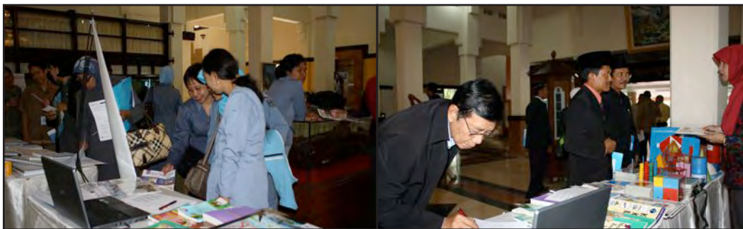
(Left) Teachers are interested in DBE 2 programs. (Right) Dewan Pendidikan of Surabaya is visiting DBE 2's booth