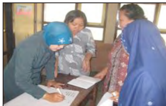
Participants at Nusa Indah Cluster discussed classroom management with limited computers.

MTTs supported by the ICT Coordinator and Assistants facilitated the workshops. Participants now have a better understanding and are more confident in using ICT equipment; they have also gained valuable skills in integrating ICT into the student-centered active learning method.