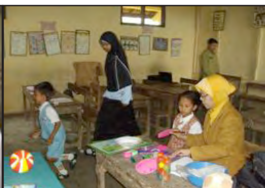
Evaluators test children's motor skills