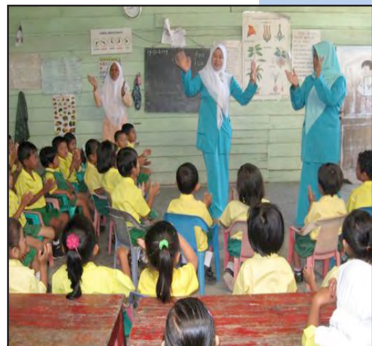
TK post-test at TK Aisyiah Bustanul Athfal, Indrapuri Aceh

M&E team members and two independent testers hired by DBE 2 conducted a post-test for Cohort 2 TK students, covering Aceh Besar, Pidie, Bireuen and Takengon. This program started since May 18. Post-test results have been collected for analysis by the M&E team.