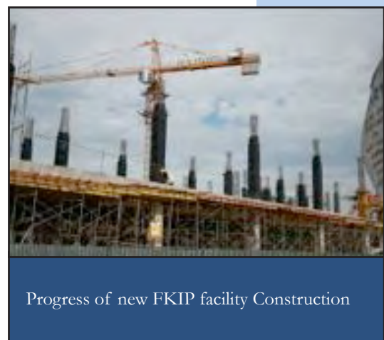
Progress of new FKIP facility Construction

The construction of the new FKIP building (TAPSU) commenced in February 2, 2009 by JO Tokyuu Construction Co. Ltd / PT Duta Graha Indah. It is expected that the construction will be finished in 450 days. During this quarter, several coordination meetings with Construction Management Consultant (PEM), Unsyiah, and FKIP were conducted to discuss floor-layout and the possibility of room adjustment to fulfill the conceptual design. With the conceptual design, classroom space is the first priority. In the original design, the total number of classroom was 26 (8 classes for 60 students and 18 classes for 36 students). Now, after room adjustment, the total number of classrooms is 31 with 8 classes for 60 students and 23 classes for 36-40 students. With the adjustment, the space for teachers/lecturers has been added where active lecturers will be provided offices.