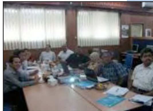
Unsyiah and FKIP Quality Assurances discussed SOPs for new FKIP facilities

DBE 2 Unsyiah developed 25 standard operating procedures (SOPs) for the new FKIP facilities which include SOPs for Classroom, Laboratory, Library, Auditorium, Teachers' Room, Students' Room, Career Center/Alumni Room, Laptop Storage, Dissemination Room, Evaluation and Testing Measurement Room, Private Space Room, Professor Room, Teleconference Room, Prayer Room, Gallery Space, General Storage Room, Administration Room, Public Rest Room, Outdoor Canteen, Cleaning Service and Landscape, Electricity Facility, Water Facility, Internet Facility, Telephone Facility, and Facility Maintenance.