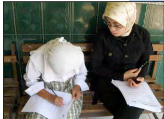
DBE 2 M&E in action. A DBE 2 data collector interviewing a student at Madrasah Ibtidayah Al Ahliyah, Karawang, West Java, as part of the annual schools survey program.

Following new instructions from DBE 2 Jakarta in June 2009, the M&E Team will now also collect data relating to transitional activities in each district which launches them. This data will be reported every quarter.