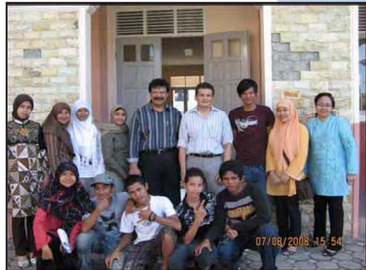
Creative Center youth members together with USAID and DBE 2 staff