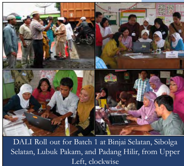
DALI Roll out for Batch 1 at Binjai Selatan, Sibolga Selatan, Lubuk Pakam, and Padang Hilir, from Upper Left, clockwise

The major ICT activity for Quarter 4 was the Developing Active Learning with ICT (DALI) Workshops. The goals of the DALI workshop are to train teachers how to integrate ICT and active learning into their classroom using the limited number of computers and other ICT equipment available to them. Each school provided three teachers for the training and the MTTs from the participating school cluster participated in the workshop. The table below shows the DALI training schedule and the number of participants for each cluster.