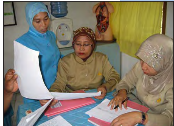
Teachers in Luwu prepare materials and plans for classroom observations in association with the science training package

Roll-out of the science training package continued during this quarter in all nine DBE districts. The second round of KKG, KKKS and in-school support were all delivered during this reporting period. The completion of the second round of in-school support and the assessment of independent assignments of individual participants was completed in the third week of September 2008. All participants' independent assignments were categorized as 'competent' indicating that the training package was successful overall. All field training for the science training package is now complete. The team is to be commended for successfully completing an enormous training effort that involved numerous simultaneous events and significant logistical and scheduling challenges.