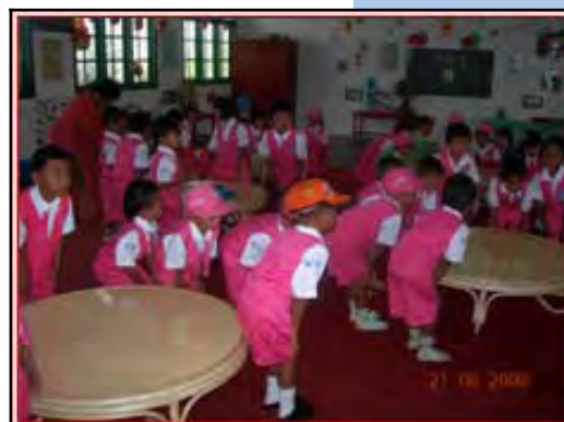
Students of TK Pembina Sidikalang learning new skills by following instructions from the audio program.