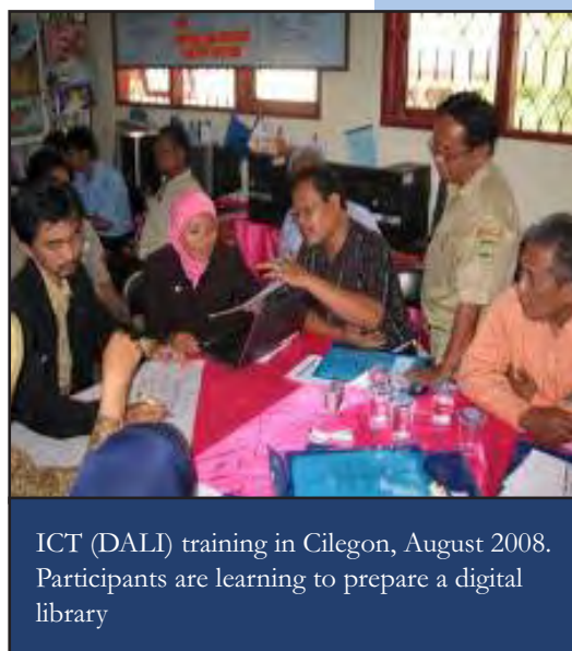
ICT (DALI) training in Cilegon, August 2008. Participants are learning to prepare a digital library