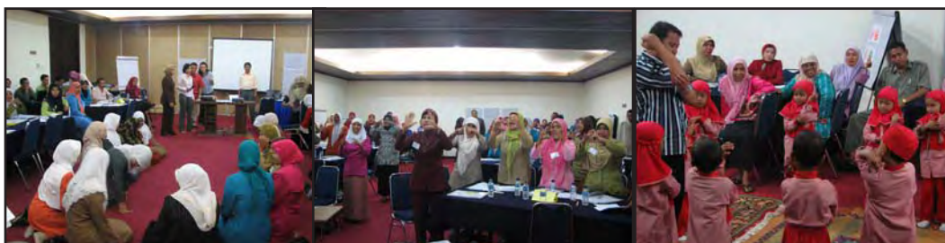
IAI TK training for Cohort 2 TK teachers, principals and MTTs

The training was very successful. All participants were satisfied with the training because it was very beneficial for them in teaching and learning process, especially on how to teaching by employing IAI. TK grants packages were delivered to participating schools following the training workshop. The second Cohort 2 training will take place in Quarter Two.