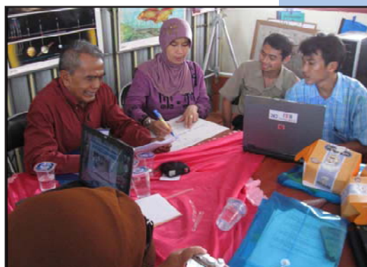
DALI TOT in West Java and Banten

Twenty six participants were involved in West Java and Banten DALI TOT carried out in Cilegon, on August 19-21. Participants were excited and considered the experience to be a fun way of teaching and learning supported by ICTs. They valued the new models of active learning with limited technology; however, inputs were made and they stated that they will need help in adapting it for classroom learning.