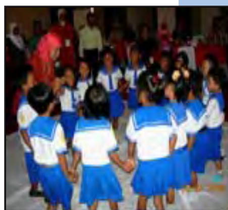
TK Students Playing during IAI Training

In addition to the participants who were to be trained, 15 TK students and two of their teachers were also invited to demonstrate the use of IAI in the classroom. This proved to be an enjoyable and useful demonstration as the participants could see both the actual use of IAI and the effect it had on the students’ learning. All of the students enjoyed the approach and the demonstration, which made a positive impact on the participants and encouraged the participants to develop their own skills accordingly.