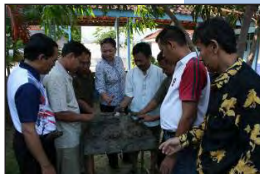
MTTs gathered at SD BPK Penabur in Indramayu sub district, building a model volcano during the video shoot Gunung Meletus.