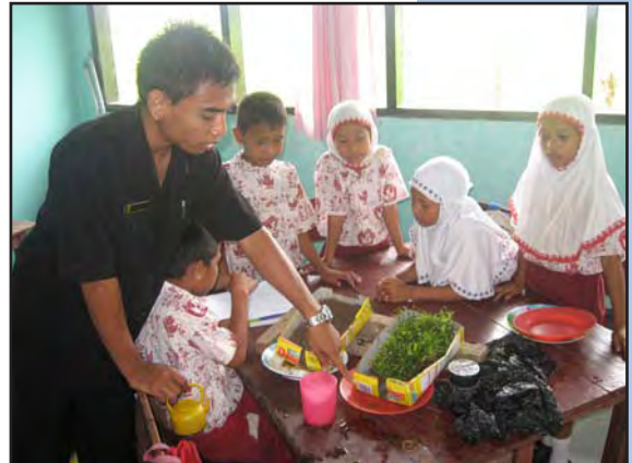
Classroom activities that teachers designed during the science training package, like this one in Luwu, were observed through a peer mentoring process that gave teachers feedback on their lesson plans.

This period has sought to define ways that the provincial team will transition from service delivery to systemic reform; the South Sulawesi provincial transition strategy was drafted following field staff training in East Java. The transition strategy focuses on promoting the sustainability of DBE 2 interventions through the intensified capacity development of cluster personnel. DBE 2 will guide these persons through the delivery of their own, locally-funded training activities. DBE 2 is also exploring ways to link CRCs to the HYLITE distance education initiative by helping partner university, Universitas Negeri Makassar, use these facilities to open new avenues by which in-service teachers can access S1 degree programs.