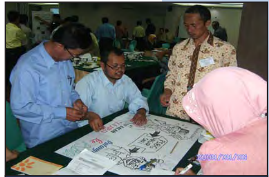
Participants from the CRC Management Workshop in West Java are making posters as part of the Socializing CRC session.

An outstanding achievement was made by South Sulawesi in which they used the roll-out event as an opportunity to train more teachers using independent funding from schools within the clusters. With the encouragement and support from the District Learning Coordinator (DLC) and the Master Teacher Trainers (MTTs), an additional of 546 teachers were trained on the similar subjects as mentioned above. This kind of initiative should be encouraged and implemented in other provinces.