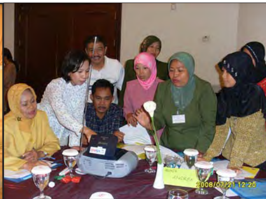
TK teachers and head teachers have their first introduction to the use of the Interactive Audio Instructional program during the Cohort 2 training