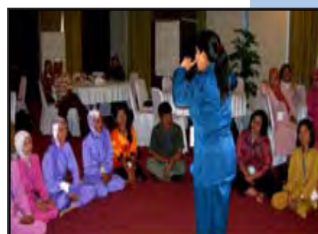
A participant demonstrated how to use IAI