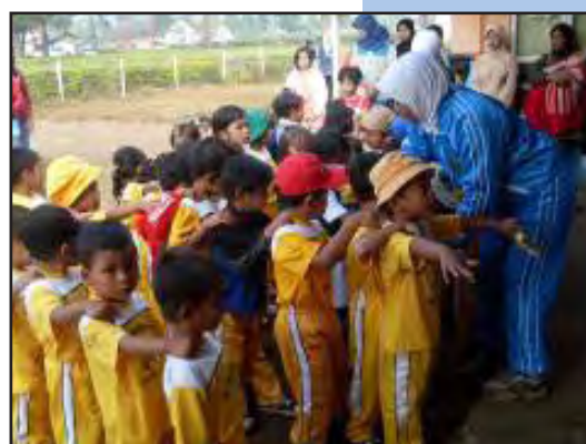
Tri Usaha Bakti Kindergarten, located in a rural plantation area in the Cikajang sub district, Kabupaten Garut, West Java

The Cohort 2 TK program was launched in Kabupaten Indramayu, West Java, over 31 July to 2 August 2008, with an introductory training activity for 52 participants from our 10 Cohort 2 TK and other local stakeholder organizations. Following this the first Cohort 2 TK grants process was commenced with preparation and submission of applications, approvals, and procurement and distribution of materials and equipment. This has gone on for much of the Quarter, and is expected to be completed early in Q1 FY09.