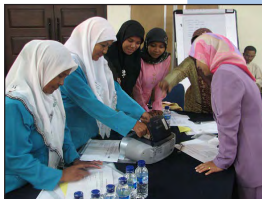
Cohort 2 IAI Kindergarten Teacher Training I participants practiced how to use a CD player

The DBE 2 kindergarten (TK) component made much progress this quarter which marked the commencement of Interactive Audio Instruction (IAI) activities in Cohort 2 schools. During July and August, DBE 2 and partners Pustekkom and UT delivered IAI TK Teacher Training I to teachers and principals from targeted Cohort 2 TK. Following the training, the Paket Program Audio Interaktif (PAI) grant was delivered to all participating Cohort 2 TK. Cohort 1 TK also received Unit 3 and 4 materials. By the end of August, a total of 113 TK were able to implement the IAI program.