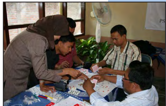
National DALI Orientation Workshop team building activity

A team of facilitators from DBE 2 Jakarta, Central Java and East Java conducted the workshop for 30 participants who consisted of four ICT team members and one DLC from each of the six DBE 2 provincial offices. The workshop focused on activities that introduced the DALI training modules and the concept of active learning using limited ICT resources.