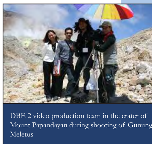
DBE 2 video production team in the crater of Mount Papandayan during shooting of Gunung Meletus

On September 18-24 the DBE 2 video production team travelled to Kabupaten Garut and Kabupaten Indramayu to conduct site surveys and undertake preliminary video shooting.