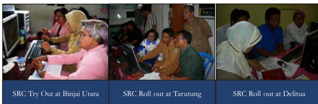
SRC Try Out at Binjai Utara