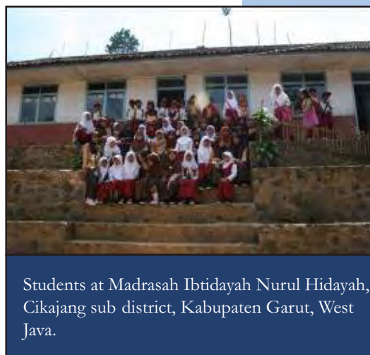
Students at Madrasah Ibtidayah Nurul Hidayah, Cikajang sub district, Kabupaten Garut, West Java.

Over August 19-21 a provincial-level TOT DALI in Cilegon introduced all of the MTT assigned to support ICT in Cohort 1 and selected local teachers to DALI Module 2, Module 3, Module 7, and other related materials for active learning with ICT. These modules will next be implemented at the cluster level. The TOT DALI was conducted by the provincial ICT Team and DLC Pak A. Syathori.