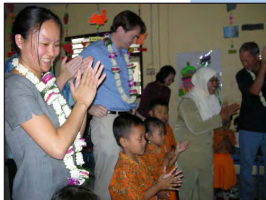
US Congressional Staff visited TK Dharma Wanita Sedati Gede, Sidoarjo.