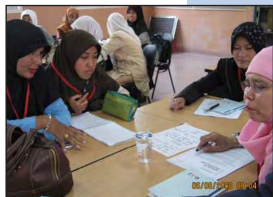
Group participants at the Action Research Workshop

During this quarter, DBE 2 Unsyiah conducted a five day workshop on Action Research Workshop in Education. The activity was from August 4 - August 8. Prof. King Beach and Prof. Jeff Miligan from FSU were the facilitators. A total of 24 participants followed the workshop (ten from FKIP Unsyiah, three from Tarbiyah UnMuha, six from Tarbiyah IAIN and five were teachers from local primary, junior and senior high schools). The objectives of this workshop were to train the participants on how to conduct action research in education: problem identification, the methodology, the analysis, the data interpretation and the proposal writing.