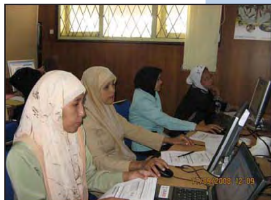
Basic ICT tutorial participants