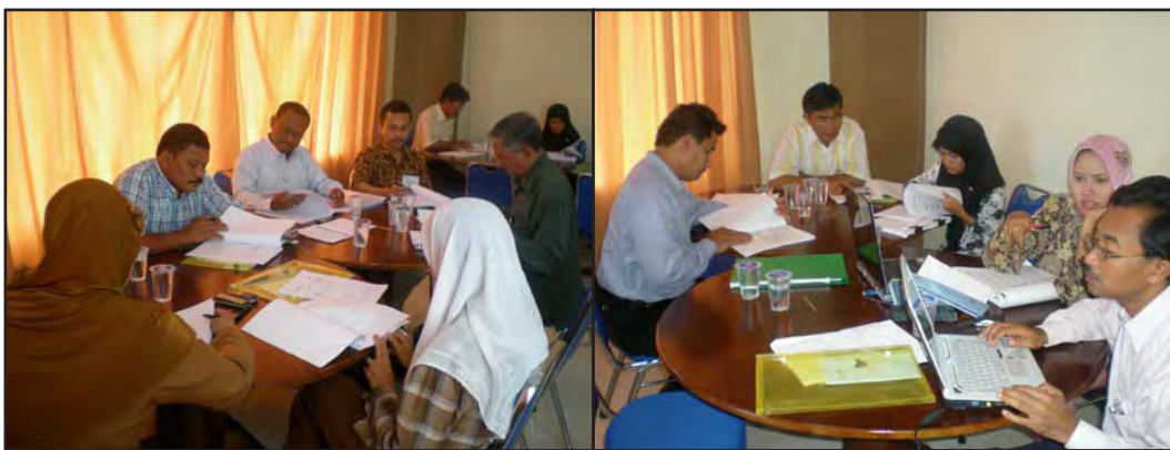
MAT, DBE 2 staff, teachers, and Diknas and Depag staff reviewing the Math Training Package

The representatives of local government agencies really appreciated taking part in the meeting because they received information not only about the programs being implemented in Aceh by DBE 2, but also in depth knowledge of the adaptation process.