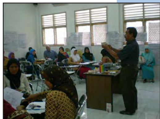
STW activities in Syiah Kuala

Some of the participants commented that the activities during the STW were so meaningful for them that they will seriously participate in similar activities in the future. The STW has transferred useful knowledge and skills to them; accordingly, manage their school programs more professionally, supervise the teacher activities, and monitor the school activities. One of the school principals said that the STW “rang the bell.” Such activities are much needed, the same principal commented.