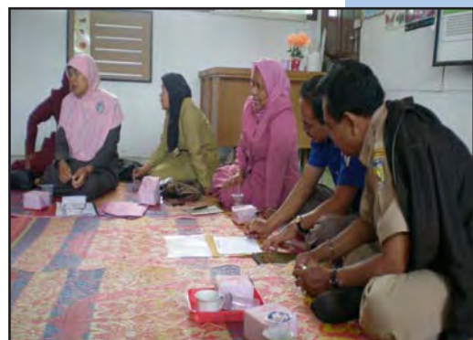
Mentoring activities in Aceh Besar

The roll-out of all Civics Training Package activities was completed this quarter in Cohort 1 schools. Mentoring 2 for Civics was conducted at 21 DBE 2-supported schools in Banda Aceh district on August 4-15 and in Aceh Besar on August 21-22 and October 13-20. A team of six people visited each school cluster to implement the mentoring program. The purpose of the Mentoring 2 was to help teachers improve their teaching quality and skillfully and cooperatively manage their classrooms. During mentoring, teachers showed their syllabi and lesson plans to the mentors in order to receive feedback. Mentors observed teachers teaching their lessons and discussed with teachers how their lessons plans were being implemented.