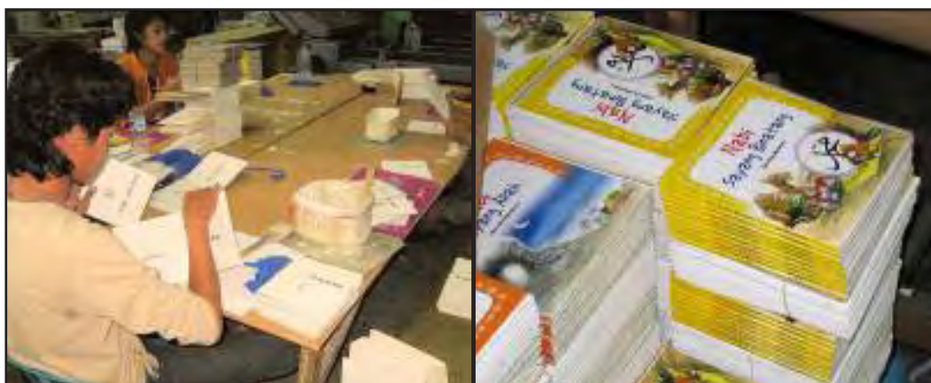
Childrens' reading book production at a Bandung publishing company.