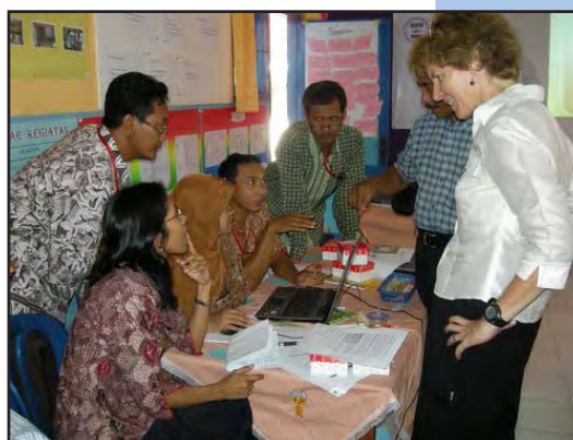
DALI TOT in East Java