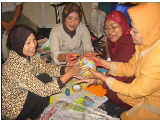
TK teachers enjoy 'hands on' activities practicing with learning materials during training in Makassar

The kindergarten (taman kanak-kanak or TK) moved forward with training for Cohort 2 TK in three Cohort 2 districts: Sidrap, Pinrang and Luwu. Makassar City, which is a Cohort 2 district, was included in the Cohort 1 TK program and so had already completed this training