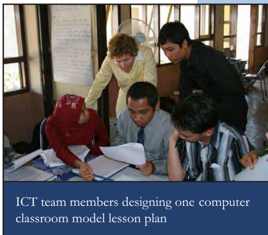
ICT team members designing one computer classroom model lesson plan

During the workshop participants were exposed to a number of one computer classroom lesson plan models. The activities allowed the participants to gain a new level of confidence to carry out similar trainings in the future.