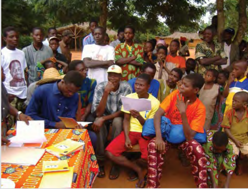
Men and boys in Allada, Benin receive booklets on the new family code at a training held by Droits de l'homme, Paix, et Développement in August 2005.