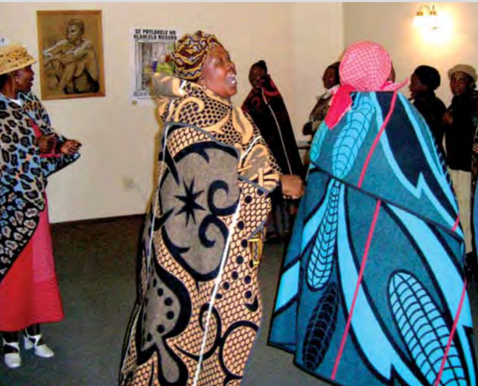
BOTTOM: In Mochale's Hoek, Lesotho in September 2006, Basotho women take a break from their paralegal training to dance and sing. Participants were provided instruction in laws and job skills, and after the training, they established paralegal communities to support and evaluate their work.