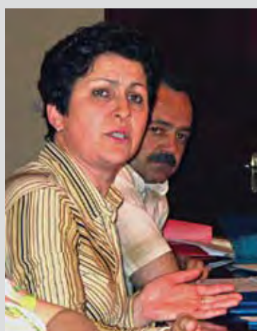
Municipal public administrators participate in a seminar on women's rights in Pogradec, Albania, in May 2006.

WLR and its partners spread knowledge of women's rights in Albania