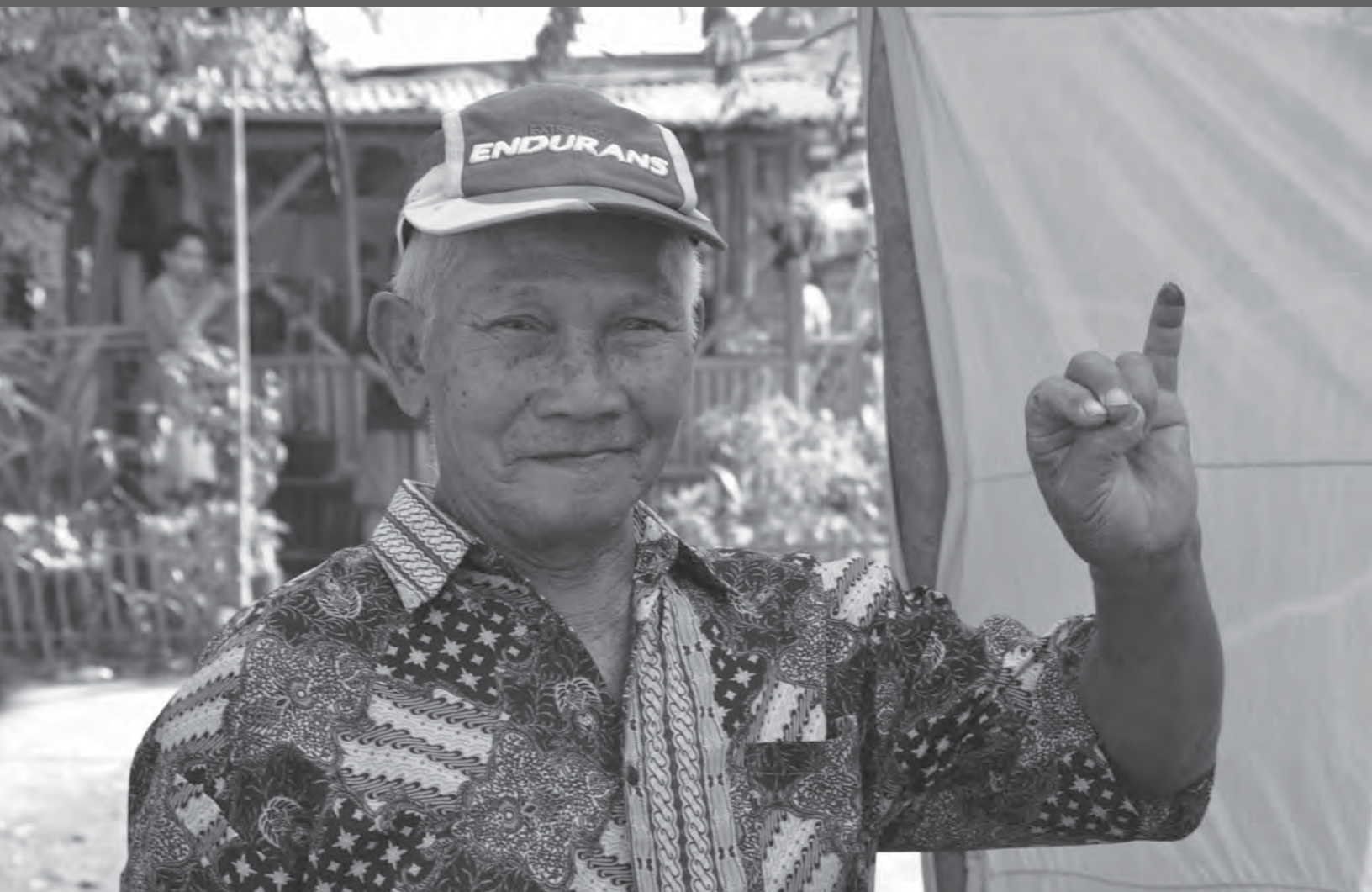
Man displays inked finger after voting in the July 2009 Indonesian Presidential Election.

Electoral conflict remains an obstacle to the consolidation of democratic institutions for many countries. Even in stable political environments, elections can fall victim to conflict. Although a problem that is global in scope, electoral conflict and its root causes, profiles and intensities differ in each country context. If development programming is not undertaken to prevent, manage or mediate electoral conflict, then elections risk becoming venues for violence and intimidation, where conflict is employed as a political tactic to influence electoral outcomes. The importance of this issue extends beyond the electoral process alone, as the legitimacy of the resulting government is also at risk in situations where conflict has been employed to achieve governance. Perpetrators of electoral conflict may act without legal consequences, engendering a culture of impunity for such crimes. Recurring elec-