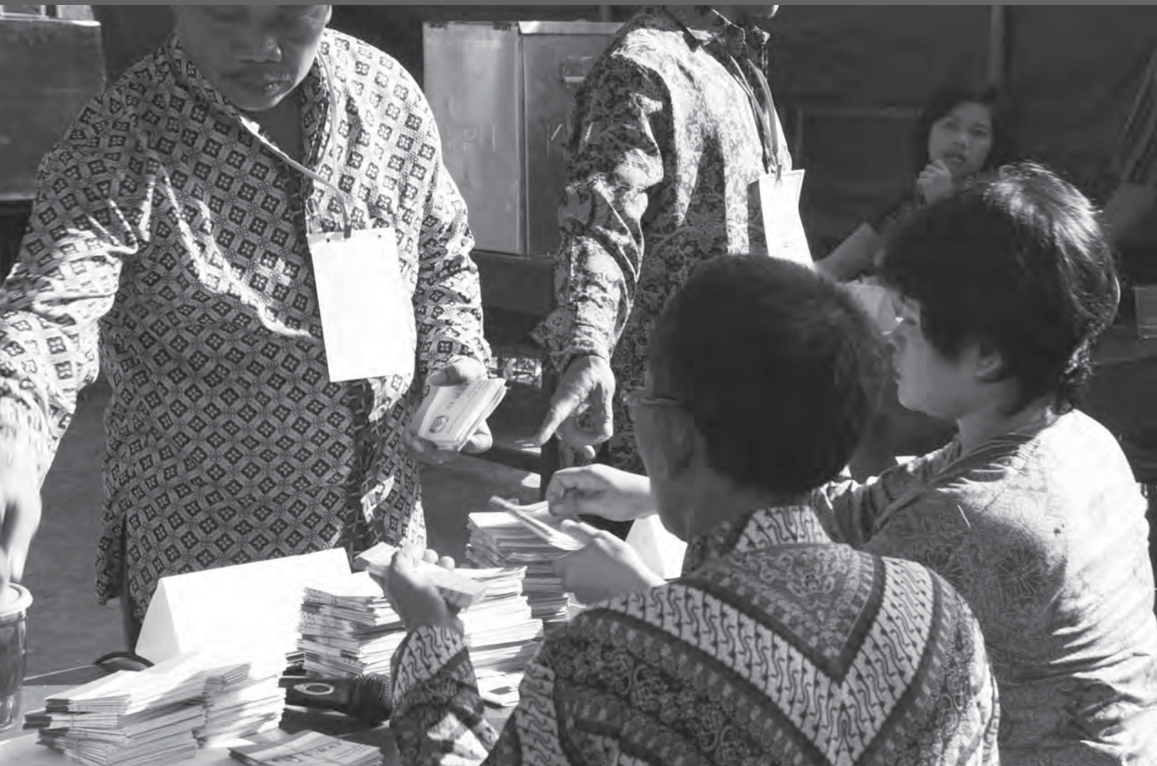
Poll workers sort ballot materials in advance of the July 2009 presidential elections in Indonesia.

Electoral security programming is intended to develop legal architectures guiding state and non-state stakeholders in the capacity to prevent, manage or mediate electoral conflict. Such programming involves both rules-based and values-based approaches to ensure peaceful electoral competition and post-election reconciliation.