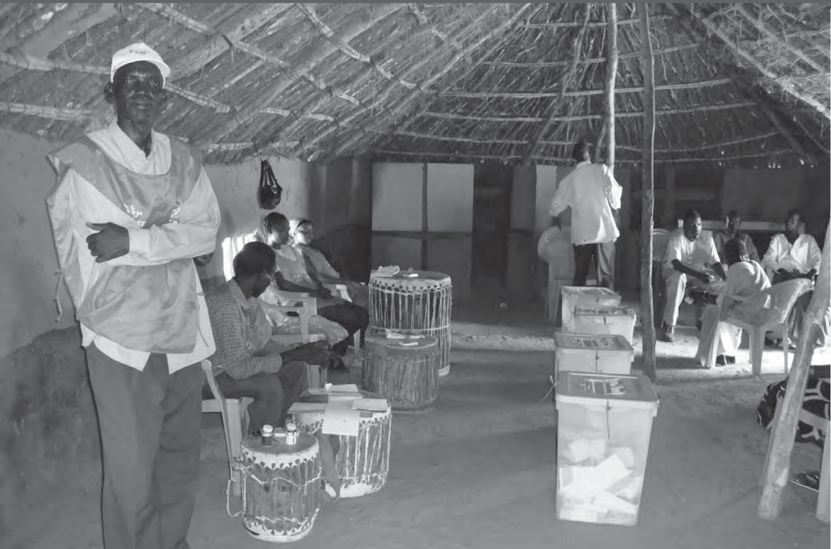
Poll workers await voters at an indoor polling station in Bentiv Biemruok, Sudan on April 13, 2010.

The foundations for a robust M&E approach were established during the Assessment, Planning and Programming phases. Building on this information, the M&E phase of the Framework will assist with defining a performance management plan (PMP). A good PMP is critical, particularly in rapidly evolving situations, for both assessing progress against desired results and testing the validity of the development hypothesis.