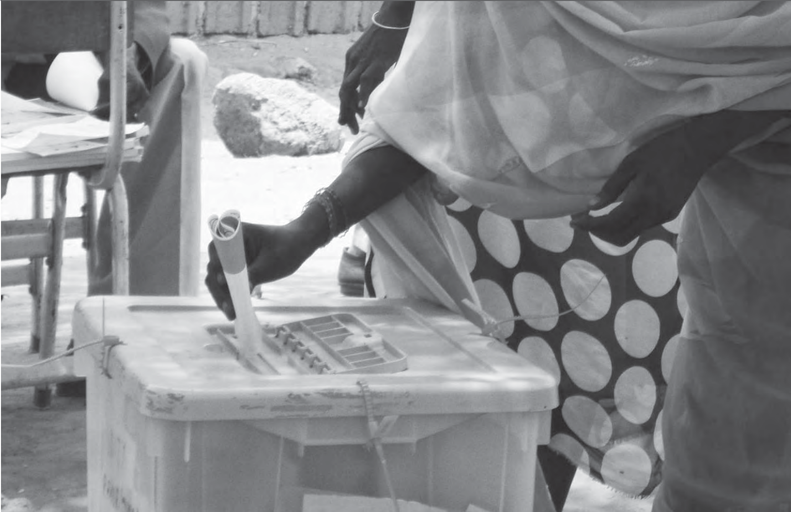
A woman casts her ballot at a Rubkona Pakur polling station in South Sudan on April 14, 2010.

This subject matter can be introduced through a trio of fundamental definitions: 1) electoral security; 2) electoral conflict; and 3) electoral justice. Electoral security is the end-state; electoral conflict is the development challenge; and electoral justice is one of the key mitigating factors. These three concepts are discussed in tandem because they collectively embody electoral conflict dynamics.