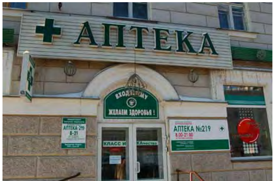
A municipal pharmacy in Yekaterinburg

Interviews with pharmacists indicated that the fastest-growing brands are third-generation pills such as Yaz, Yarina, and Diane 35, which are the most expensive. Pharmacy retailers actively market such brands to doctors. Mid-price products such as Marvelon, Regulon, Novynette, and Lindynette are market leaders among mid-income and younger women, though users are beginning to purchase newer formulations. Pills such as Microgynon and Rigevidon represent the lower end of the price spectrum.