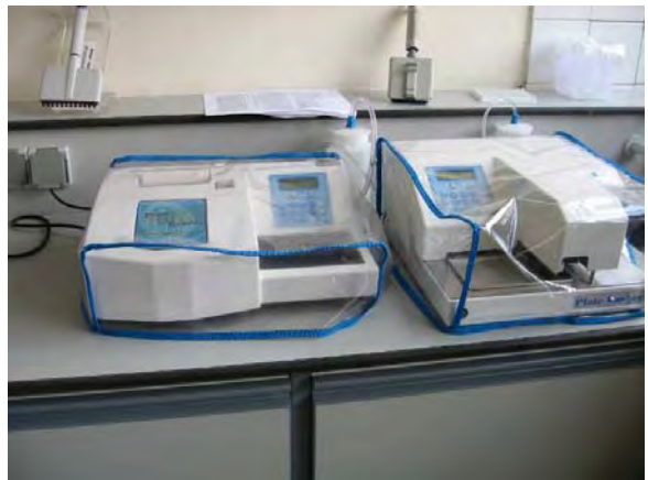
New equipment at the Oromia regional lab.

Laboratories in hospitals and regional laboratories will generally require more power, perhaps 6,000-12,000 watts, though the figure could be much higher for the regional labs. For example, the regional lab built for the National Laboratory in Haiti had multiple labs within the same building and each laboratory probably required 10,000 watts of power.