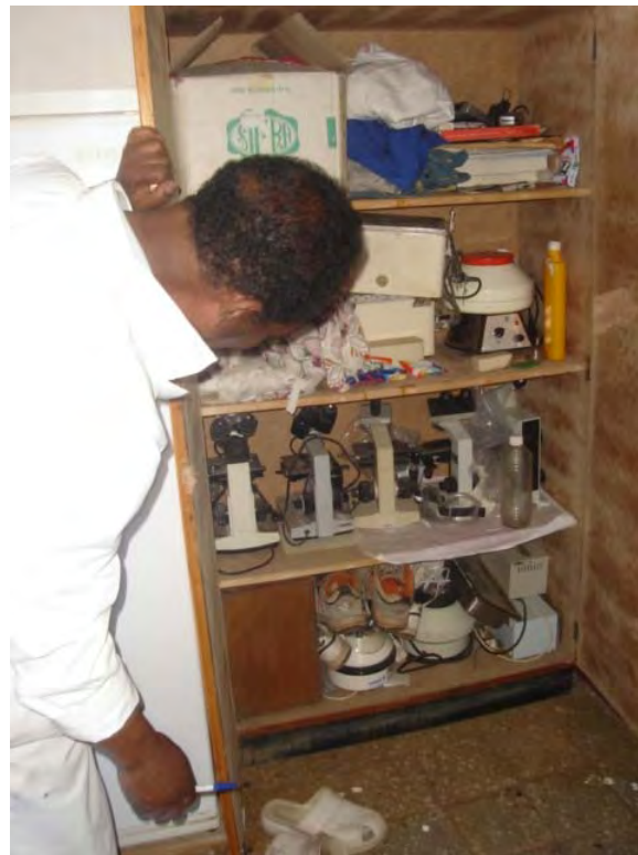
ABOVE: A closet full of non-functioning equipment at a health center in Amhara.

Electricity needs not integrated into planning: At all levels, from PEPFAR partners to health facility managers to government planners, electricity needs have not been integrated into health program planning. As a result, resources are not being maximized and malfunctioning equipment is negatively impacting health delivery. The impact could be particularly strong in new facilities being planned for construction outside the grid. Options for providing electricity to these facilities should be assessed before they are built so construction designs can accommodate the selected electrical system and bulk procurements of energy generating equipment can be conducted. However, interviews indicate that few of the regional planners have the ability to conduct this kind of analysis.