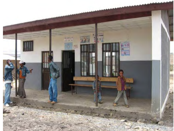
A typical health post.

In addition, each region maintains at least one reference laboratory; these facilities participate in the PEPFAR program and therefore are included in this report.