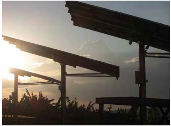
Solar panels at a health center in Rwanda.

A small- to medium-sized health facility likely would require a solar system to include a 3,000 to 6,000 watt array for all electrical needs. The cost of this equipment, with the batteries and inverters, would be $60,000 to $120,000. GTZ plans to equip 50-100 health centers with solar systems in the neighborhood of 1,000 watts, but this size system is unlikely to be able to address the full energy needs of the laboratory loads. The Energy Access Program supported by the World Bank and Global Environment Facility (GEF) will supply 200 health posts with 360 watt PV systems, but these will not power much more than lights. The program has already conducted international bidding and the finalist should be declared soon.