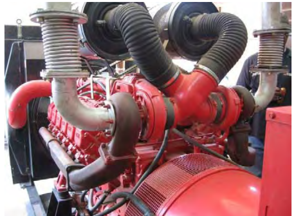
Gondar University Medical Center's new generator.

Generators can provide good quality power, but require regular fuel and maintenance. Capital costs of generators are fairly modest; a 7-10 KW generator (sufficient for a small to medium lab) can be purchased for about $7,000 to $12,000. If a site requires a generator as large as 30KW, this unit could cost in the neighborhood of $20,000. However, the cost of fuel and maintenance can overtake the initial purchase cost in a short amount of time, especially given current trends. Generators require someone on-site to provide routine maintenance.