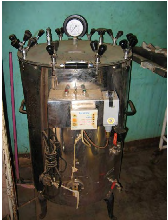
A new sterilizer unable to be used because the health center lacks the proper wiring.