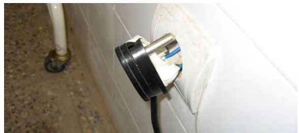
The pins on this autoclave plug have been taped so staff can try to use it in an inappropriate outlet.