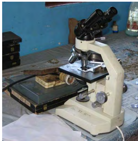
BELOW: The lab in the same health center had to jury rig an exterior light bulb in order to use its one partially functioning microscope.