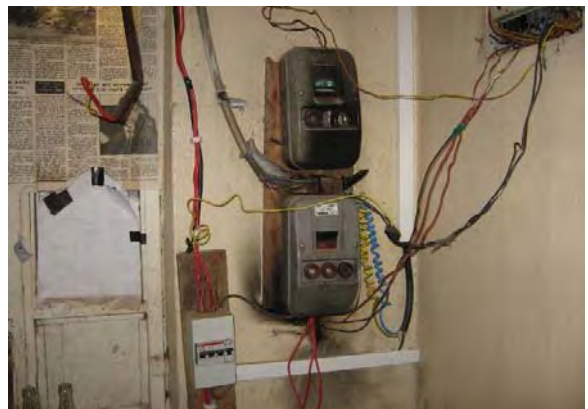
Wiring at the Amhara Regional lab, with evidence of an electrical fire.