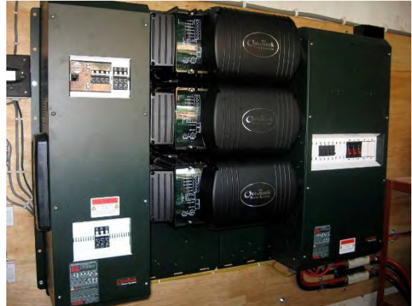
Inverters at a health center in Rwanda.

Inverter/battery systems also require considerable training to maintain; there should be an on-site person trained to perform daily maintenance tasks, with periodic (more specialized) maintenance performed by a specialist. If the latter does not exist, local capacity will need to be built to ensure sustainability of the systems.