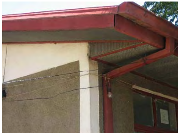
Inadequately sized and hung wire connecting buildings at a health center.

Aside from inadequate wiring between buildings, the wiring inside most of the buildings visited also is problematic. In many buildings the original wiring was installed for a few lights and small devices. As