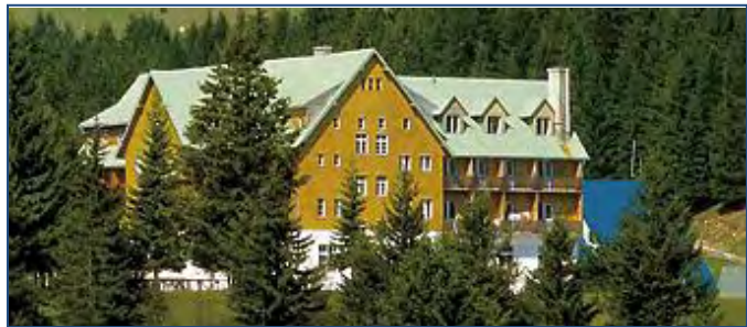
Tourist chalet in northern Montenegro.

The economy of Montenegro has expanded over the past decade with GDP per capita increasing more than 70% from 2000 to 2005. However rates of employment creation and economic growth in the municipalities of northern Montenegro were much lower than those in the south. While just one-third of the population resides in the north, nearly half of those who fall below the poverty line live there. One result of the economic divide is considerable north-south migration, resulting in a net population decrease of 8% in the north over the last ten years. With recently privatized state-owned industrial enterprises in the north either not operational or operating well below previous levels, the main economic sectors are tourism, agriculture and forestry. Although tourism offers the most immediate prospects for significant job creation, the region unsurprisingly lags behind the Adriatic Coast in tourism growth. Increasing international recognition combined with the prioritization of tourism development in the north by the national government is beginning to curb this trend.