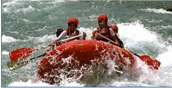
Tourists white water rafting in northern Montenegro.