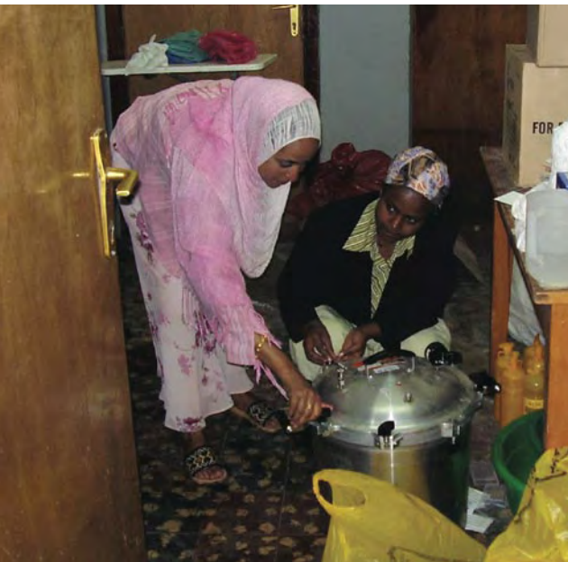
Above, left: All trainees as well as support staff are trained to properly sterilize and handle equipment to be used in both implant and IUCD insertion.