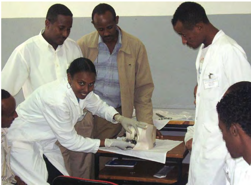
Above, right: Trainees practice on anatomical models during the technical phase of training.