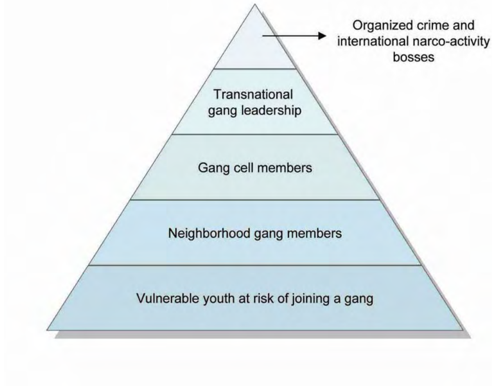
Figure 2: Gang Structures

Figure 2 below shows a hierarchy of organizations and networks in Central America and Mexico that most commonly fall under the definition of gangs. While the pyramid does not do complete justice to the level of complexity within each strata, it does provide a general understanding of the various groupings of gangs and their relation to organized crime networks and the broader at-risk youth population.