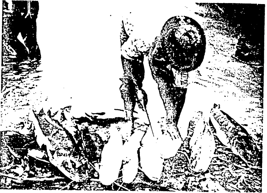
Fig. 2. Fisherman eviscerating several catfish species for a fish-processing plant in Itacoatiara, Brazil.

driven south along the Belém-Brasília highway which was paved in 1974, a decade after its inauguration. One of the plants, Frigorífico Brasília, purchased 478 tonnes of eviscerated and headless fish (78% siluroids) between 1975 and 1977 (Smith, 1981a).