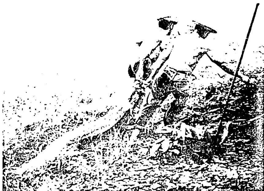
Fig. 3. Fishermen dragging a freshly harpooned pirarucu up the shore of a floodplain lake of the Amazon near Iacoatiara, Brazil.

powered by car batteries placed in the bottom of the canoe. Harpoons, tipped with detachable steel points, are hurled at pirarucu in lakes at low water (Fig. 3). A fisherman sits at the bow of his canoe, harpoon in one hand and paddle in the other, waiting for the air-breathing, torpedo-shaped fish to surface. After piercing pirarucu, which can weigh up to 90 kg, an hour may pass before the large-scaled fish tires sufficiently to be hauled in and clubbed.