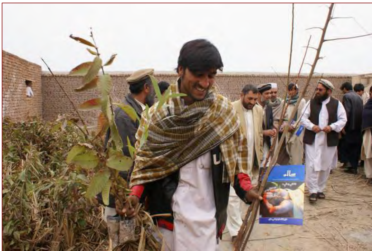
A man takes fruit saplings and a magazine published by ADP/E's GME Unit at Tangi IDP camp in Behsud District of Nangarhar Province. The saplings were grown in women-owned nurseries, and in this first phase are being distributed to 4,115 families living in one of the IDP camp.

processed by Surkhrud Packing facility for Nangarhar Fruits & Vegetables Association. The packed products were shifted to high value markets including Kabul-based markets, and RA International Logistics Company.