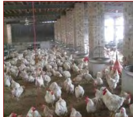
Before and after: the top picture shows chickens with improper litter. The bottom photo shows a breeder farm after replacing the flooring with rice husks, which improved the chickens' health.