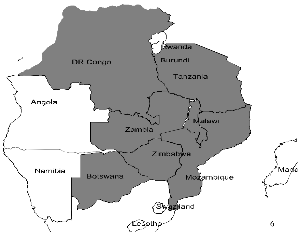
Figure 1. SARRNET countries where SPN/O Sweetpotato variety has been adopted