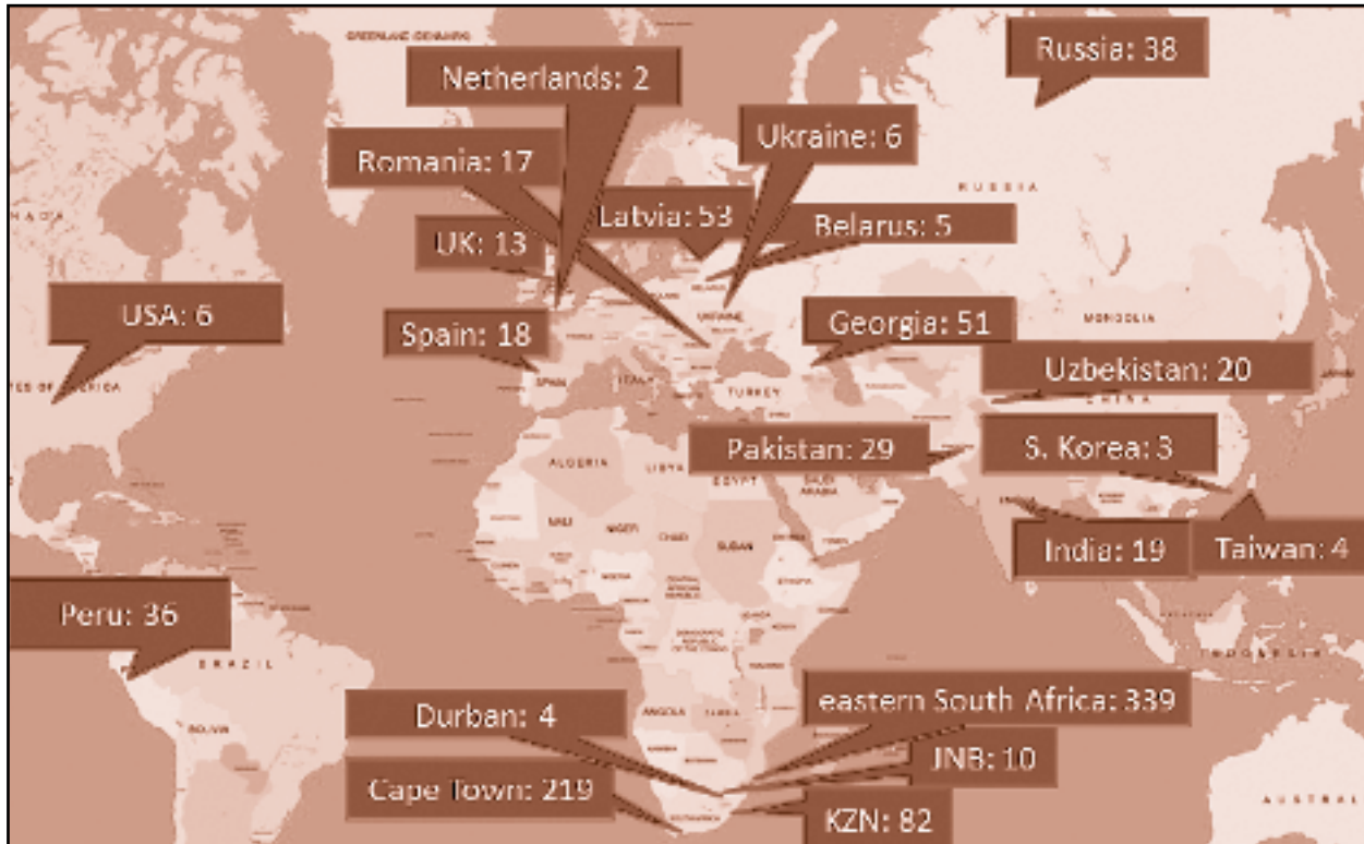
Figure A6.3.2. Details of geographic locations of patients included in the individual patient data meta-analysis (the number indicates the number of participants included at each location)