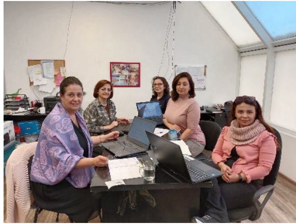
Figure 23: Mentorship Session with Mektebim

PSA continued its mentorship program throughout the quarter with seven organizations: KOBSKA , ARWA , the Ganja WRC , AWiS , Mektebim , YAPU , and AWEDA . The mentorship program provides opportunities for organizations to receive technical assistance and address specific organizational issues in dedicated sessions, where they could openly discuss their weaknesses, share their strategic plans, and request advice, support, or guidance.