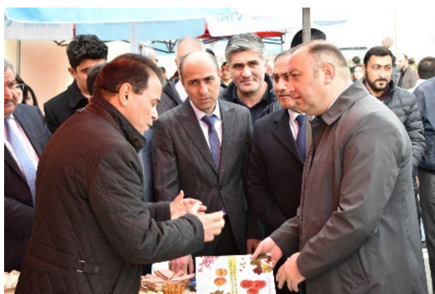
Figure 15: Tree planting ceremony in ASAU Demonstration Plot

On March 1, 2023, PSA held a tree-planting ceremony at the ASAU demonstration plot for more than 150 participants, including ASAU students, staff members and representatives from public institutions. This project is a collaboration between ASAU, PSA, the Israeli Embassy in Azerbaijan through its Agency for International Development Cooperation (MASHAV) , and Coca-Cola Azerbaijan. This ceremony marked the completion of five intensive and semi-intensive demonstration plots, with 3,400 apple, pomegranate, cherry, peach, and nectarine trees planted in a 2.5 ha area. In addition, the orchard plots were provided with special trellis systems and modern drip irrigation systems. These components together with compact plant spacing, plastic mulching, and other advances demonstrate intensive techniques in orchard fruit production. ASAU students and staff received guidelines for cultivating orchards, pruning and irrigating fields and applying appropriate pesticides and pest control measures to enhance their technical skills and knowledge on how to grow high-quality crops.