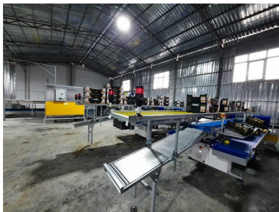
Figure 8: Ayaz Alakbarov's TTF project's handover - Fruit Sorting Line Facility