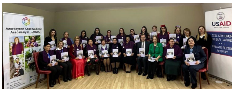
Figure 29: ARWA Directory Presentation Event

KOBSCA's small material assistance project implementation: PSA supported KOBSCA with establishing a coworking center for women entrepreneurs. The center provides free training opportunities, attracts new residents, and provides women entrepreneurs with access to an office facility.