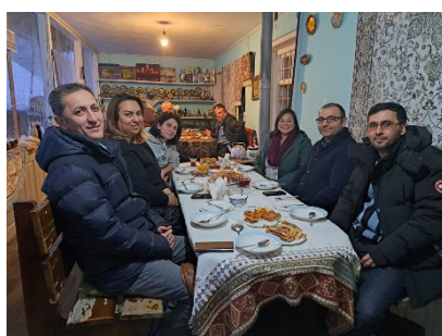
Figure 2: USAID monitoring visit

The USAID Georgia Representative and the STA of Azerbaijan held a meeting to discuss plans for 2023, including tourism strategies, legislation, regulations, and communications between relevant stakeholders in Azerbaijan and Georgia. They also discussed PSA and Economic Development, Governance, and Enterprise Growth in Europe and Eurasia Project's (EDGE) work, including inviting an expert from the U.S. to conduct a seminar for Georgian and Azerbaijani Destination Management Organizations (DMOs). PSA participated in an online session organized by USAID Georgia, which served as a discussion platform on how to collaborate on tourism activities between Azerbaijan and Georgia.