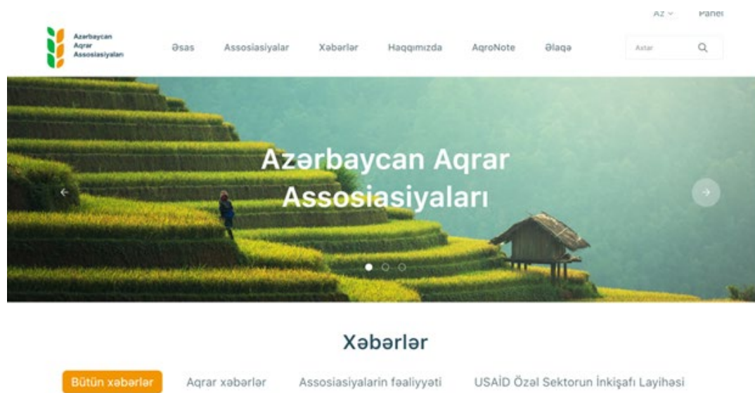
Figure 30: Agroassociation.az Website

PSA supported the DFACA of MoA in developing the agroassociation.az website (Figure 24). The website has a USAID Private Sector Activity section, where PSA agricultural activities can be uploaded. PSA started adding information about its activities to the website during this quarter.