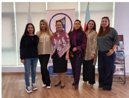
Figure 25: Mentorship Session with AWEDA

on human resources topics, including how to attract new talents in the organization, appropriate expectations from staff, and the balance between vocation and occupation in team building.