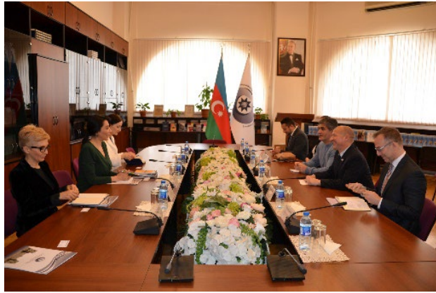
Figure 27: Meeting with PSA, Azerbaijan's Commissioner for Human Rights, and Ombudsman's Office

PSA met with the Head of Apparatus of the Ombudsman's Office and the Ombudsman's Office expressed interest implementing key reforms outlined in the WNBA and supporting women's economic and social advancement. The Ombudsman's Office committed to participate in regional events and offered the support of their four regional offices. The Ombudsman's Office expressed an interest to discuss broader collaboration opportunities with USAID. Both USAID Mission Director and PSA Chief of Party (COP) met with Sabina Aliyeva, Azerbaijan's Commissioner for Human Rights, to discuss opportunities for collaboration. PSA will continue to communicate with the Ombudsman's Office to strengthen social and economic rights for women entrepreneurs.