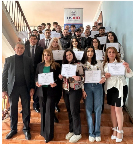
Figure 14: Closing Ceremony of the Technical Certificate Program on Pomegranate Production

Through its WhatsApp group, PSA provided recommendations on pest and disease problems that several persimmon growers faced in their orchards.