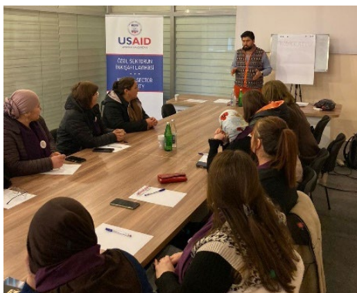
Figure 26: Trainings on Cooperative Development

Cooperative and DFACA to brief participants on the advantages of cooperatives and share best practices on cooperative management.