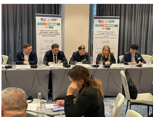
Figure 21: CLDP conference on Trans-Caspian Trade Route Enhancement

From March 5-7, 2023, PSA participated in the Commercial Law Development Program's (CLDP) conference on “Trans-Caspian Trade Route Enhancement: Private Sector Perspective for Viable Multimodal Trade Route Scenarios” in Batumi, Georgia. CLDP is a legal and technical assistance office within the United States Department of Commerce that assists in trade facilitation and economic connectivity in and among Central Asian countries. The event included the private sector TIR (International Road Transport) national association representatives from all five Central Asian countries, Georgia, and Azerbaijan, and logistics and freight forwarding companies. Conference participants collaborated to identify the most viable trade route scenario for the transport of goods along the Trans-Caspian corridor. PSA invited Azerbaijani logistic companies such as Ramtrans Group , Sara Logistics , and Ece Logistics as representatives of the private sector, and CLDP invited the Association of International Road Carriers of Azerbaijan (AIRCA) .