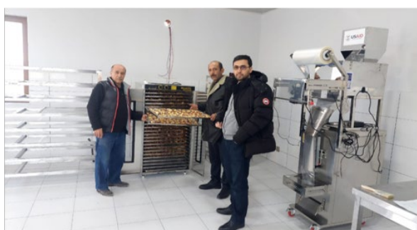
Figure 1: Handover of equipment for TTF recipients

Tourism is a priority area in the development of Azerbaijan's non-oil sector, and there are opportunities to complement tourism with agriculture through agritourism. Given the many disparate activities in the tourism space that are being launched in Azerbaijan, PSA will continue to liaise with public and private organizations to better coordinate, avoid overlap, and leverage resources, including working closely with the State Tourism Agency (STA) , Azerbaijan Tourism Board (ATB) , and Destination Management Organizations (DMOs) .