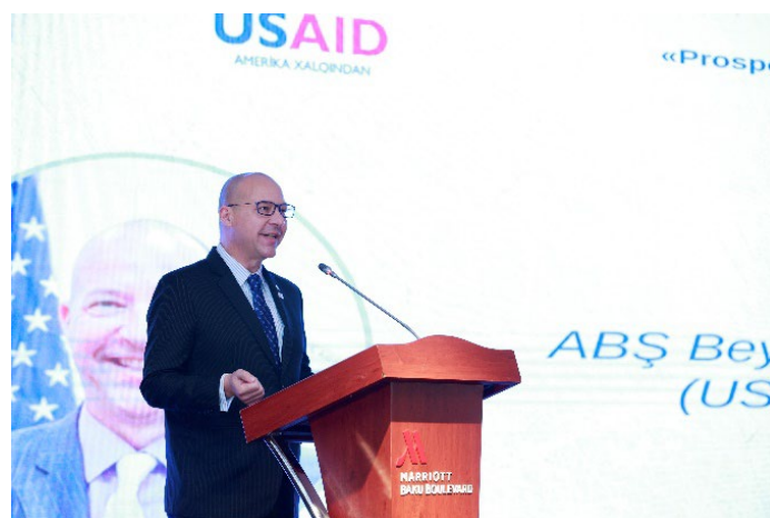
Figure 18: Conference on Prospects for the Development of Alternative Financial Markets in Azerbaijan

On March 2, 2023, PSA organized an Alternative Finance Conference on "Prospects for the development of alternative financial markets in Azerbaijan" with the Small and Medium Business Development Agency (SMB) . A total of 200 participants attended the conference, including representatives of local and international institutions and the private sector in finance and banking. Attendees discussed the financing options for small and medium-sized enterprises (SMEs), alternative financial instruments and international experience in this field, and possibilities of applying alternative financing mechanisms in Azerbaijan. Panel discussions featured invited guests from Türkiye, Italy, and Georgia, representing the organizations like European Bank for Reconstruction and Development (EBRD) , International Finance Corporation (IFC) , Bank Associations of Türkiye , and others. The panel discussions focused on topics such as Islamic banking and microfinance, SME support tools (guarantee, asset-based financing, and leasing), and the importance of developing the start-up ecosystem.