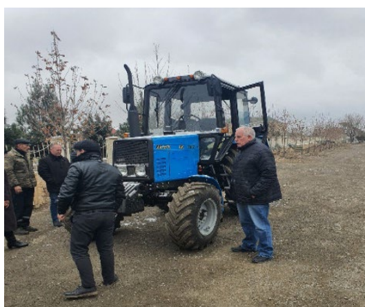
Figure 11: PSA visit to the premises of Shafa Women Group

Shafa Women's Group received a tractor and lorry through TTF support to start AgriServices operations. PSA visited the premises of the Shafa Women's Group to monitor the arrival of the tractor and the lorry. Group will offer harvesting services to farmers. Final payments on this procurement were made, and the project is completed.