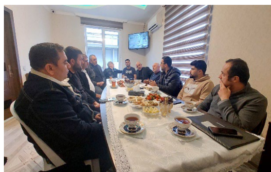
Figure 6: Berry Association members meet to discuss Strawberry Festival

The first meeting of the Berry Association took place in Lankaran with fifteen members. Berry Association members discussed plans for the upcoming year, including the next strawberry festival in Jalilabad in May 2023. The Association will send seven members to Saudi Arabia for a trade mission after the month of Ramadan.