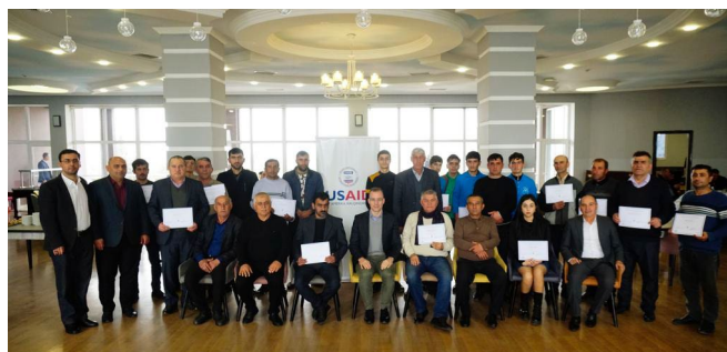
Figure 3: Graduation Ceremony of Technical Certificate Program on Strawberry Production

On February 28, PSA held a Strawberry Technical Certificate Program (TCP) Graduation Ceremony for its two Strawberry TCPs in Lankaran. More than 80 participants were awarded certificates for passing the TCP exams, and prizes were presented to the 12 participants who scored the highest on the final exams. The two-month-long TCPs consisted of practical and theoretical training sessions where participants obtained technical knowledge and skills for cultivating high-quality strawberries, including the key parts of the strawberry production processes and cutting-edge equipment used for production. Lankaran State University, Lankaran Vocational Lyceum, Lankaran Regional Training Center, and Jalilabad State Vocational Education Center worked with PSA to conduct the TCPs.