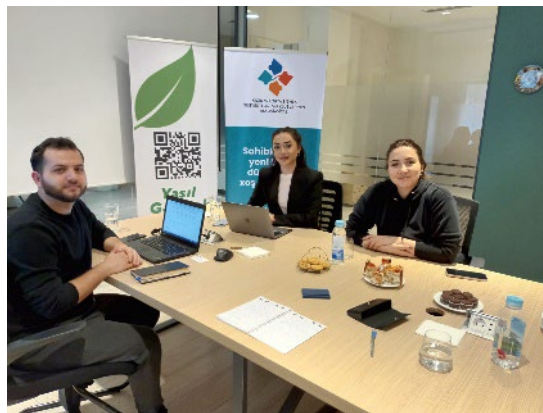
Figure 24: Mentorship Session with KOBSKA

PSA facilitated three internal training sessions for Mektebim's staff. Training sessions provided guidance on developing clear messages, presenting these messages to different audiences, and identifying donor opportunities. Through the training sessions, Mektebim developed a promotional brochure to raise awareness of membership and a tiered payment system for members.