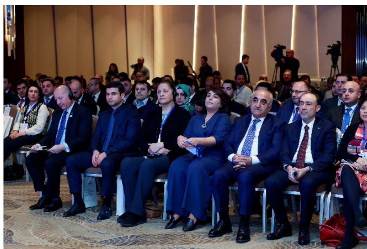
Figure 19: Conference on Prospects for the Development of Alternative Financial Markets in Azerbaijan

PSA coordinated with ASAU teachers and ASA to plan two financial literacy training for farmers. From January 17-19, 2023, 73 farmers attended the first financial literacy training in the Shamkir, Samukh, Goy-Gol, and Tar-Tar Regional Agrarian Training Centers (RATC) under ASA. From March 14-16, 2023, PSA conducted a second financial literacy training for 65 farmers in the Sheki, Gakh, Zagatala, and Gabala RATCs and DAIMs.