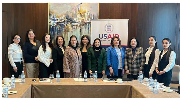
Figure 28: WNBA Steering Committee

Under PSA's guidance, the WNBA Steering Committee is becoming a stronger informal network with the addition of three organizations: Ganja WRC , AWiS , and Femmes Digitales . PSA facilitated a Steering Committee meeting to discuss the advocacy campaigns under the WNBA. Thirteen participants from AmCham , AWEDA , ARWA , Femme Digitales , Ganja WRC , KOBSKA , YAPU , and AMFA discussed their advocacy plans and media plan initiatives to promote the WNBA.