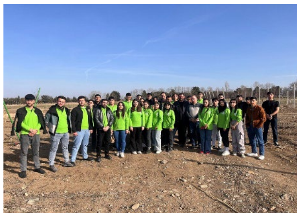
Figure 12: Seventh Session of Perishable Vegetable TCP