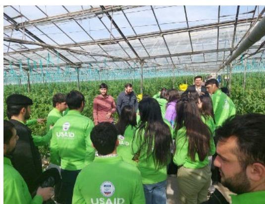
Figure 13: TCP Participants at Art Green LLC's greenhouse facility