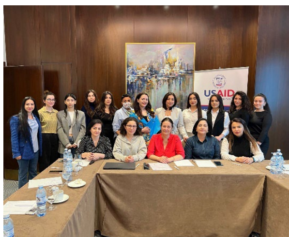
Figure 22: How-To Session on developing a great message

PSA Component 3 continued the series of “How-To” sessions to build the capacity of local women's organizations in an incremental manner.