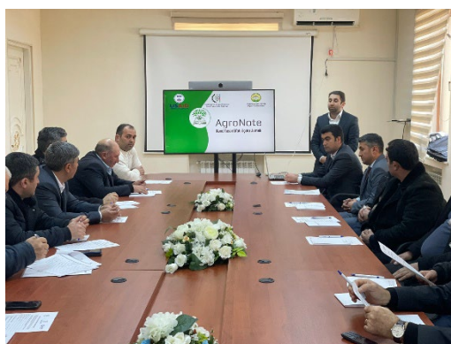
Figure 20: Financial literacy training session

Importance of i) planning; ii) farm accounting; iii) basics of savings and loan products; iv) roles and working principles of financial institutions; v) alternative financing options for farmers; vi) relationship-building with financial institutions; vii) financial projections; viii) external funding and timing; ix) estimation of future cash flow; and x) profitability were covered in the training. Farmers also discussed real cases, challenges, and previous experiences with loan officers from Kapital Bank and Express Bank . Farmers received a banking booklet, monthly budget sheets and profitability analysis for activities. The training provided farmers an incentive to keep their budget and make better and informed financial decisions. Most of the participants had a follow-up meeting after the training. As a result, ten farmers from those regions, including training participants and other farmers whom they visited while evaluating applicants, received loans totaling 117,000 AZN, or about $68,800 USD.