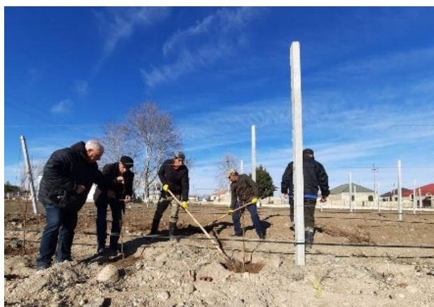
Figure 16: Tree planting at ASAU

Following the ceremony, PSA sprayed the peaches and nectarine against “curly leaves” with a bordel-mix fungicide. Furthermore, PSA provided TA to ASAU students and orchard workers on pruning trees in intensive and semi-intensive orchards and tying trees to wire in intensive orchards and stakes in semi-intensive orchards to protect them from the wind. PSA will manage the demonstration plot’s fertilization and pest and disease control for two years with ASAU students and employers. Following this two-year period, ASAU will take over control of the demonstration plots.