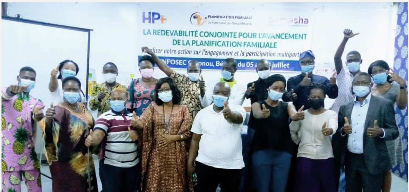
Participants of the joint accountability workshop in Benin.

Elsewhere, faith leaders and county health department staff in Kilifi County, Kenya, are using their joint accountability plan to strengthen implementation of the country's costed implementation plan for family planning and transparency of the country's program on family planning. So far, Muslim and Christian faith leaders and staffs of health facilities have partnered to produce two radio shows to discuss family planning, using harmonized messages.