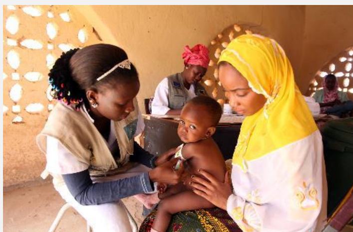
A Malian community health worker conducts a well-baby visit.

To improve community health service delivery in Mali, HP+ supported the revision of two decrees, submitted to the government for adoption. Taken together, the decrees formally integrate CHWs into Mali's formal health system, ensuring that the government takes responsibility for mobilizing domestic resources to pay for CHWs and sets conditions for the creation and functioning of community health centers. The decrees also promote government accountability and allow for greater geographic coverage of primary healthcare for women and children, who have high mortality rates.