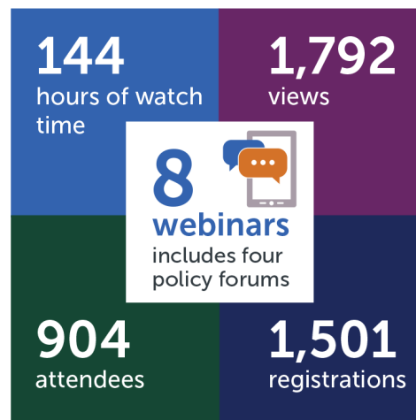
Figure 5. Webinars by the Numbers

Convened experts in the fields of family planning, health financing, and gender to discuss how to better integrate gender into family planning and health financing to make it more equitable, rights-based, and inclusive. At a meeting in May 2021, HP+ generated an agenda for future research and advocacy on how to better bring a gender perspective to the evolving field of family planning financing, highlighting the need to proactively engage designers of insurance benefits packages and financing schemes to develop more gender-sensitive and responsive mechanisms.