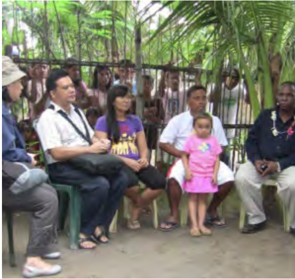
A community gathering.

The booklet provides guidance and lessons learned for those implementing PHE programs in other settings, including information on the following topics: