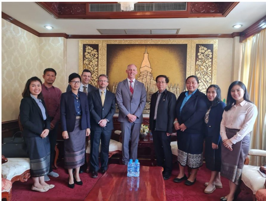
Figure 1: Formal Introduction of LES CoP to MEM by USAID

After the meeting, the LES project team continued to engage with counterparts in MEM, including the Department of Energy Planning and Policy (DEPP), Department of Planning and Cooperation (DPC), Department of Laws (DoL), Department of Energy Management (DEM), and the Institute for Renewable Energy Promotion (IREP), as well as with Électricité du Laos (EdL). Based on local practice, the Government Liaison Officer used the signed minutes from the formal introductory meeting to open the doors for the subsequent meetings. A summary of these meetings and engagements is appended in Annex 2.