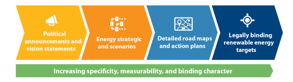
Figure 3. Spectrum of RE targets

RE goals come in many different forms. The International Renewable Energy Agency Spectrum of RE Targets (see Figure ) illustrates the range of RE targets and how they compare to one another in terms of specificity, measurability, and binding characteristics (Kieffer and Couture 2015). RE targets that are aggressive are likely to stimulate the FPV market, especially in areas where land is scarce (Cox 2019). In countries with land and water scarcity problems, RE targets could especially incentivize FPV systems that address these one or both these issues (Cohen and Hogan 2018). Targets that are legally binding with clear enforcement mechanisms and penalties can drive and encourage investment in RE technologies because such targets provide clarity and stability (Kieffer and Couture 2015).