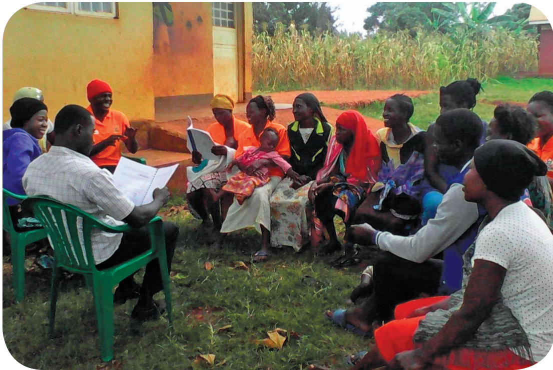
Out-of-school youth club meeting