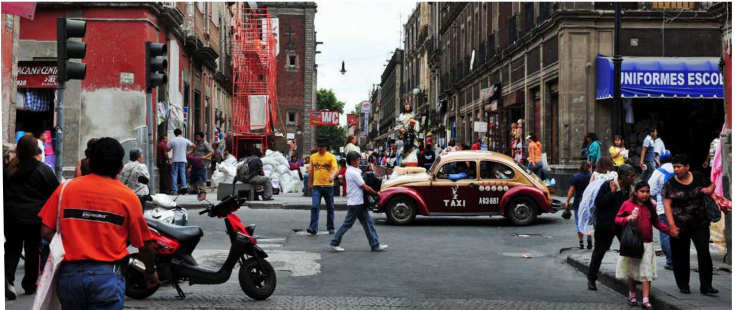
Mexico City, Mexico