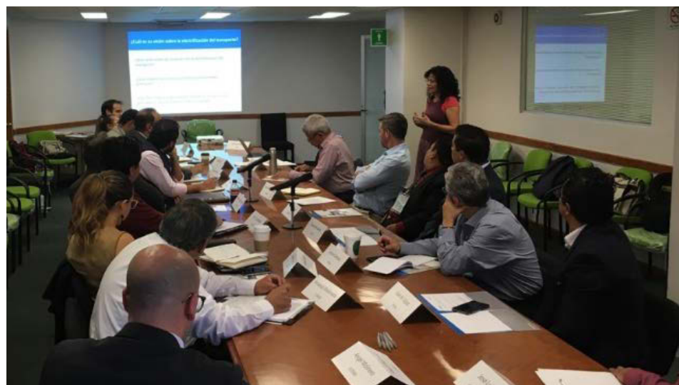
Figure 1. Focus group in Mexico City, 2019

Air Pollutants: Gasoline-powered motorcycles emit air pollutants at a significantly higher rate than automobiles while