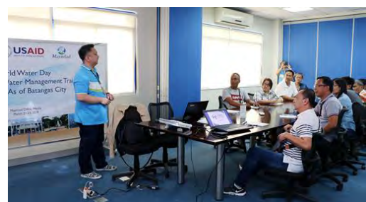
Maynilad Water Academy non-revenue team and USAID/SURGE shared approaches to improve non-revenue water management during a three-day training at the Maynilad Office in Manila for Batangas City LGU engineers and RWSAs.

Moreover, eight members of 6 RWSAs and 4 members of the CWSMT participated in the NRW Management Workshop from March 22 to 24 organized by the SURGE Project and conducted by