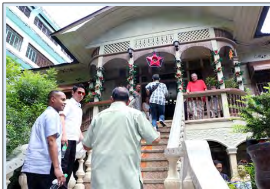
USAID Mission Director Lawrence Hardy II and Tagbilaran City Mayor John Geesnell Yap visit the Balili House, a Japanese-era structure and one of the city’s famous heritage houses.

Tagbilaran City has a rich culture—a mix of different eras that involved the Spanish, the American and the Japanese. “The Tourism Development Plan can transform the city into a leading heritage tourism destination and a major hub for cultural arts not only in the Philippines but for Southeast Asia as well,” he added.