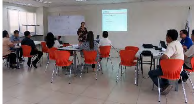
USAID/SURGE conducted an orientation and action planning on asset management with the key officials of Iloilo City.

The SURGE Project conducted an orientation and action planning session on Asset Management with key officials of Iloilo City last March 6, 2018 at the Penthouse Conference Room of the Iloilo City Hall. Key officials from the City Planning and Development Office, General Services Office, City Treasurer's Office, City Assessor's Office, City Engineer's Office, City Local Economic Enterprise Office, City Tourism Office, City Accounting Office, City Legal Office, City Agriculture's Office and the Iloilo City Urban Poor Affairs Office participated in the workshop. A representative from the Land Registration Authority also joined the meeting.