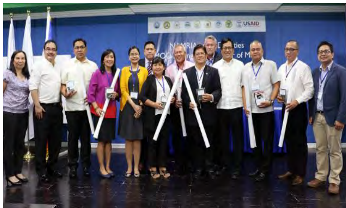
NAMRIA and USAID hand-over digital orthoimages and terrain and surface models to USAID CDI partner cities during an MOU signing and turnover ceremony on January 30, 2018 at the NAMRIA Office in Taguig City.

On January 30, 2018, the SURGE Project facilitated the turnover of digital maps from the National Mapping and Resource Information Authority (NAMRIA) to the eight CDI cities, which includes Digital Orthoimages, and Digital Terrain Model (DTM) and Digital Surface Model (DSM) as Derived from Interferometric Synthetic Aperture Radar (IfSAR) Airborne Technology. [REDACTED]. An MOU was inked between the eight cities and NAMRIA. The partnership highlighted the support of NAMRIA to the preparation of risk-sensitive land use plans of the cities, an important activity assisted by the SURGE Project.