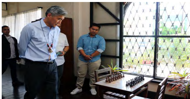
As part of the Tagbilaran City Heritage Tour, US Ambassador Sung Kim visits the ancestral house of former Philippine President, Carlos P. Garcia, who hails from Bohol. Ambassador said that, “he learned a lot about the rich history and culture of Tagbilaran City during a very interesting heritage tour.”