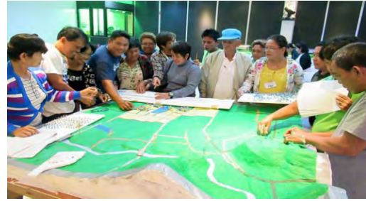
USAID/SURGE assists the local government of Barangay Conel, General Santos City, in developing its first 3-D map and contingency plan.

Replicating what they have learned from the 3D Mapping and Contingency Planning Workshop in Legazpi City last year, the City DRRMO in partnership with the USAID SURGE project assisted Barangay Conel in developing its first participatory 3-dimensional (3-D) map and contingency plan. Home to the Kalaja Karst formations and its picturesque ecotourism attractions like caves, waterfalls and springs, Barangay Conel is vulnerable to flooding. With the community maps hazards and vulnerabilities and contingency plan, the barangay enhances its local resilience.