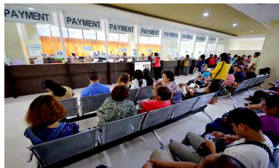
Business owners await their turn at the Business One Stop Shop at the General Santos City Economic and Investment Building to register and renew business permits.

Enhanced customer satisfaction was also noted during the exit interview with clients which shows