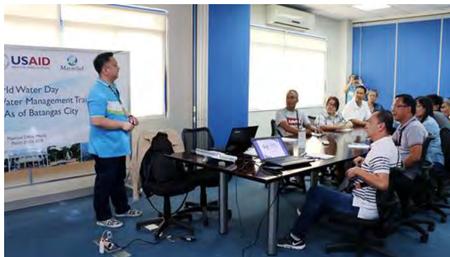
Maynilad Water Academy non-revenue team and USAID/SURGE share approaches to improve non-revenue water management during a three-day training at the Maynilad Office in Manila for Batangas City LGU engineers and RWSAs.

The SURGE Project facilitated the MOU signing between General Santos City and Maynilad Academy for a partnership on technical improvements of water supply system in areas covered by the RWSAs. Another MOU was also forged between General Santos City and General Santos City Water District. The MOU signing was conducted in a ceremony held on March 23, also to observe the celebration of the World Water Day.