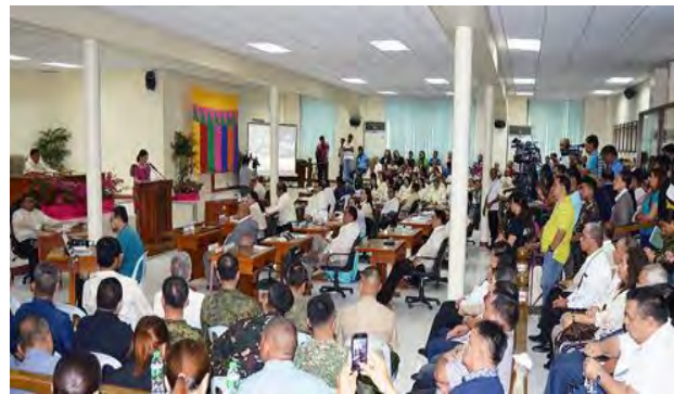
Zamboanga City Mayor Maria Isabelle Climaco expressed her gratitude to USAID/SURGE for assisting the city government in streamlining its BPLS and setting up the city's Geoportal during the State of the City Address on January 16, 2018.

The SURGE Project monitored the progress of BPLS reforms in all CDI cities during the renewal period. The project organized assessment teams from the city government (mainly from the BPLO) and in some cities with the academe. These teams conducted a time and motion study, BOSS observation and customer satisfaction survey. The findings of these assessment were shared to the BPLS TWGs for the continuous improvement of their BPLS. Overall, all CDI partner cities remained compliant to the national government standards of streamlined BPLS.