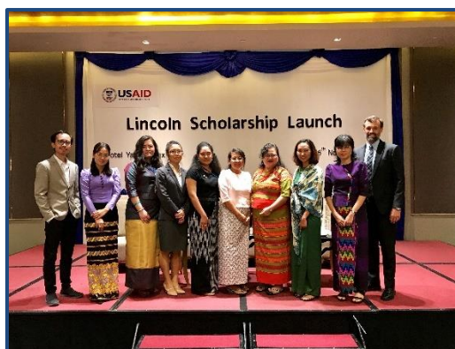
Launch Event at Novotel Hotel, Yangon

The Lincoln Scholarship Program launch event took place on November 26, 2019 at the Novotel Hotel in Yangon. The DCOP for the Lincoln Scholarship Program presented the program overview and objectives and the Director of TEF presented on outreach and recruitment activities. Ninety-eight people attended the launch event including 16 from the press/media and 48 organizations including civil society organizations, universities, private sector, and U.S. and Myanmar government representatives. The Ambassador of the United States of America and the Deputy Governor of Yangon attended the launch as guest speakers.