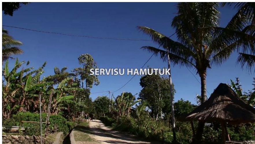
Title screen from one of the five short films produced about best practice at suco level

In Kind Grant for a Documentary Film: During the last quarter, Uairawa Multimedia signed a contract with Ba Distrito Project to produce 5 short documentaries to promote positive stories of change at the suco level in their capacity to deliver basic services effectively, and in a manner