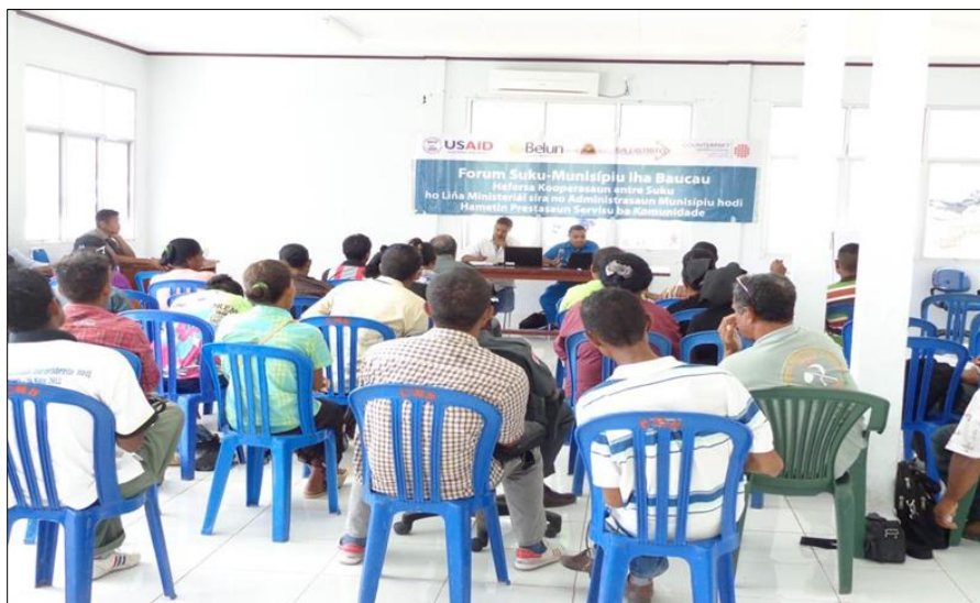
Suco Municipal Forum in Baucau

held meetings with the Municipal Administrators and line ministries based at the municipal level to brief them about the objectives of the forum and invite them to participate.