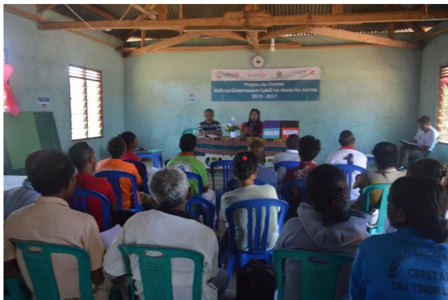
JPC legal education session in Venilale, Baucau

Grant Supported Legal Awareness Activities: In addition to the provision of free legal aid assistance to the poor and vulnerable, Ba Distrito's legal aid partners also continued to coordinate and implement legal awareness campaigns. Within this quarter, a combined total of