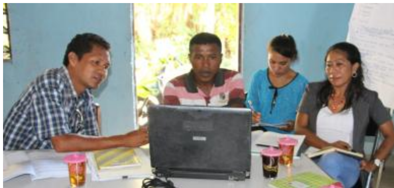
The M&E Specialist of Ba Distrito Project conducted Data Quality Assessment (DQA) to FFSO on March 16-20, 2015 in Oecusse Special Region.

Monitoring visit to FFSO, national implementing partner. On March 16-20, 2015, the Monitoring and Evaluation Specialist conducted the Data Quality Assessment (DQA) for Fundasaun Fatuk Sinae Oecusse (FFSO) in Oecusse. Through DQA the M&E Specialist met with the Director of FFSO and staff members to discuss the quality of the data being recorded by FFSO when implementing their activities. Through the DQA process, the M&E Specialist determined that there was not enough data recorded about legal information sessions that FFSO has been conducting on a monthly basis. As a result, it was determined that FFSO needs to provide documents that relate to the legal information sessions at the suco/aldeia level, such as implementation plan, agenda, lists of invitees, participants, reports, photos and other documents.