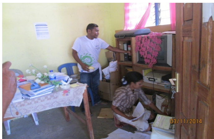
Figure 1 Belun's Oecusse District Coordinator supported PAAS of suco Lifau to improve suco archiving system

By the end of December 2014, the team has completed rapid assessments in 6 sucos in Ermera and 13 sucos in Liquiça. The complete list of sucos where the assessment took place can be found in Annex 4 of this report.