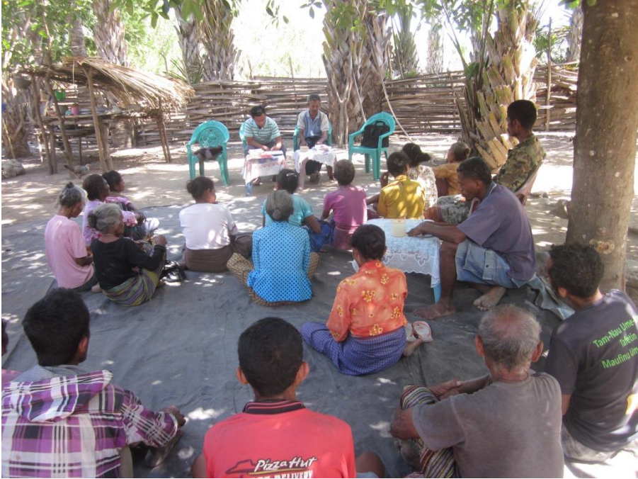
FFSO legal education session in Bobocase, Oecusse

sessions held in July in suco Bene-Ufe and Suni Ufe of Nitibe administrative post, suco Bobocase, Naimeco, Lifao, Cunha, Nifane, and Taiboco of Pante Makassar administrative post. Moreover 39 of the total participant are youth under 30 years of age including 25 female youth. In August, FFSO held four legal outreach sessions in four sucos including in suco Usi-Tacae and Bobometo of Oesilo administrative post and suco Taiboco