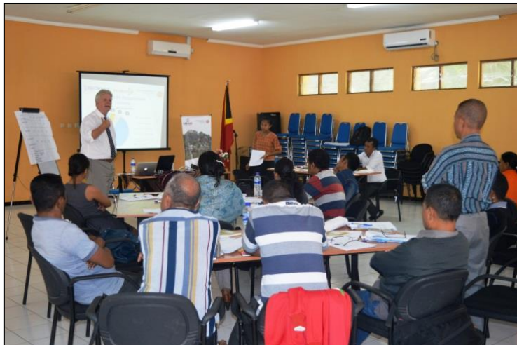
Judicial officers receiving training on recommendations for improved court statistics data gathering, analysis and reporting at the Legal Training Center