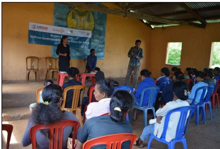
Legal aid partner JPC and ALFeLa jointly held an awareness campaign in Suco Loilubo targeting mostly women in May.

In addition to the strong collaboration that the project’s legal aid partners are gaining from community leaders in the sucos where they bring their services, they have also been building strong working relationships with other legal aid service providers and justice actors. On May 14, JPC held a joint legal education campaign in suco Loilubo, Baucau with a lawyer from ALFeLa specializing in women’s and children’s law. The information session was targeted at women. A total of 23 women including one man attended the session. During the session, which was observed by the Ba Distrito’s access to justice manager, participants were very active in discussion and raised critical questions.