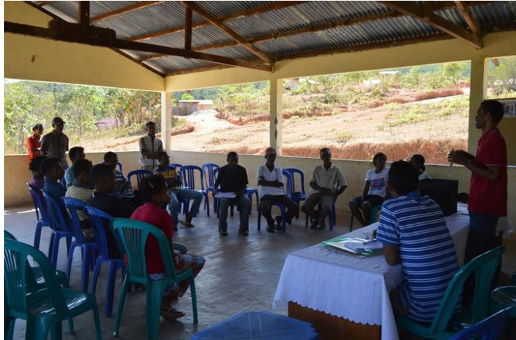
Liberta legal education in Luala, Ermera

During the first month of the quarter, Liberta held the four legal outreach sessions in Letefoho, Atsabe and Ermera administrative posts attended by a total of 129 participants including 34 women. The legal outreach sessions were held in suco Catrai Leten and Lauana of Letefoho administrative post, Tiarlelo and Malabe of Atsabe administrative post and Limea of Ermera administrative post. 36 of the participants are below the age of 30 including 15 female youth. The following month in August, Liberta held three more legal outreach campaigns in Letefoho administrative post including in suco Haupu, Eraulo, and Gaulolo. A total of 83 people participated in the outreach sessions including 30 women and 41 youth. 21 of the youth are female youth. In September, Liberta conducted 3 legal information sessions attended by 72 participants including 23 women and 45 youth.