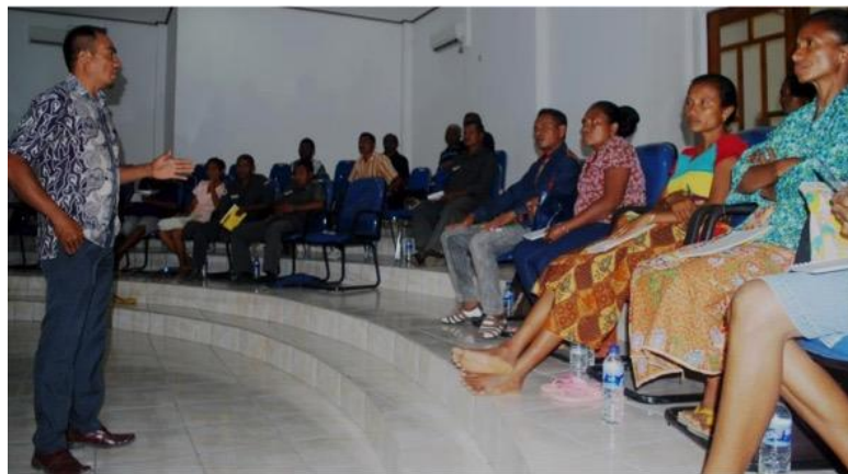
Suco – Municipal/SAR Forum in Pante Makassar, Oecusse advocating for health, education, water and sanitation and land and property.

Counterpart then facilitated a discussion between the participants to identify key challenges that they were facing in the areas of health, water and sanitation, education and land and property. The participants worked on a strategy to effectively present these concerns to the Authority of the SAR the following day. During the second day the participants were provided with an opportunity to share and discuss their concerns and challenges with representatives of the Authority of Special Administrative Region of Oecusse-Ambeno responsible for health, water and sanitation, education and land and property. Some of challenges and strategies proposed by Suco Councils at the Oecusse Suco-SAR Forum are set out in Annex 2 to this report.