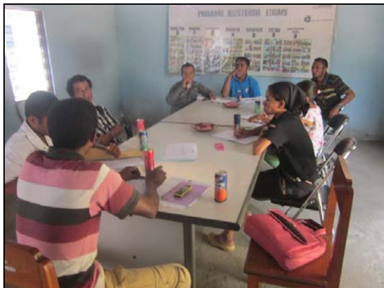
Figure 3- Legal Aid Coordination Working Group meeting held at FFSO in November

meetings were regularly held in Oecusse to ensure better coordination among the legal aid providers including government agencies and CSOs. Within this quarter, the Project's implementing partner FFSO held two Legal Aid Coordination Working Group meetings attended by representatives from relevant government institutions and CSOs including Legal Aid for Women and Children (ALFeLa), Ombudsman for Human Rights and justice, Victim Protection Unit