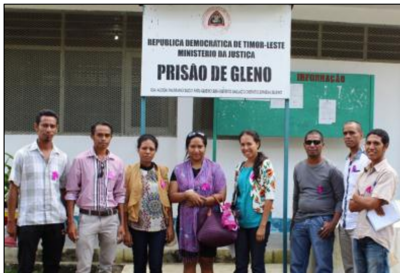
Legal aid lawyers outside Gleno prison after visiting and providing legal aid to female inmates in celebration of International Women's Day