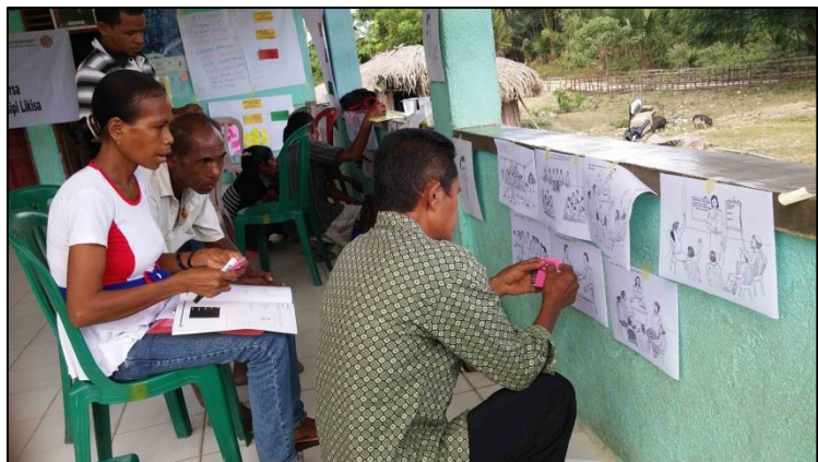
Leadership and Communication training in Guico, Liquica for suco chiefs, women's representatives, male and female youth representatives.

On May 11, Belun with support from Counterpart's Organizational Development team launched the first training for FY15 on Leadership and Communication. During this quarter, 19 sucos in Ermera, 21 sucos in Liquiça, 20 sucos in Covalima, 22 sucos in Baucau and 18 sucos in Oecusse benefited from participating in this two day training module. During the first week of the training, Counterpart's Organizational Development team supported Belun's facilitators in Ermera, Liquiça and Oecusse to help ensure the quality and effectiveness of the training. Feedback was provided to the Belun trainers to help them improve their delivery skills.