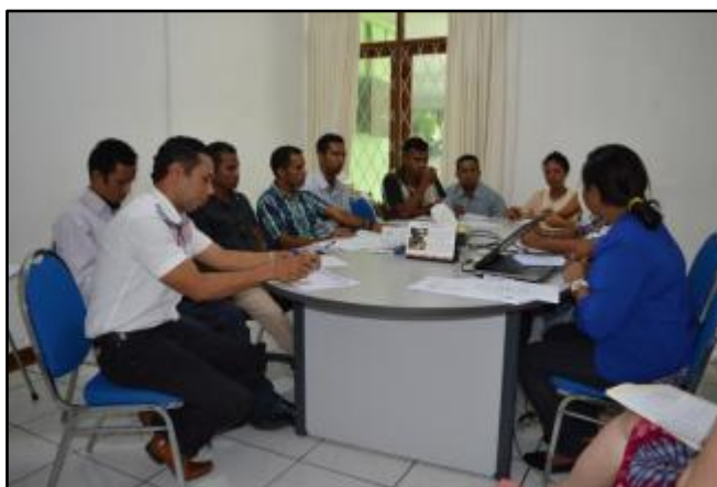
Legal aid partners advocacy group members met at Ba Distrito office to discuss an advocacy strategy and make plans to move forward.

On January 20, a meeting was held at the project's office to introduce the new advocacy approach to the group members as well as for the members to identify what they think should be the priority of the advocacy group. During the meeting, the group agreed to three areas of priorities including (1) giving feedback