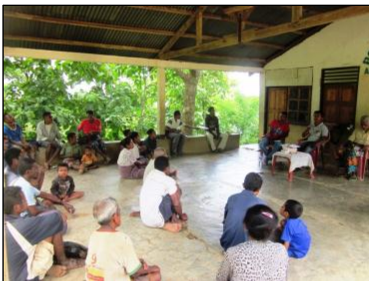
Attentive members of community during a legal information session held by FFSO in suco Naimeco

(FFSO, JPC, and Liberta) is to increase people's general awareness about law and provide on the spot legal advice for the participants who have legal issues and/or questions to consult. Most of the legal information sessions cover basic legal topics such as what constitutes a crime and how to report and solve alleged crime committed; what is a civil case/dispute and ways to solve them; and what constitutes a domestic violence. These sessions are also meant to increase people's basic understanding of how the formal justice system operates and the role of different actors in the formal justice system. Thus, general explanations were also made on the roles of judges, public prosecutors, public defenders, lawyers, and police including the role of community leaders in conflict prevention and resolution. References were taken from the relevant laws including Timor-Leste's Penal and Civil Codes including their procedure codes and Law against Domestic Violence (LADV).