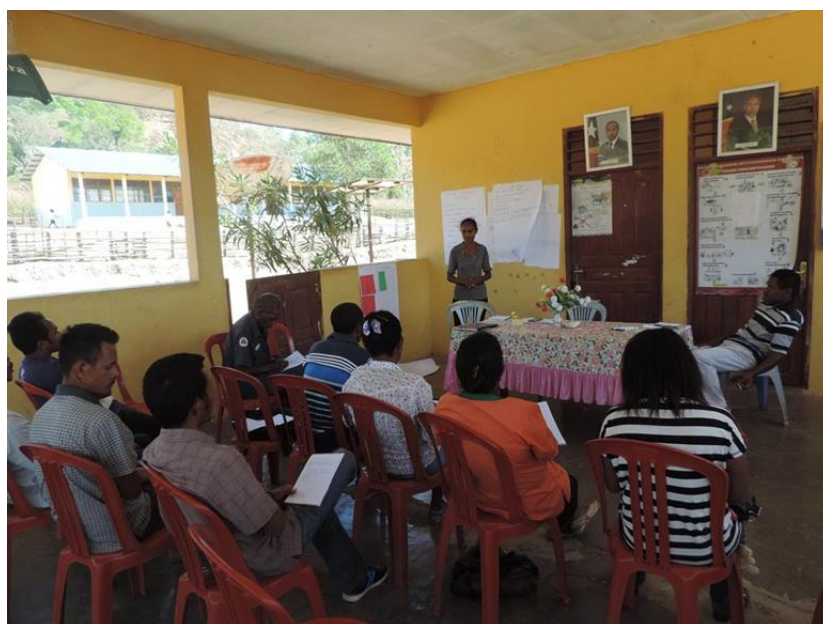
Suco Exchange visit in Fahilebo, Liquiça

A.5 Facilitate Networking, Exchange Visits and Joint Action among Sucos. During this reporting period the project facilitated three suco exchanges; one in Covalima and two in Liquiça. The suco exchange visits during this quarter focused on successful suco role models in five key functionality areas of public service: Leadership and Strategic Management; Programming and Quality Control particularly on Monitoring and Evaluation of project implementation and maintenance; External Relations/Communication; Administration; and Financial Sustainability