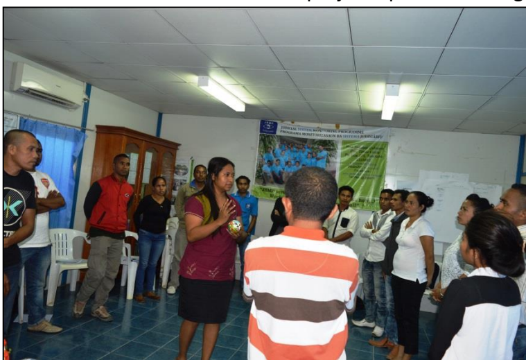
Training of Trainers for JSMP facilitators on interactive ways to facilitate the Access to Justice and Women’s Rights training module for suco councils.

During this quarter the project also entered into an agreement with JSMP to train the suco council members on access to justice and women’s rights. A part of the Project’s series of suco council trainings, the Module 2 on Access to Justice and Women’s Rights is aimed at creating a better understanding among the local leaders about the interface/connection between the formal and informal justice systems focusing on domestic violence, women’s land ownership, property, alimony and maintenance. The training is targeted at suco chiefs, women’s representatives and lia nains from each of the 100 sucos where the project operates. The goal of the training is to provide these local level decision makers with basic legal information that will help them to facilitate resolutions at the community level that are fairer and more respectful of women’s legal rights and to make referrals on to the formal justice system as appropriate.