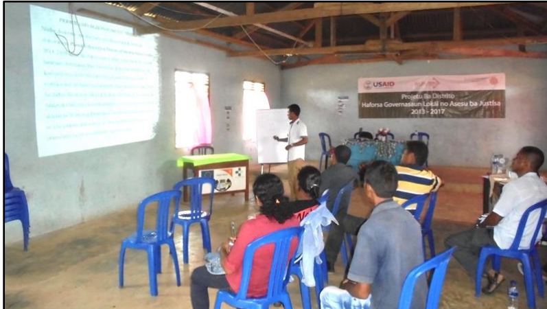
Suco Exchange Visit in Fatulia, Baucau focusing on the development of a Suco Development Plan.

mountains of Baucau municipality. In Covalima and Liquiça during this reporting period each municipality held one suco exchange visit.