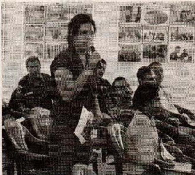
Representante fetu husi Ministeriu Solidaridade Sosial visitapin Liquiça husi diela perguata religioza balansa ho jeneru iha eventu lansamentu USAID nia projetu ba Ba Distrito.

Huoin lansamentu susesu iha Ermera semana kotuk, horesik Segunda (24/11) United State Agency for International Development (USAID), nia projetu Ba Distrito lansu iha Liquiça.