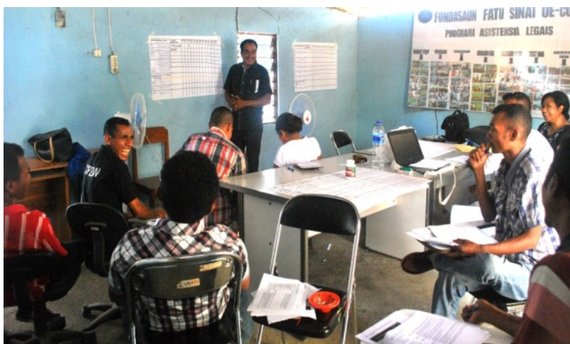
Ba Distrito District Coordinator facilitating action planning with FFSO to develop their organizational capacity action plan for 2015.

On October 28-30, the Capacity Building and Access to Justice teams presented the findings and recommendations of FFSO's organizational development assessment to the organization's Executive Director, staff and volunteers to create a one year action plan. FFSO was pleased with the findings and recommendations and collectively began to share responsibility to strengthen their organization through the