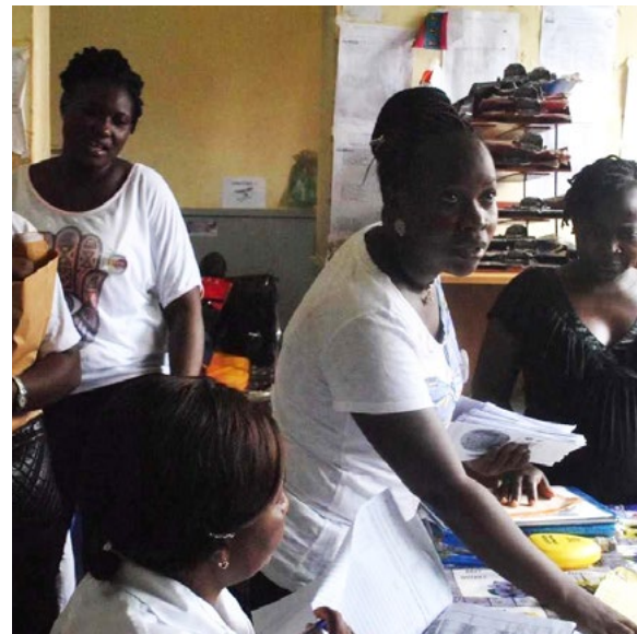
Mental health nurse lead at Connaught Hospital providing mentorship to a team of mental health nurses.

At the district- and tertiary-level hospitals, the project provides MHNs with regular, continuous professional development training and mentorship sessions to ensure quality standards for the services provided at hospital mental health clinics and in community outreach initiatives promoted by the project. The project is supporting mental health district clinics within the hospitals and is improving quality of services by revising the monitoring tools used by MHNs to collect data on mental health patients.