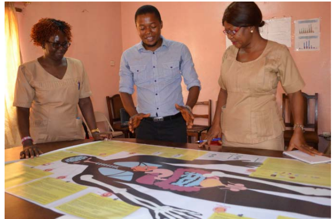
Use of the human body chart strengthens the effectiveness of CTO mentorship

Location: 1 in each district hospital (14) and referral hospitals (4) under line management of hospital superintendent and/or hospital matron