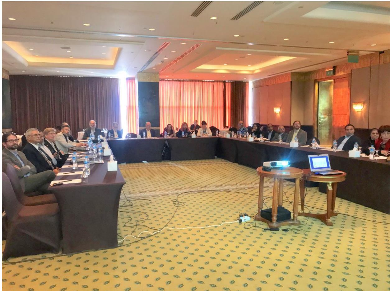
COEA Team Meeting – March, 2019

COEA Team Meetings: The activity launches brought numerous leaders, COEA key personnel, and Egyptian university leaders to Cairo. The COEA took advantage of this opportunity to host a series of team meetings to begin development of the Annual Work Plan, due within 60 days of award date (April 21). These COEA team meetings took place March 24 – 29 in Cairo at various locations and focused on ensuring alignment and integration of COEA initiatives across the entire activity and clearly defining next steps and responsibilities. The purpose of these meetings was two-fold: 1) to foster inclusiveness and facilitate input from the widest range of experts possible; and 2) to ensure integration of ideas across COEA initiatives.