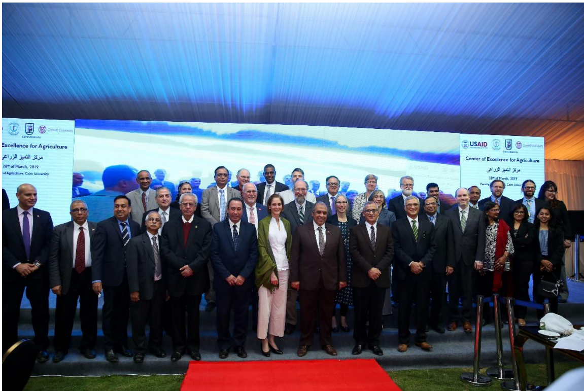
Partners and Team during the COEA Launch at CUFA