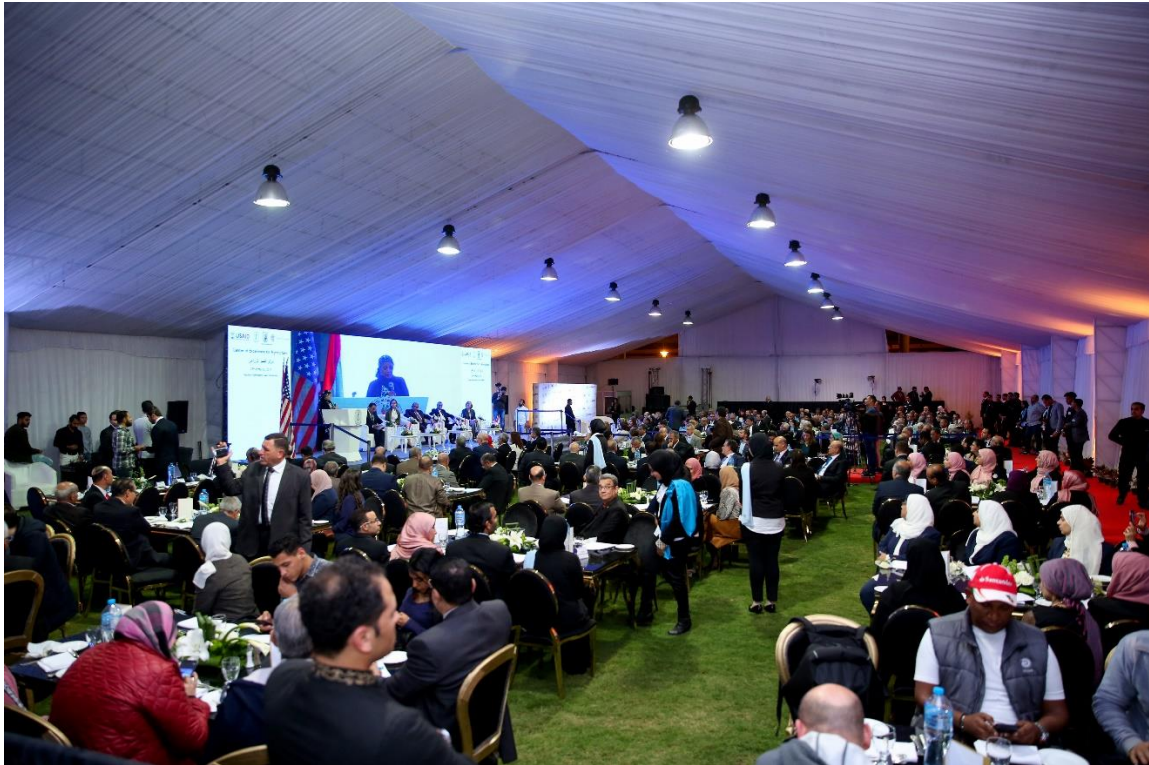
COEA Launch Ceremony at CUFA – March 28, 2019