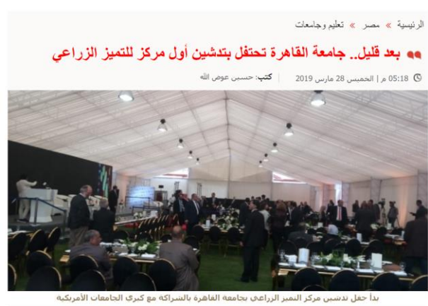
El Watan News Announcing the Launch of the COEA in Cairo University