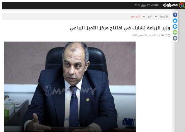
Masrawy Announcing the Launch of the COEA with H.E. The Minister of Agriculture