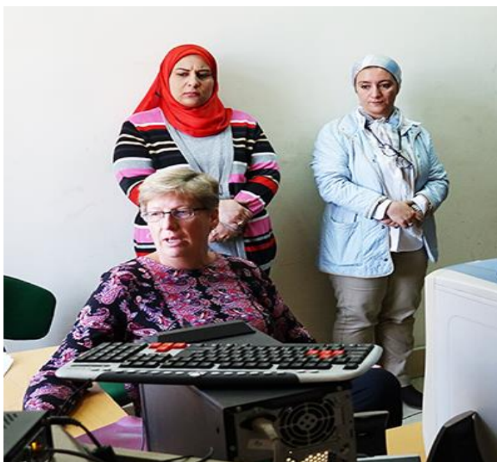
On-the-job Training to Librarians of CUFA – March 27, 2019