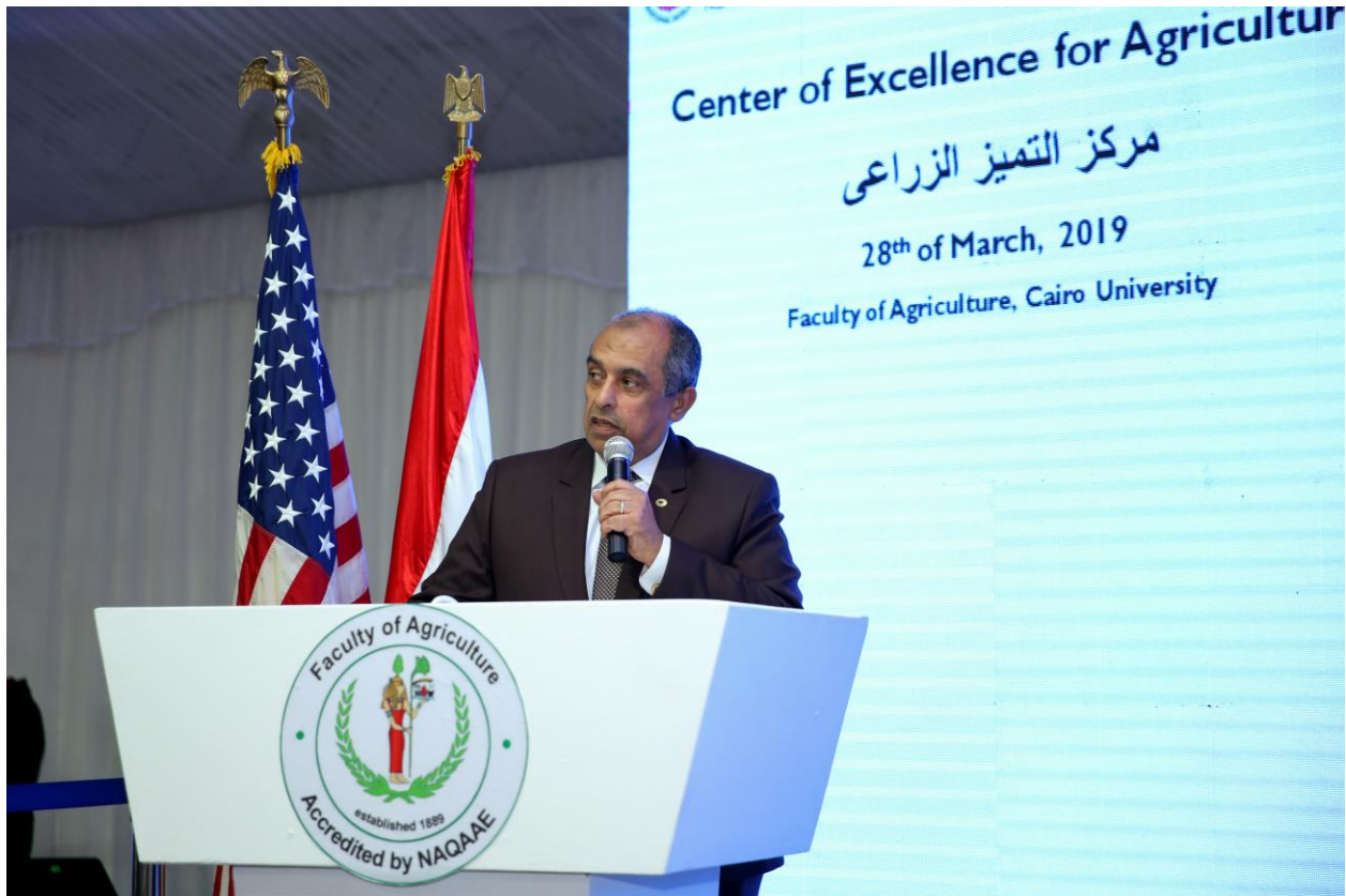
Welcome note by H.E. Minister of Agriculture at COEA Launch