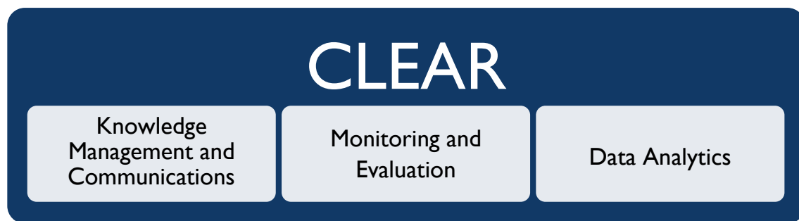
Exhibit 7. CLEAR team composition

The Monitoring and Evaluation unit is primarily responsible for all centrally managed M&E activities. This unit develops and rolls out M&E policies, procedures, tools, templates, and methods; provides training and guidance to in-country M&E personnel; and ensures data quality. The M&E unit works in close collaboration with the MIS team to ensure that ARTMIS forms and dashboards accurately capture and display indicator information. The team also works across headquarters technical and functional units to ensure that teams have the data they need to identify problems, make decisions, and evaluate progress toward the project’s objectives. Members of the M&E unit also conduct short-term technical assistance assignments in field offices, those geared toward supporting the field office’s M&E activities and those providing M&E systems strengthening support to government counterparts.