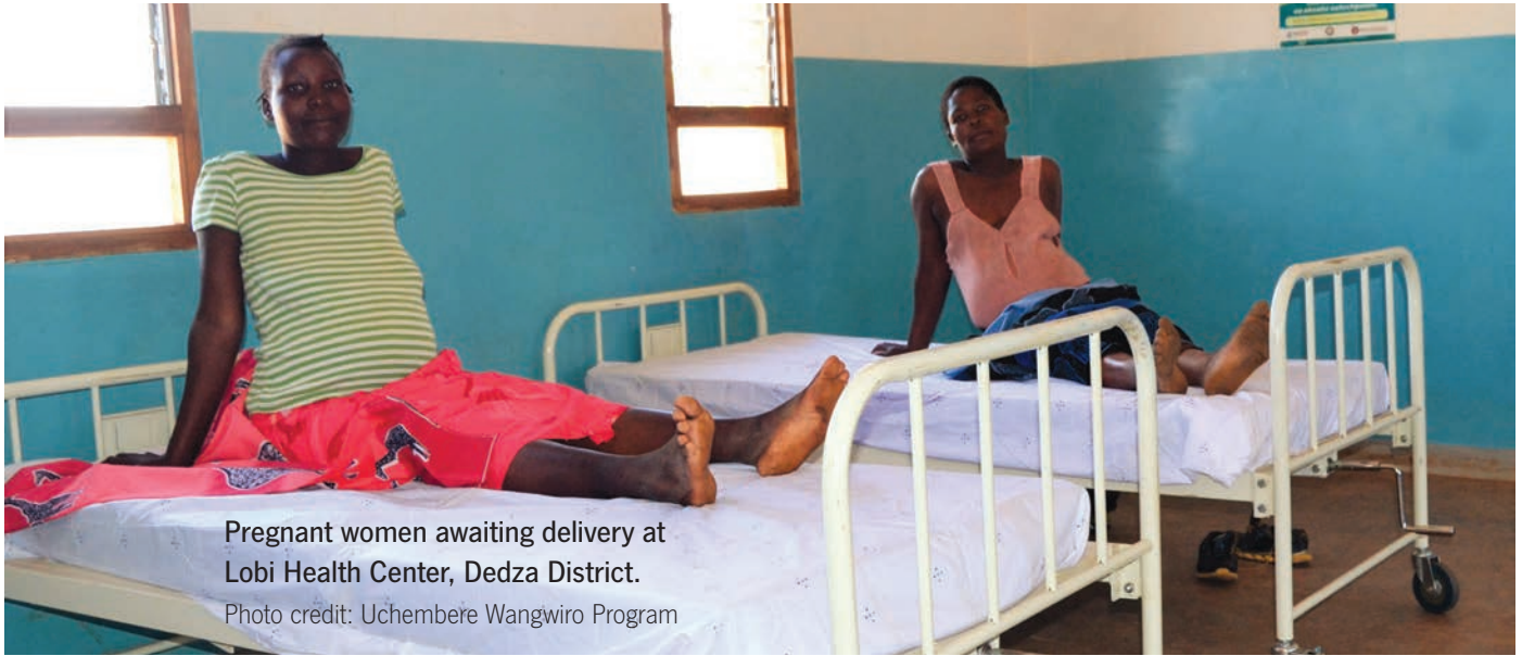
Pregnant women awaiting delivery at Lobi Health Center, Dedza District.

Respondents attributed increased caseload to several factors, some of which are related to RBF4MNH. The primary explanation for increased care-seeking, according to providers and women, was the provision of conditional cash transfers for women who deliver in facilities as part of the RBF4MNH initiative. Additionally, a national policy prohibiting the existence of traditional birth attendants and levying fines against women who have been found to engage in home birth has likely increased demand for facility-based childbirth care.