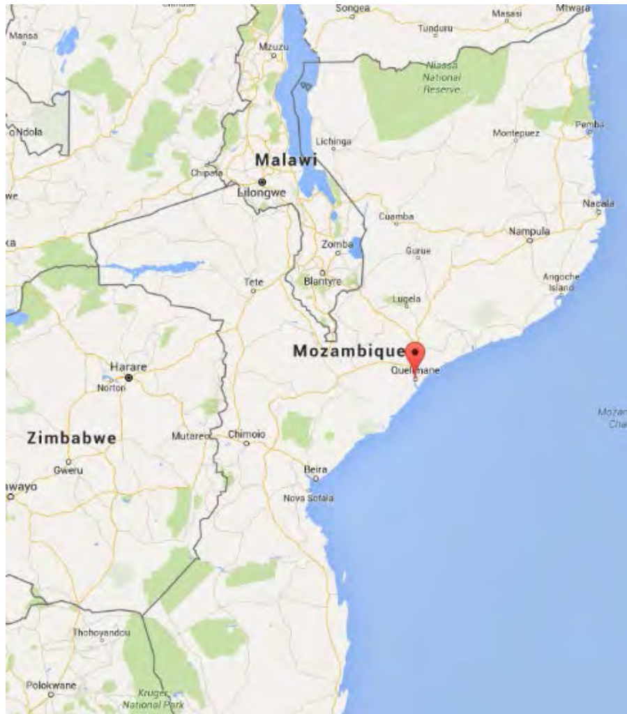
FIGURE A-1. Location of Quelimane