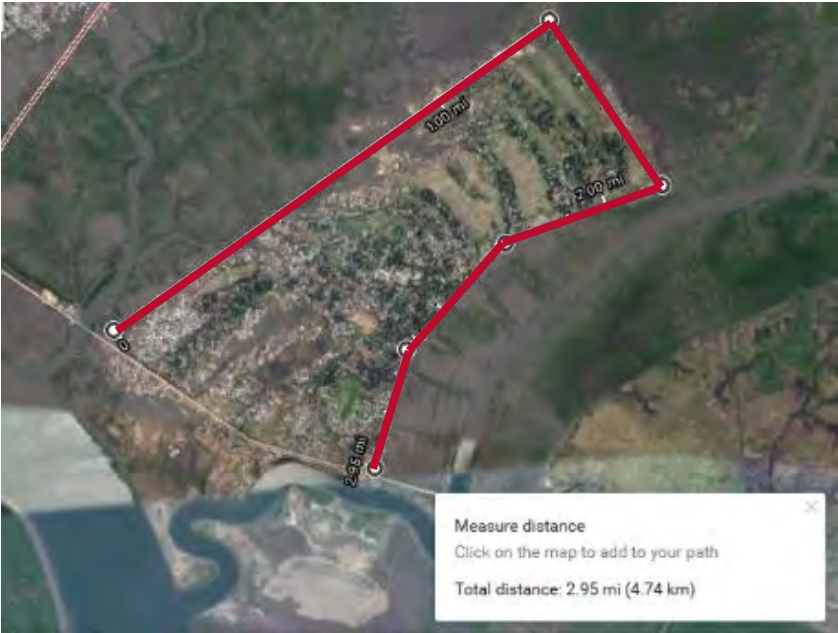
FIGURE 3. Perimeter Around Study Area for Protection from Rising Water

Following USAID (2015) guidelines for the period of analysis in a CBA, CEADIR adopted a time frame equal to the expected lifetime of the earthen dike—50 years. CEADIR used the same time horizon for mangrove restoration, which could last longer if sustainably managed. For both these cases and the without-project case, CEADIR also conducted a sensitivity analysis covering a 100-year period. In the 100-year analysis, CEADIR assumed the original earthen dike would need a full replacement in year 51.