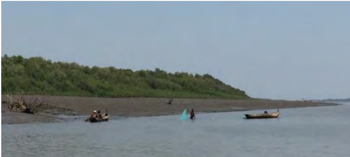
FIGURE I. Mangrove-Lined Channels in Quelimane, Mozambique