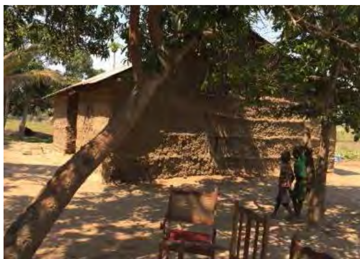
FIGURE 2. A Typical Mud and Mangrove Poles House in Mirazane