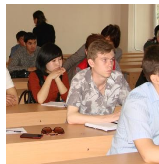
Students attending the Career Fair learned about job opportunities after they graduate.