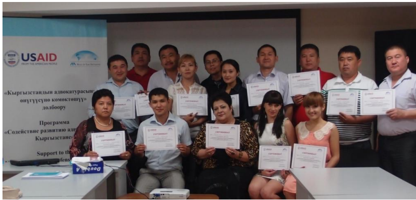
Professors hold Certificates of Completion at the TOT for newly developed practical skills courses, to be piloted in fall 2013 at six leading universities.