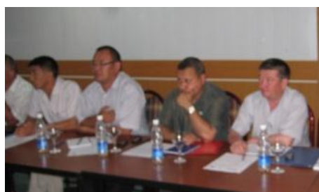
Defense attorneys attending the civil trial training learned how civil trial procedures differ from criminal trial procedures.

Participants reported that this training would be hugely helpful in their work, as many handle land law issues regularly. The trainer was also deeply involved in drafting the relevant legislation, and participants were sincerely appreciative of the opportunity to work through their questions with the ultimate expert.