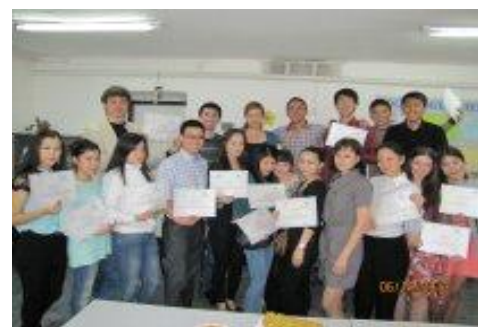
Students at the legal clinics received Certificates of Completion at the end of the academic year.

Legal clinics enable students to gain practical experience in legal representation while at the same time providing needed services to individuals who could not otherwise afford legal counsel. 2 This quarter, the six clinics supported