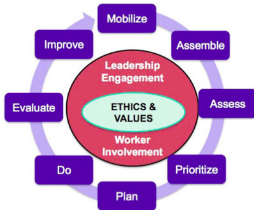
Figure 9.2 WHO Model of Healthy Workplace Continual Improvement Process