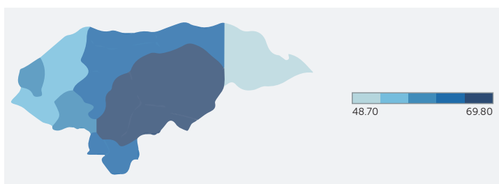
Figure 1: mCPR by Geography

CPR = contraceptive prevalence rate, TFR = total fertility rate, IUD = intrauterine device. *Women married/in union, or sexually active. **Values do not sum to 100% because 4.8% of respondents did not know the source or identified the source as "other."