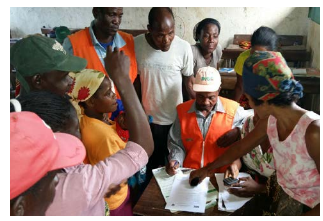
Figure 4: Training session for SIGIC data senders from Maganja da Costa community in Zambézia

CCAP initiated the process of identifying individuals and organizations with experience on economic alternatives to harvesting mangroves, particularly in the area of honey production. CCAP arranged for municipal agricultural officers, representatives from the Provincial Directorate of Land, Environment and Rural Development (DPTADR), and other stakeholders to meet with a community-based honey production association in Mopeia