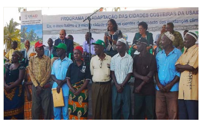
Figure 6. CCAP transferred comprehensive emergency management kits to three local disaster response committees for prepositioning in at-risk neighborhoods in Pemba. Cabo Delgado Governor Celmira Silva (right) led the ceremony to mark the handover of the emergency management kits that will help the local community to respond to extreme weather events in the city.

kits contain, among other things, bicycles, lifejackets, tools, stretchers, crank and solar-powered radios, flashlights, and tools. The kits and related training serve to improve the community's operational capacity to respond to emergencies.