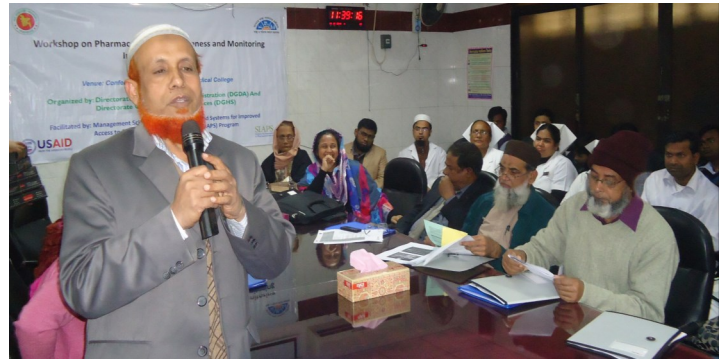
A participant at the PV workshop at Rajshahi shares his opinion.

To engage more health practitioners outside of Dhaka in the PV program, two half-day workshops were facilitated by SIAPS in the Chittagong Medical College Hospital and Rajshahi Medical College Hospital on December 1 and 14, 2014, respectively. More than 160 physicians and nurses from the hospitals, along with many private