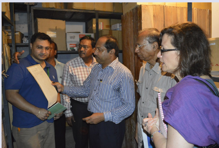
SIAPS and MaMoni team visit the Lakshmipur district health department to assess the store management system.

and supplies in the district. The situation analysis employed a combination of qualitative and quantitative data collection methods. To share the findings of the analysis, a dissemination workshop will be organized by SIAPS and MaMoni HSS where the participants will include key GOB officials, stakeholders, partners, and donors.