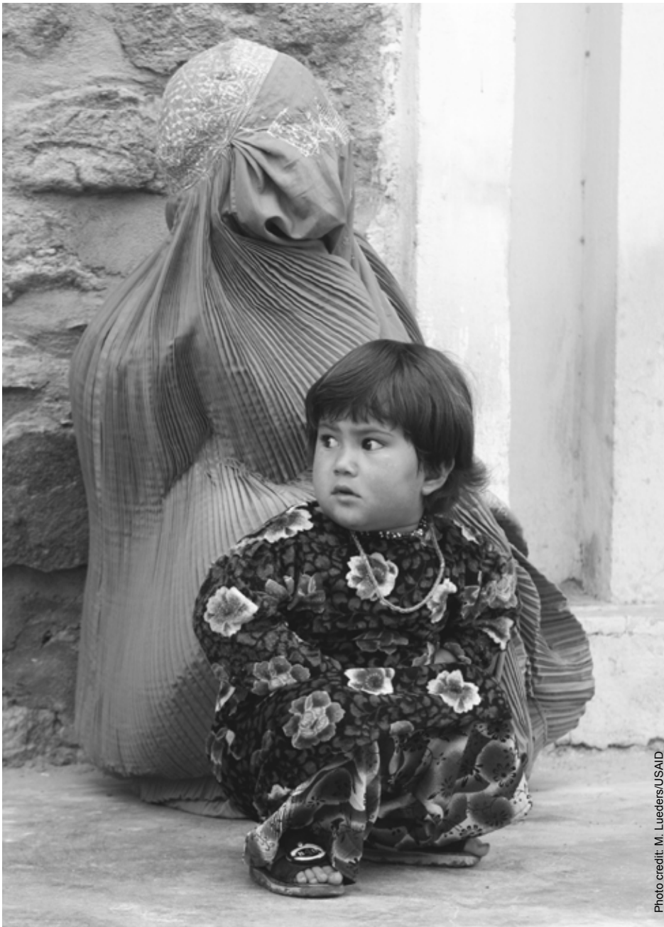
Above: Afghan woman in burqa with her child waiting outside a clinic. USAID is funding programs that educate women about vaccinations to combat the high rate of child mortality in Afghanistan.

involved in the implementation, monitoring, and analysis of program interventions wherever possible.