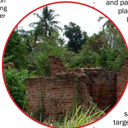
Replacing unusable sanitation infrastructure will help alleviate stresses on valued water resources