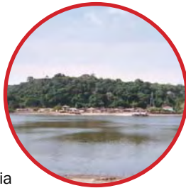
An integrated river basin management approach is helping to sustain freshwater in the Pangani and Wami Ruvu river basins

COUNTRY: Tanzania START DATE: February 2007 FUNDING: $500,000 – WADA $158,000 – USAID/Tanzania