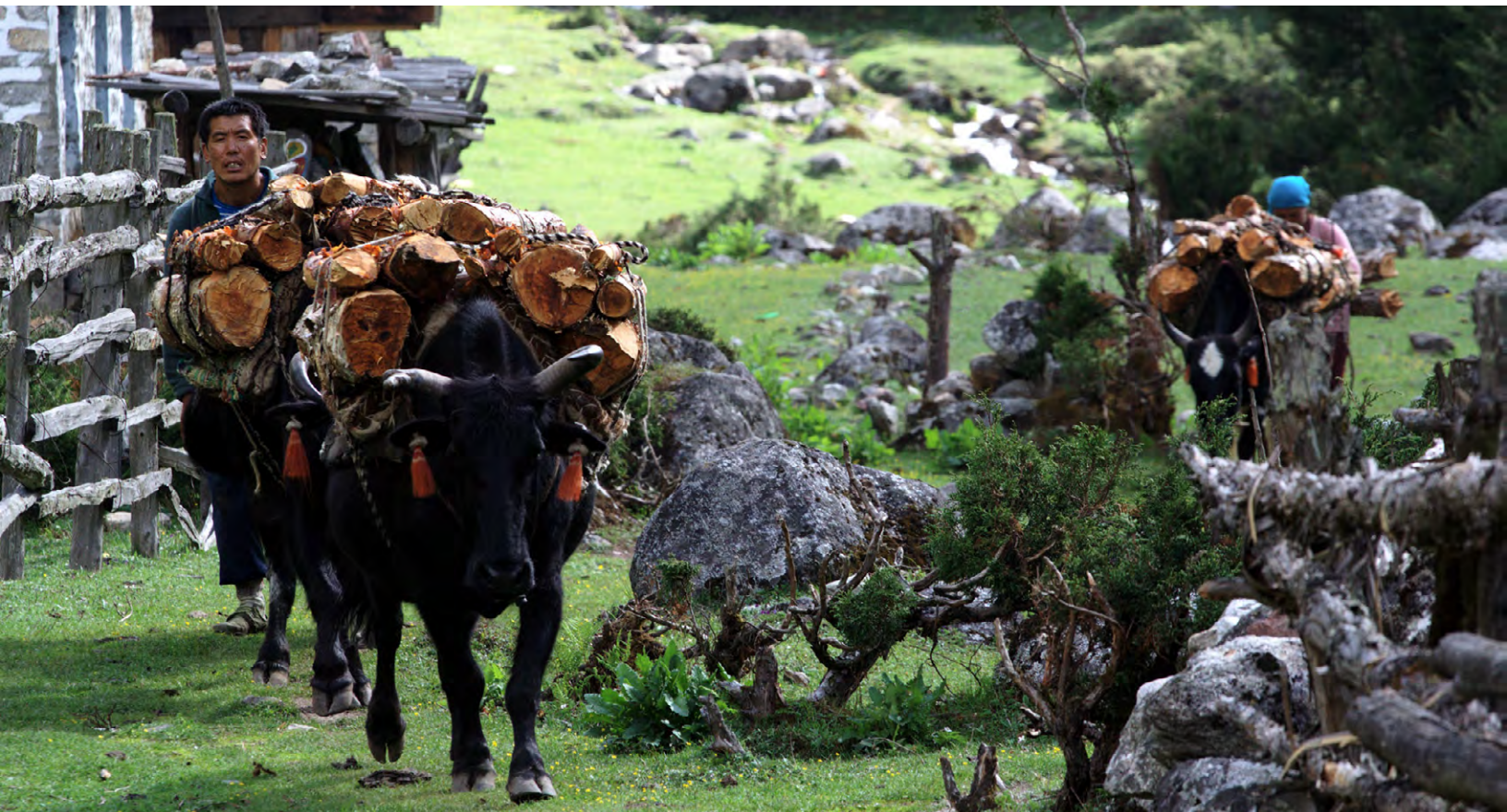
KANGCHENJUNGA CONSERVATION AREA, NEPAL, 2014: Yak herder in Kangchenjunga Conservation Area.