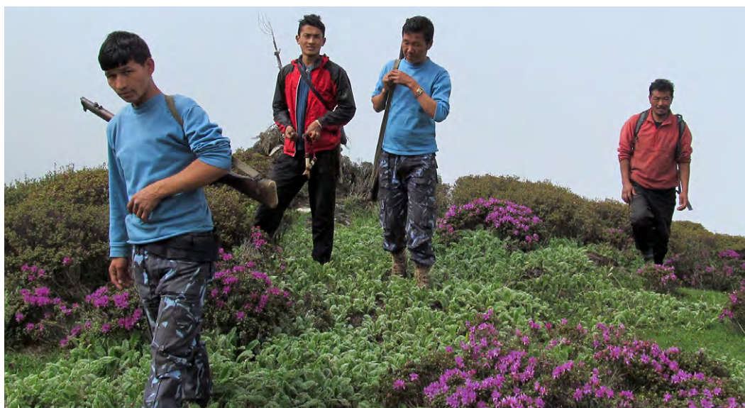
KANGCHENJUNGA CONSERVATION AREA, NEPAL, 2012: Nepal Police and community-based anti- poaching members on joint patrol.

Working at the community level was generally an asset, helping establish practical systems for monitoring conservation indicators and discouraging poaching and illegal wildlife trade. It brought its own set of challenges too. In the Khangchendzonga Biosphere Reserve of Sikkim, for example, all forests are owned and managed by the state, while Kangchenjunga Conservation Area in eastern Nepal is community managed. This meant that different priorities and decision-making styles had to be considered while the project steered the parties toward mutually agreeable solutions.