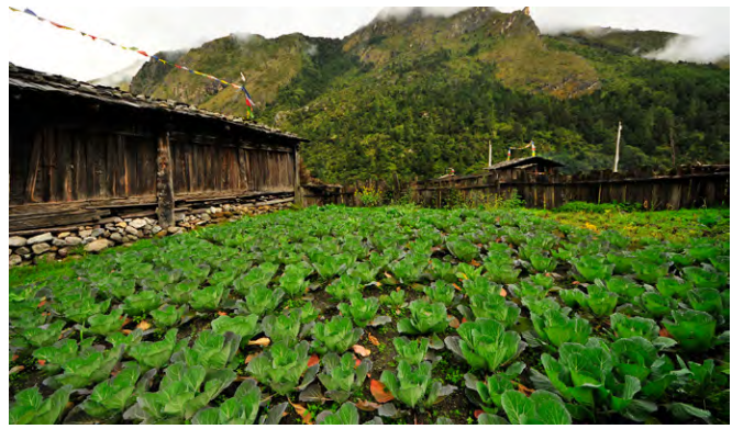
KANGCHENJUNGA, NEPAL 2011: Adaptive agriculture.

Using CARE's Climate Vulnerability and Capacity Analysis tool, the project conducted a landscape-level climate change vulnerability assessment, which led to local adaptation plans for 10 communities. In all, 4,037 people from 798 households benefited from those plans, which recommend specific strategies with respect to food and water security. "Water smart" activities include spring