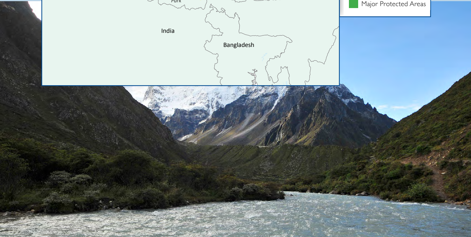
KANGCHENJUNGA CONSERVATION AREA, NEPAL, 2011: Headwater source, Kangchenjunga Conservation Area.