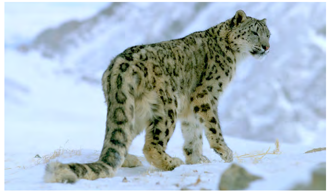
SACRED HIMALAYAN LANDSCAPE, 2015: Snow leopard.

during monsoon season because trees and other vegetation have been cleared from steep slopes. Besides degradation of the land and habitat loss, threats to the Sacred Himalayan Landscape include poaching of endangered species and human-wildlife conflict. Climate change and climate variability have the potential to amplify these challenges.