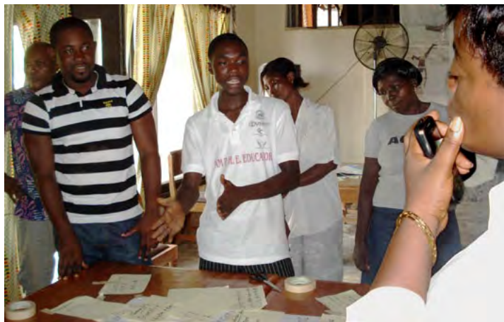
© Joan Castro Isaac in action

“For healthy people and a healthy environment, conduct PHE education two youth at a time”