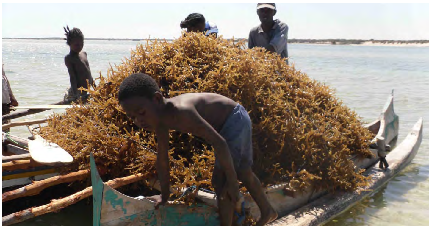
Seaweed harvest

One of the most effective management approaches pioneered in Velondriake has been the use of temporary three to four month closures of shallow reef flats to octopus fishing, which is the most economically important fishery in this region. These seasonal restrictions allow the target species ( Octopus cyanea ) to increase rapidly in size and number. Fisheries research conducted by Blue Ventures over the last seven years has shown that villages that observe these closures see a significant increase in total landings after the reserve is re-opened, see no significant change in landings while the closure is in effect, and see lasting economic and social benefits to communities (Oliver, T. pers comm.). These successful results have inspired extensive replication of similar octopus closures along the coasts both north and south of Velondriake, with well over 100 closures to date across hundreds of kilometres of coastline.