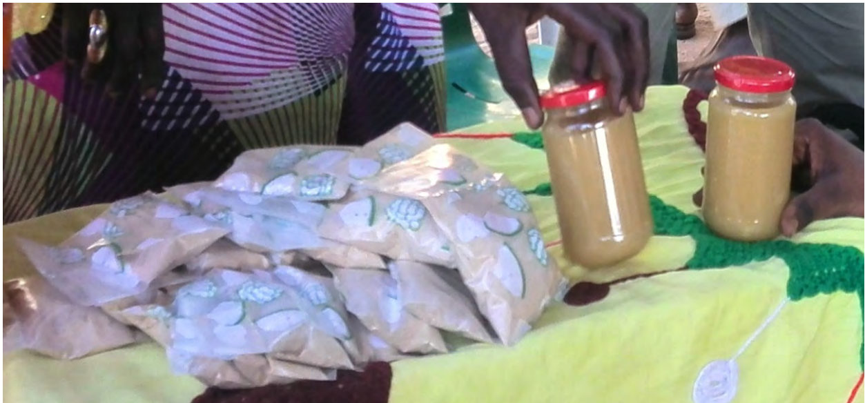
Women in the Matam Village of Ndouloumadji Dembé display enriched flour and fruit preserves they made with the support of the program.