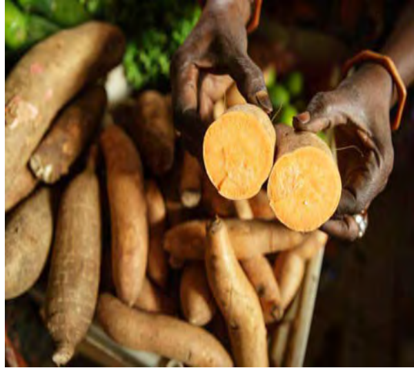
At left, sweet potato plants grow in a women-owned commercial garden in the Matam Village of Doumnga Ouro Alpha; at right, a grower shows off the orange flesh of the sweet potato. (Photos by RIG/Dakar and CLUSA, April 2014)

Further, one of the government research location equipped with a state-of-the-art drip irrigation system is, for the first time, supplying plants to private sector companies. This location produced 15 varieties of mangos; 16 citrus fruits; 4 apple varieties grown in the Sahel region, the desert area stretching from Senegal to Sudan; and 3 varieties of sweet tamarind. The program did face some challenges in grafting apples from the Sahel region because pests and wild animals damaged the grafts. In fact, only one variety of apples adapted to the local conditions resulting in a success rate of 15 percent, compared with the normal success rate of 60 percent. In Year 3, the program changed its strategy and achieved a 98 percent success rate in Kédougou and 69 percent in Bakel.