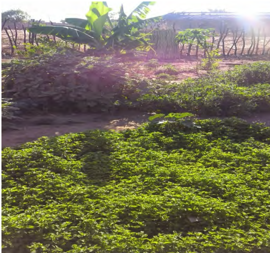
This family garden in the Matam Village of Ndouloumadji Dembé is growing peppers, onions, and eggplants. (Photo by RIG/Dakar, April 2014)