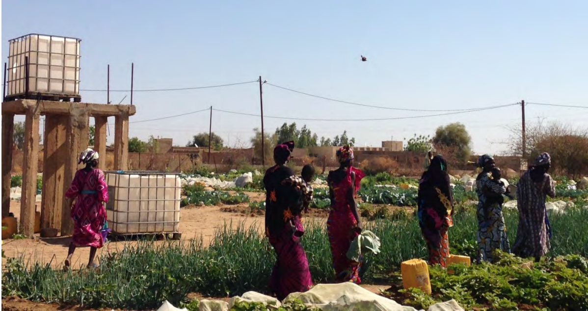
Women show RIG/DAKAR the various crops growing in their commercial garden in the Matam Village of Doumnga Ouro Alpha, where the program provided them with several types of trainings, tools, seeds, plants, and fencing. (Photo by RIG/Dakar, April 2014)

potatoes and beans). Agents also provided the women with crop maintenance and other services that they did not have access to before. Moreover, the program showed them how to dry onion, mill and enrich flour, and make jams, allowing them to preserve and sell a percentage of their harvest while still providing for their families. In addition, this garden (shown below) is providing jobs for some women who said they had never worked outside their homes.