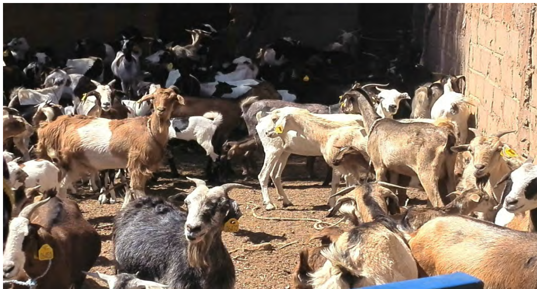
Mother-to-mother groups in the Matam Village of Loumbal Baladji gathered together goats provided to them through the program to show RIG/Dakar. (Photo by RIG/Dakar, April 2014)

Furthermore, the program placed 4,548 goats (some of which appear in the photo below) and chickens with 1,555 women involved in the program. The women are expected to give the offspring of the animals to other women in the same community. This program has provided not only milk, eggs, and meat for their families but also revenue from the sale of excess production. During our visit, all the women expressed their appreciation for the program.