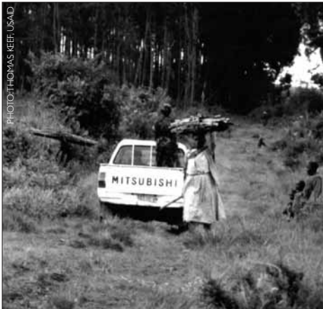
Rwanda's remaining natural forests are under pressure from an expanding population.

management on a global scale thereby promoting sustainable and responsible forest practices in countries in Asia, Africa, and Latin America. Partners in this Alliance include World Wildlife Fund, Metafore and retailers such as Home Depot and Anderson Corporation.