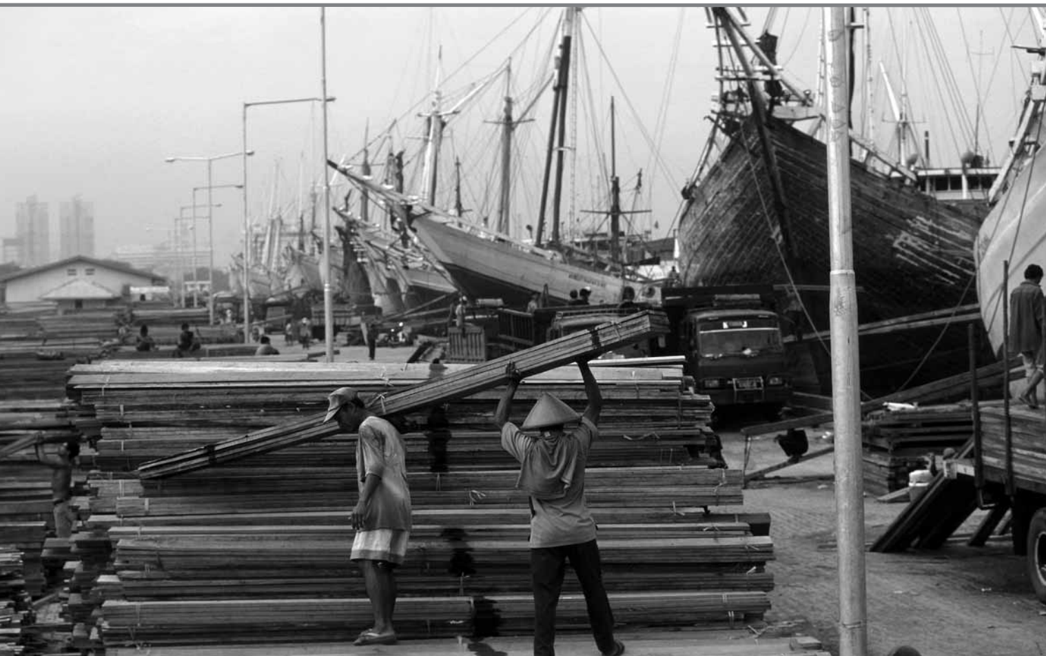
Workers unload hardwood cut from Indonesian forests at Sunda Kelapa Docks.