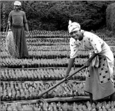
Women working for the Tanzanian Forest Ministry cultivating pine plants in a tree nursery.

Prime recipients: Associates in Rural Development, Inc. (ARD); Development Alternatives, Inc. (DAI); and, Chemonics International, Inc.