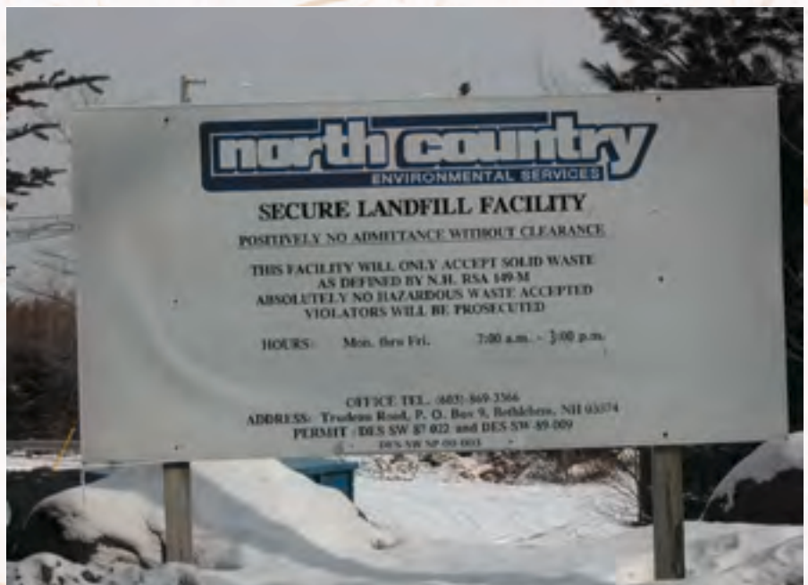
Landfill signage aids in public awareness.

A list and schedule should be developed of all closure activities that will be required before the existing disposal site can be officially closed. This will form the basis for your closure plan. This can be developed for inclusion in the RFT or developed by the selected contractor during their interim operation of the existing disposal area in anticipation of starting operations in a