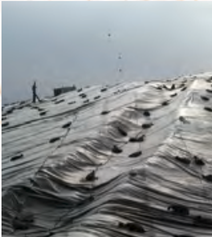
Sandbags holding down final cover.

The detailed site evaluations should make use of the above surveys and the conceptual design to determine the conformance of the sites to the developed criteria. These tasks may be delegated to your contractor after execution of the contract. This work may be accomplished by the contractor with your input to provide all of the information necessary for final decisions relative to the selection of a new site. During the time that they are assisting in the site selection process, the contractor may be required to operate the existing disposal site. This interim operation could also include required improvements that are defined in the RFT.