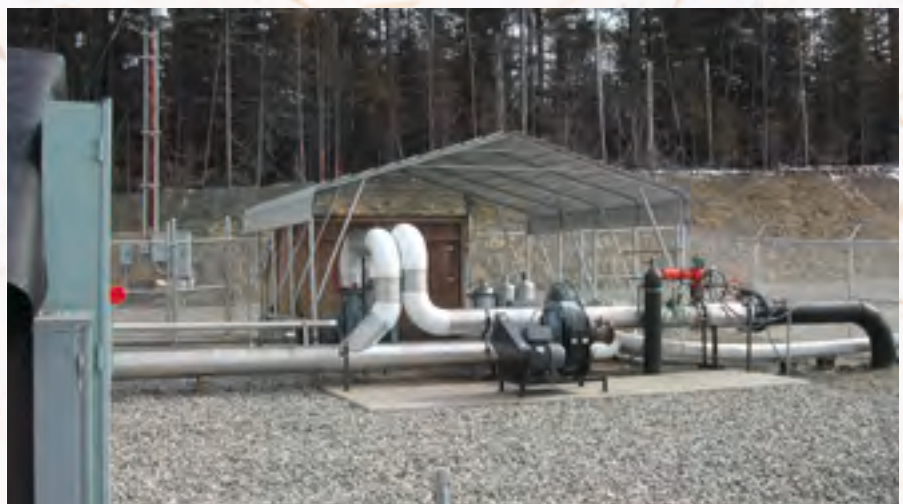
Landfill gas header.