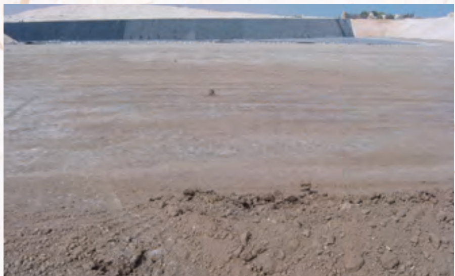
Phase I Construction of the Alexandria Landfill.

This chapter will attempt to define sound practices for new or expanded disposal areas in Egypt.