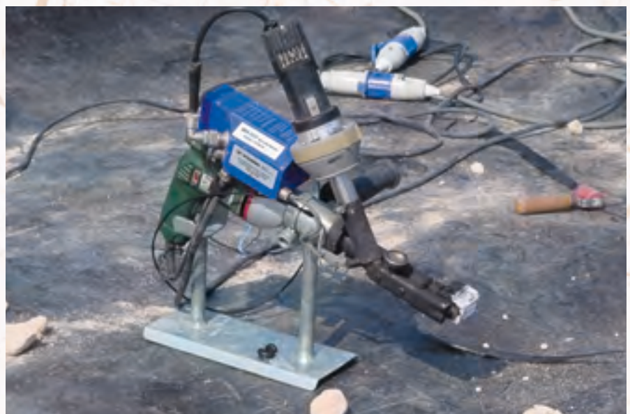
Landfill liner extrusion welder.

The full cost of current disposal practices should be determined and analyzed. This will facilitate understanding the increased costs associated with improved disposal standards established in the RFT. This analysis should include all costs of permanent staff and equipment as well as costs associated with any temporary services used at the disposal site. Full cost accounting