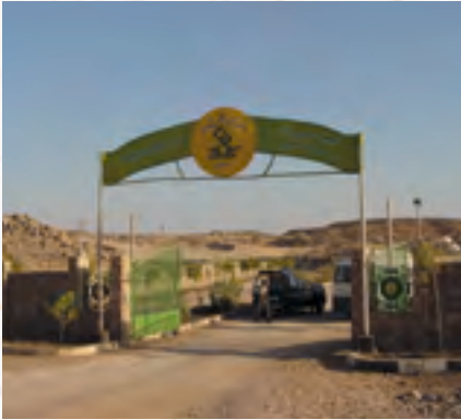
Landfill entrance control.