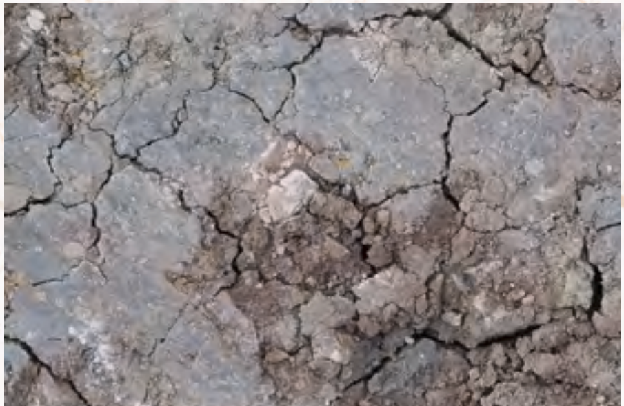
Desiccation cracks in soil.