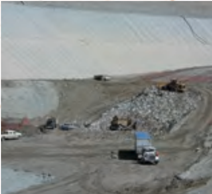
Landfill working face.

3. Groundwater flow direction: Groundwater flow direction is important in determining the potential for transport of pollutants to nearby, down-gradient receptors, such as the people who use downstream wells and springs. The potential health effect of pollutants is decreased if the flow of groundwater that has been exposed to contaminants is away from potential receptor sites. Similarly, the natural dispersion of pollutants in groundwater flow usually decreases the concentration of the pollutant as it travels away from the point of origin. This emphasizes the importance of minimum separation distances from pollution sources to potential receptor sites such as wells and springs.