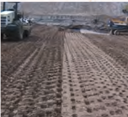
Compacting the soil liner.