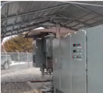
Landfill gas control.