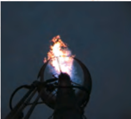
Landfill gas open flare.

The size of the active waste receipt area or workface depends on the number of trucks at the landfill at any one time. Different truck designs affect the time that it takes to empty the truck at the disposal site. It often takes more time to empty a small static bed truck than it does to empty a large capacity waste packer that can eject its payload in a short time. The function and technical characteristics of the waste collection system greatly influences operations at the landfill. Because of this, the technical specifications for the collection sys-