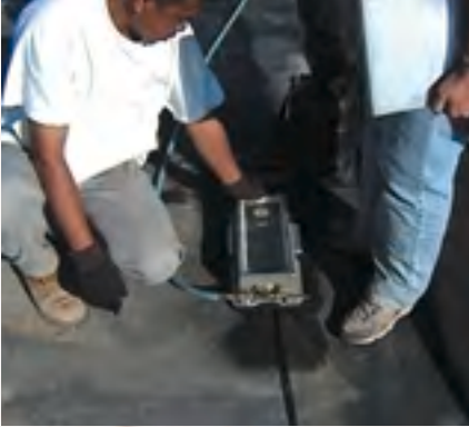
Landfill liner seam test.