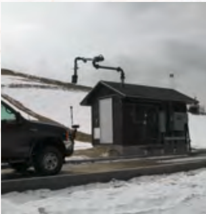
Leachate control station.

If there is concern that landfill gas may migrate from the site to nearby residences or other adjoining land-uses, ongoing testing for landfill gas may also be required. If landfill gas and leachate migration monitoring is not required, you should plan to, at a minimum, periodically visit the site to make sure that all waste remains covered and that there are no other specific issues that have arisen at the disposal area that must be addressed. Examples of such a situation would be the breaching of security fencing or the erosion of landfill surfaces that expose the solid waste contained in the landfill.