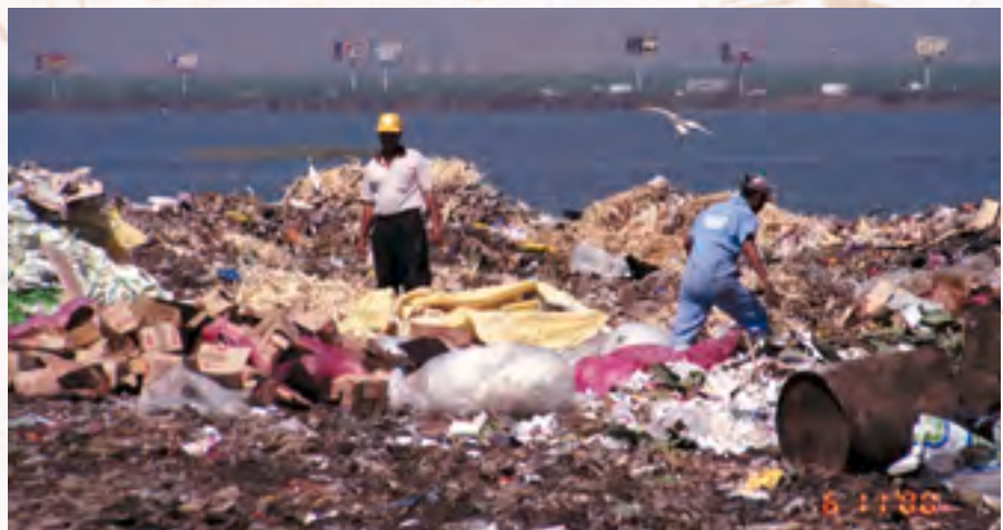
Open dump scavengers.