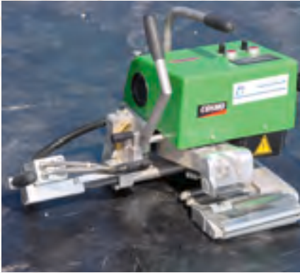
HDPE liner welding machine.

There is a limit, however, to what you can or should require your contractor to do. Experience has shown that it is often very difficult for private contractors to identify and secure new disposal facility sites. The task of finding a new disposal site may best be accomplished by the governorate prior to or during the development of the RFT, as the governorate has greater sensitivity to the political and social issues that will be important in the siting process.