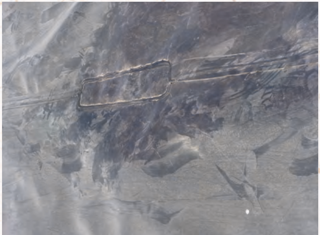
Landfill liner repair patch.