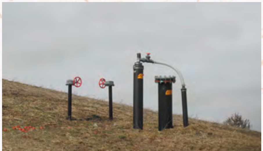
Landfill gas well head.

To maximize the use of designed airspace, you may want to specify a required minimum level of compaction in the RFT. This may consist of a minimum compaction rate or through stipulation of the characteristics of equipment to be used to achieve a reasonable level of compaction.