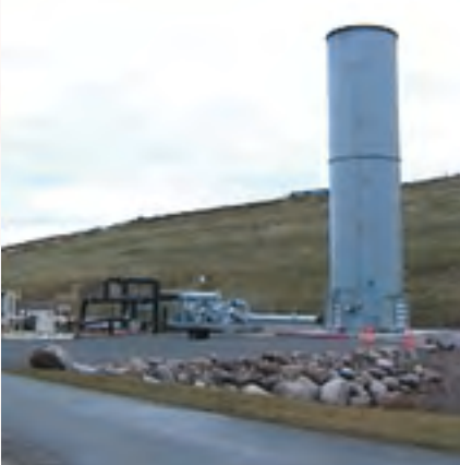
Enclosed landfill gas flare.