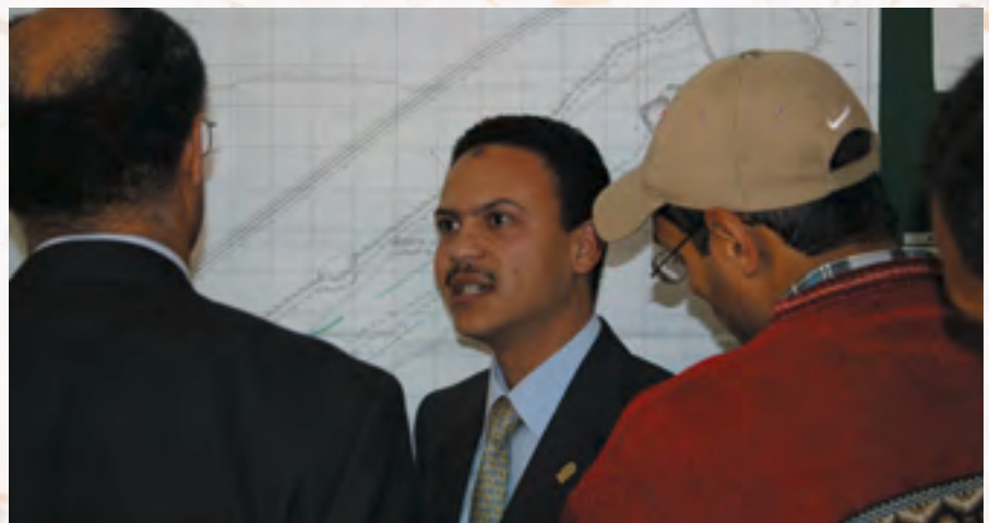
Public awareness and communications.