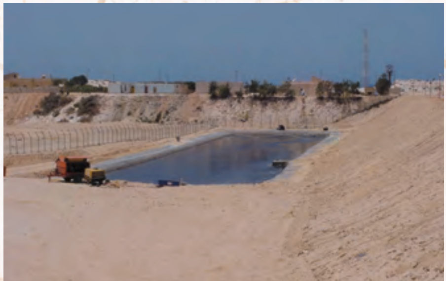
Leachate collection pond.