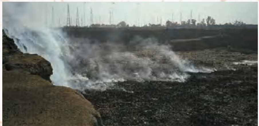
Uncontrolled open dump fire.