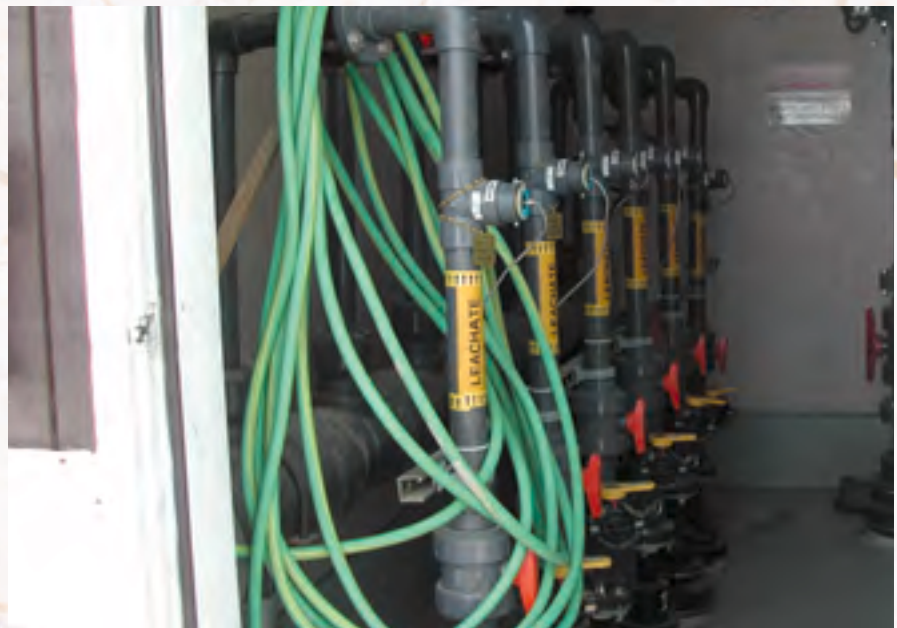
Leachate control system.