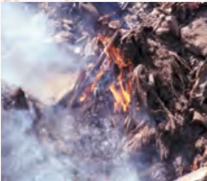
Open dump fire.

Constraint mapping identifies areas where restrictive siting criteria would not allow location of a new disposal site. Use a base map of the service area (or area of evaluation if the new disposal site can be located outside of your service area) as a starting point, and eliminate portions of the evaluation area where siting criteria cannot be met. For example, selected siting criteria may identify any area within a certain distance from a natural waterway such as a river as unacceptable. If this is the case, the area within the stipulated distance of any major waterway can be shaded as unacceptable on the constraint map. By applying all siting criteria to the base map, the areas that do conform to the siting criteria will become evident. These areas will then serve as the focal point for evaluating specific sites that may exist within the acceptable area.