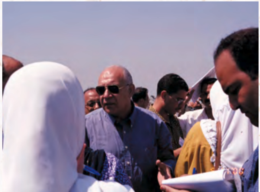
Continuous staff training is part of landfill operations.