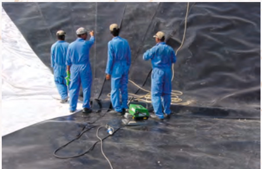
Liner installation team.