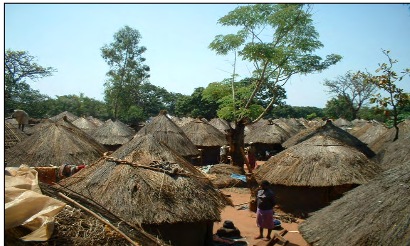
Figure 2: Typical camp scene, Kitgum District

Huts in the camps are positioned very close together with no physical divisions or defined household plots. This increases the risk of fire spreading rapidly and the burned remains of huts can be observed in some camps. Depending on a household's size and economic status, one hut may serve as both a kitchen and sleeping shelter, or there may be a separate hut used specifically for cooking.