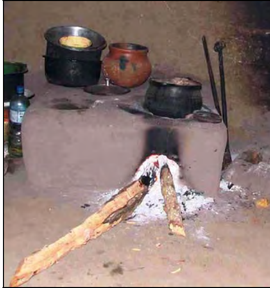
Figure 7: Typical 2-pot Lorena stove in a Ugandan IDP camp

Although the Lorena stove has not been widely promoted in Africa, it was taken up in Uganda by NGOs during the 1990s. In fact, it has been the dominant firewood stove promoted in the country over the last 15 years and even figures in educational programs in schools. The word “lorena” is now often used in Uganda as a generic term to describe a fuel-saving stove, irrespective of the design.