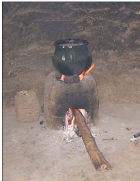
Figure 10: 6-brick stove plastered and installed in an IDP kitchen