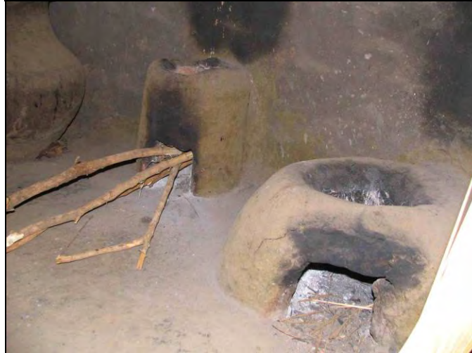
Figure 6: Nang'a charcoal stove (at right)