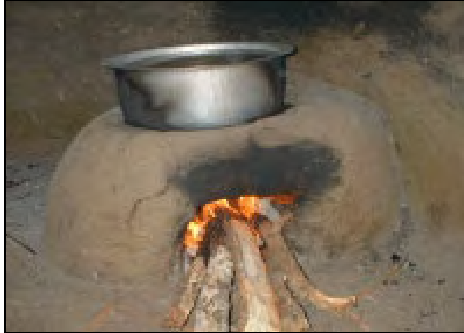
Figure 4: Traditional Luo mud-stove in Northern Uganda IDP camp