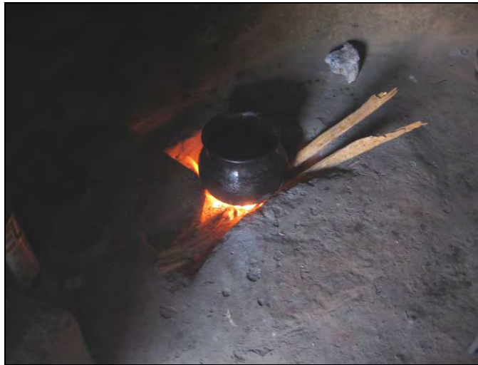
Figure 5: Trench fire, also known as the “Bylaw” stove 3 , in Northern Uganda IDP camp

Charcoal use is slowly penetrating the IDP camps. Unlike firewood, charcoal cannot burn directly on the ground and needs to be elevated by a grate on which charcoal lumps burn and glow. Often these stoves are made by the owner taking a traditional firewood stove and adding his or her own metal grate. In Northern Uganda, a bicycle sprocket ( Nang'a ) frequently serves as the grate, inserted into a traditional mud stove to convert it to charcoal use (see Figure 6).