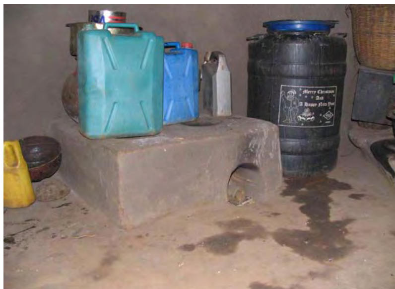
Figure 11: Lorena stove being used for storage

The one feature of the Lorena that some users seem to appreciate is the second pot hole, on which they can pre-heat water for cooking or other purposes under certain conditions. But this feature is also allowed for in traditional cooking systems simply by placing one pot on top of another or at the side of the fire, and is not an attribute unique to the Lorena. Although Lorena stoves have a second and sometimes a third hole, these will be useful only if the first hole is completely covered or closed off by the pan, which did not seem to be the norm in the camps visited for the evaluation.