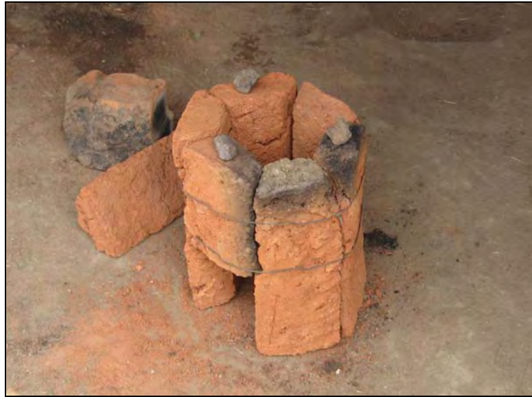
Figure 9: 6-brick stove assembled and awaiting collection

addition, the protective mud/clay covering (the “elbow”) that attaches to the stove body and encloses the fuelwood had also been discarded. Pots rest on three small stones placed at the top of the stove to allow for improved air circulation.