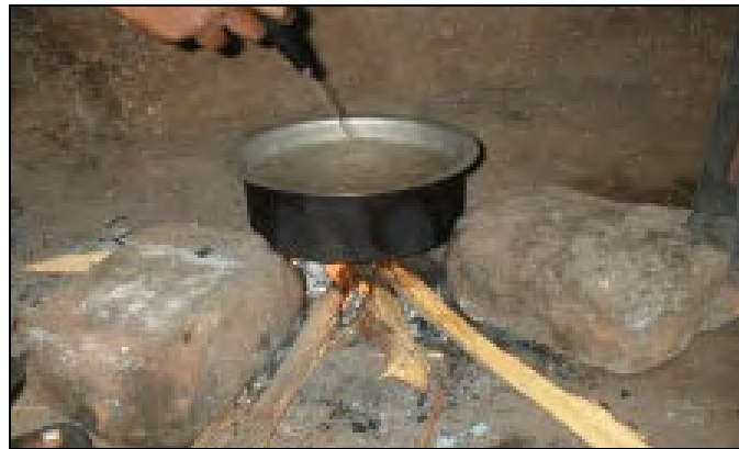
Figure 3: 3-stone fire

The dominant traditional cooking system in developing countries is known as the “3-stone fire”. This is one of the simplest forms of cooking technology and is highly adaptable, as it can use many types of fuel (firewood, crop residues, dung, leaves) and any type or size of cooking pot (metal or clay, flat- or round-bottomed). The 3-stone fire consists of a cooking pot resting upon three stones or bricks which surround an open flame. It is free to build, simple to use and can serve various non-cooking functions (such as provide a social gathering point). However, depending upon the cook’s skill, the 3-stone fire may require a lot of fuel, generate a lot of smoke, and present considerable safety risks from fires or burns. In IDP situations, where natural resources (such as wood) may be scarce, respiratory illness common and living quarters cramped and highly flammable, these are serious concerns.