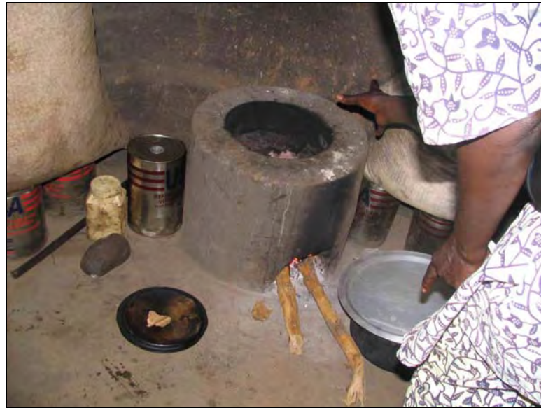
Figure 8: Molded 1-pot mud stove, promoted by NGO C in Gulu and Kitgum

In addition to its one-pot mud stove, NGO C promotes a two-pot stove referred to as a “Rocket Lorena,” also designed by GTZ’s Energy Advisory Project. This stove was developed due to reservations about the suitability and efficiency of the original Lorena, and incorporates rocket principles into the basic Lorena shape. Camp residents are free to select between the 1-pot molded stove and the 2-pot Rocket Lorena; at the time of the evaluation, 262 one-pot stoves had been disseminated, compared to only 6 two-pot stoves. This disproportionate response likely reflects user preference for smaller stoves that take up less room in cramped huts.