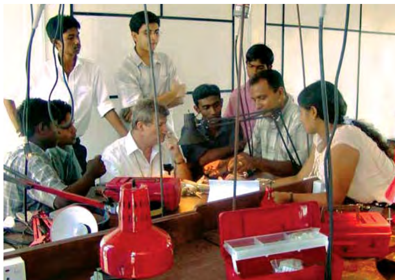
J.E. AUSTIN ASSOCIATES, INC.

Most poor countries have learned the principal macroeconomic lessons and made the basic reforms. As more and more governments have come to recognize the harm imposed by high inflation, for example, hyperinflation has almost disappeared. In fact, most countries have reduced inflation below 10 percent. The previously widespread and damaging use of multiple exchange rates has also become rare. In addition, most governments have learned that stability requires that deficits be controlled, and that openness to the international economy contributes to growth.